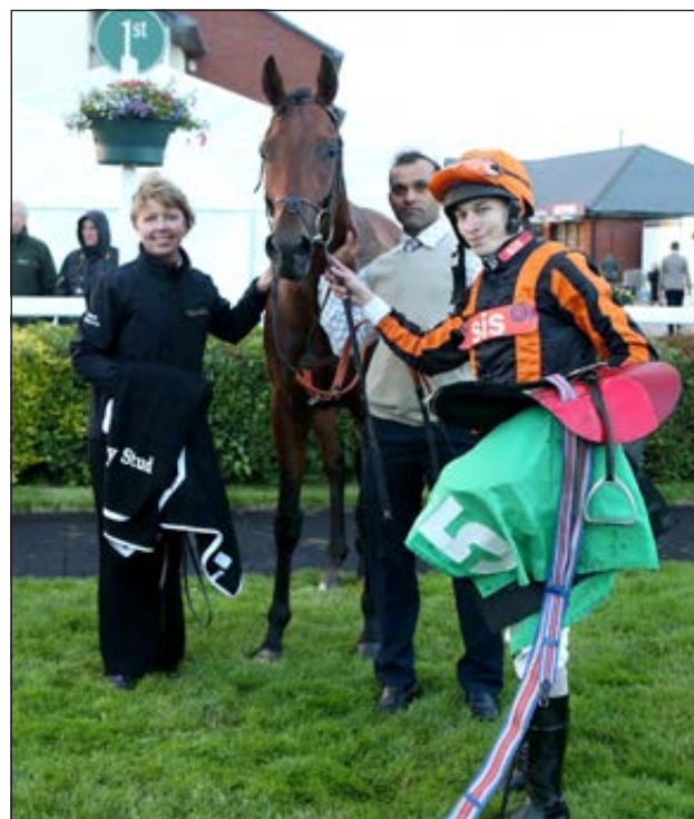
VANISHING POINT makes the long journey worthwhile with a win at Carlisle

This Is For You won a Chepstow maiden last August and has been placed on three occasions in handicap company this season without getting his head in front. However, he is coming down to a mark off which he really should be winning. Verne Castle is bred to be useful and shows