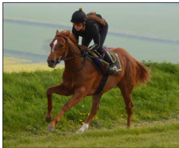
LEONTES, a 33,000gns purchase, has already picked up almost £40,000 in prize money and Plus 10 bonuses this season