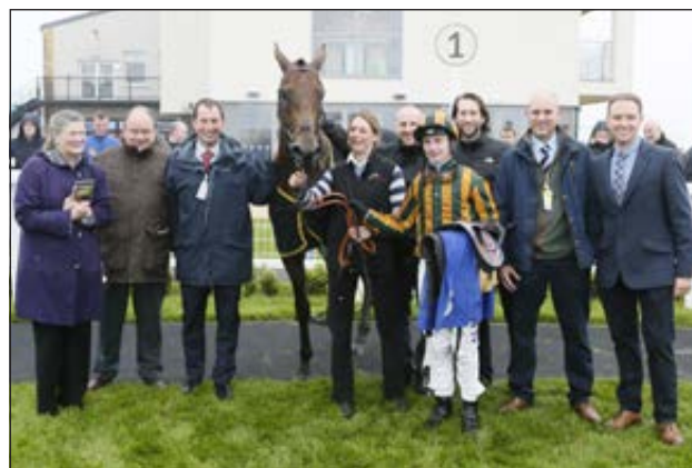
EMPEROR NAPOLEON and his many fans after success at a rather soggy Bath

I have always thought plenty of Kingston Kurrajong and last year's Chester maiden winner has been in good form this summer, winning in good company in soft ground at Windsor before a fine effort in a valuable handicap at Ascot. He is quietly progressive and there is more to come, possibly upped to 1m2f. Both Sides got off the mark over that trip at Chelmsford in the spring and has been very unlucky not to get his head in front in handicap company