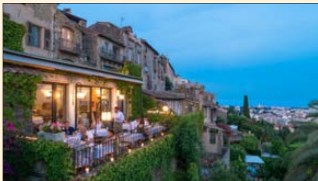
Le Cagnard, Cagnes-Sur-Mer, France

Here he gives us his top ten foreign racecourses, together with his recommendations for eating out should you find yourself with a runner at one of them!