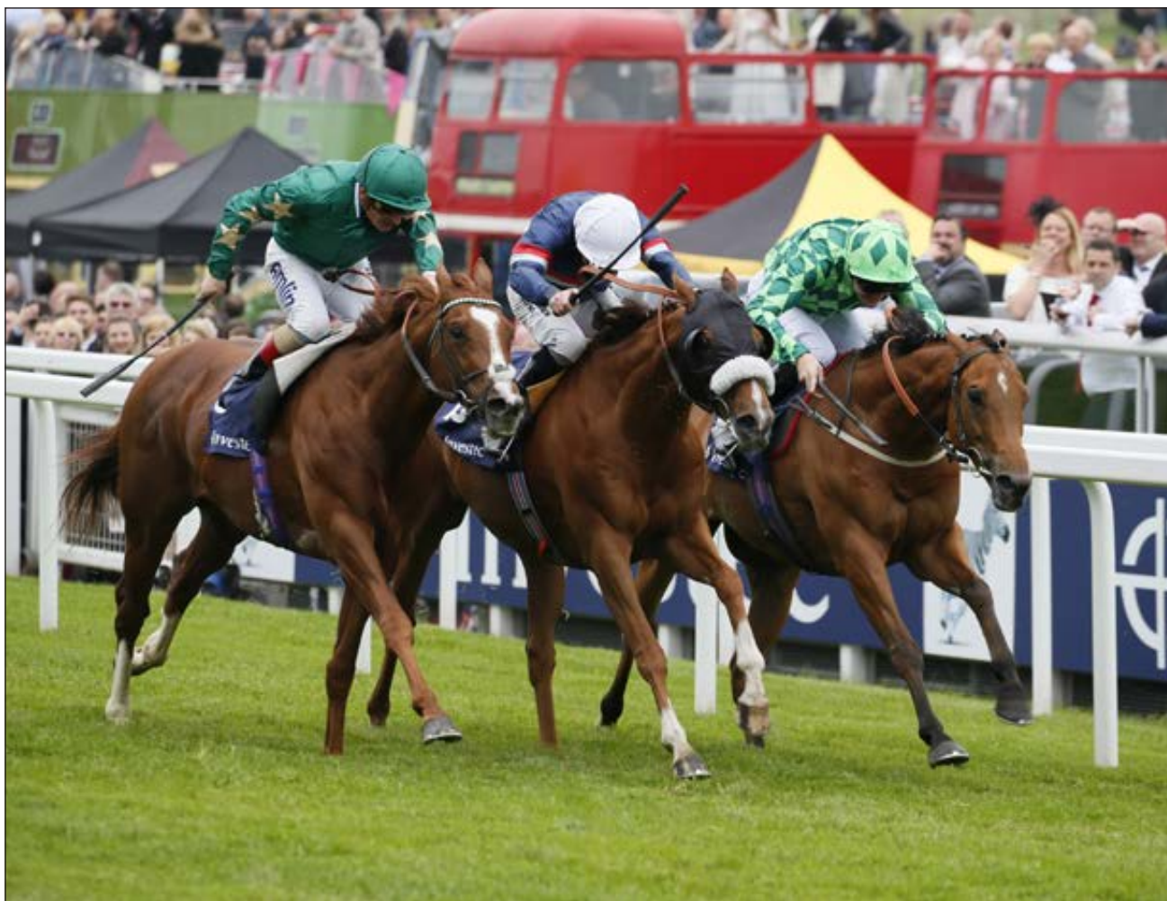
TULLIUS battles to the front in the Diomed