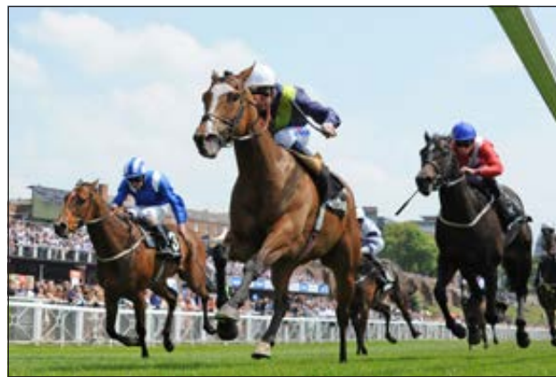
The speedy SECRET HINT wins on the Roodeye

I had high hopes for Havisham this year, particularly following his breakthrough win at Bath in May in second-time cheekpieces, but unfortunately he picked up a knock in the Queen Alexandra at Royal Ascot. There is a nice handicap in him off his mark when he returns later in the year.