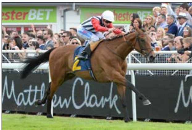
MAN LOOK records his second success of the season, at Chester