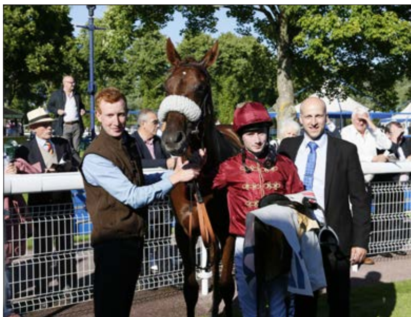
SOUTH SEAS is a tremendously exciting prospect

had been one place in front of him at Sandown. However, a foot infection has since come to light and I am confident that he can bounce back in a good race when he returns, as he is a very useful individual.