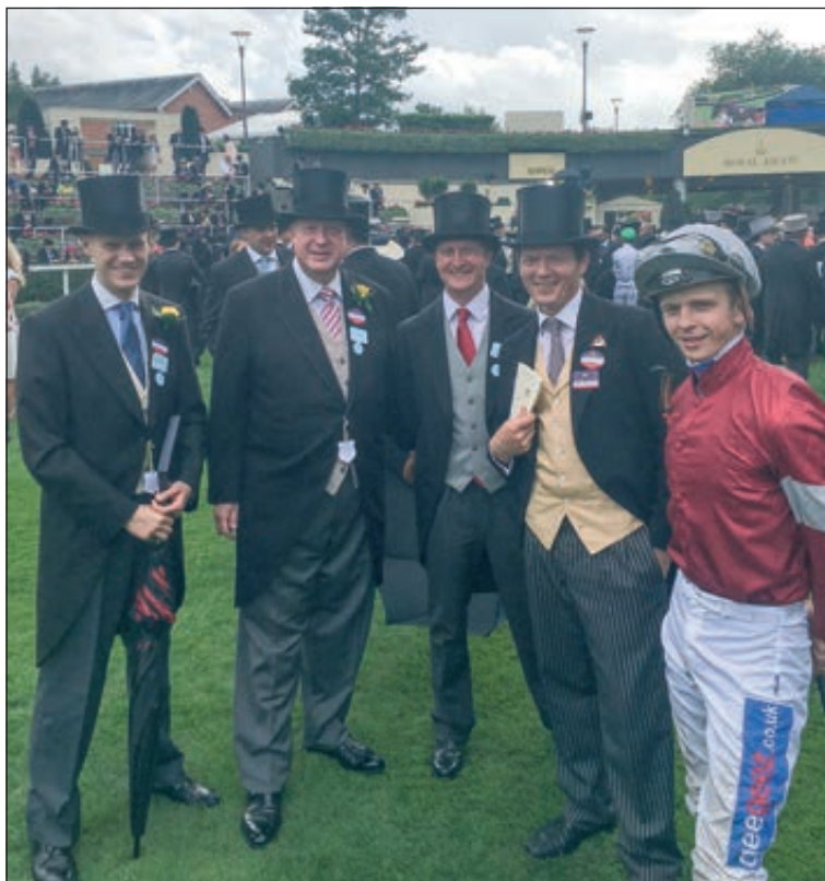
Connections of LEONTES at Royal Ascot

Another very satisfying aspect of the season so far has been the emergence of some very exciting two year olds. South Seas, Isomer, Perfect Angel, Bohemian Flame and Leontes all feature in Timeform's top fifty rated juveniles. Happily we still have a number of horses who have not yet raced or who have yet to show their true potential, so I would be fairly confident that we can add to this list by the end of the season. It is difficult not to sound too triumphant about the 2016 season but to date it has been one to savour and with another three months of the turf season remaining we will be pushing hard to make it a record breaking one, both in terms of the number of winners and the total prize money won. ■