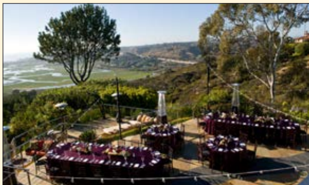
Pamplemousse, Del Mar, California, USA