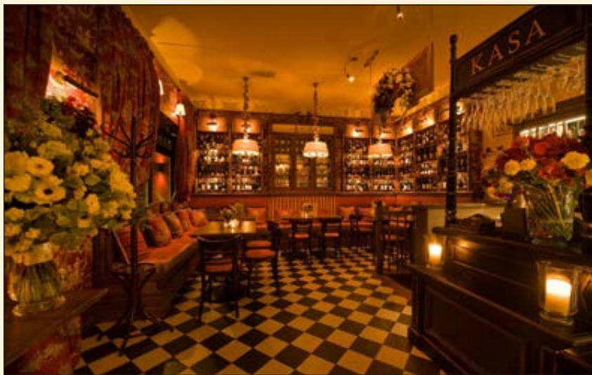
Stary Dom, Warsaw, Poland