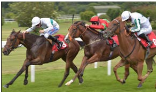
NIGHT LAW emulates her mother with victory at Sandown

Farleigh Mac got off the mark at the second attempt, securing a particularly meaningful win in the Toby Balding Memorial stakes at Salisbury. He was unable to handle the step up in grade to Listed company on his only subsequent start, but is a nice type who will improve with time and can make his mark in nurseries this summer.