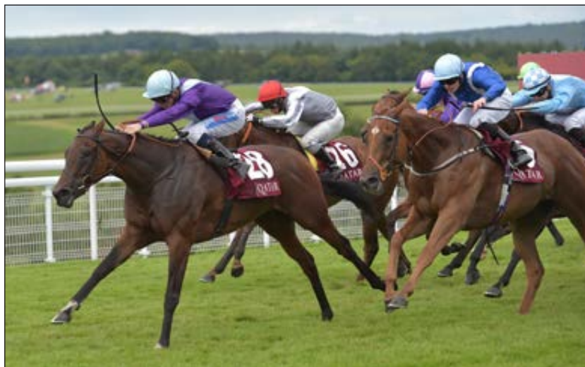
DANCING STAR emulates her great-aunt Lochsong in landing the Stewards' Cup at Glorious Goodwood

All three of Guiding Light's wins have come at Chepstow and he could return there in a bid for win number four at the Welsh course in September, having picked up a little knock following a good run at Ffos Las