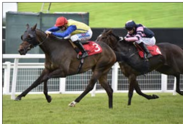
ABLE JACK shows his ability at Sandown