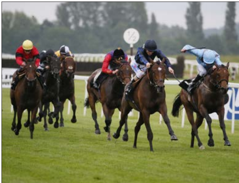
BLUFF CRAG wins at Newbury on handicap debut

Nodachi has plenty of ability and looked a winner-in-waiting when denied by just a short-head at Goodwood