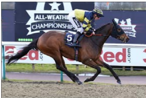
ROSE ABOVE rises above her opposition at Lingfield

winner in 2014, he has been in the form of his life at home recently and I hope that we can find some soft ground for him in August as there could be a big race in him in the coming months.