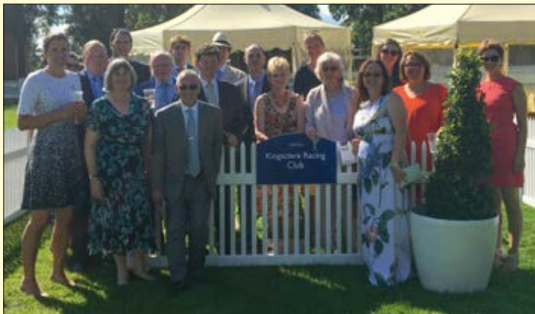
Fine weather for a picnic: KRC members at Ascot on King George day