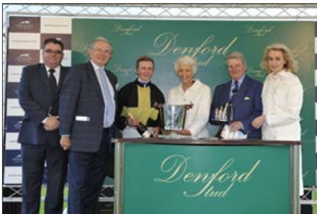
A happy crew: FORT JEFFERSON'S connections at Newbury