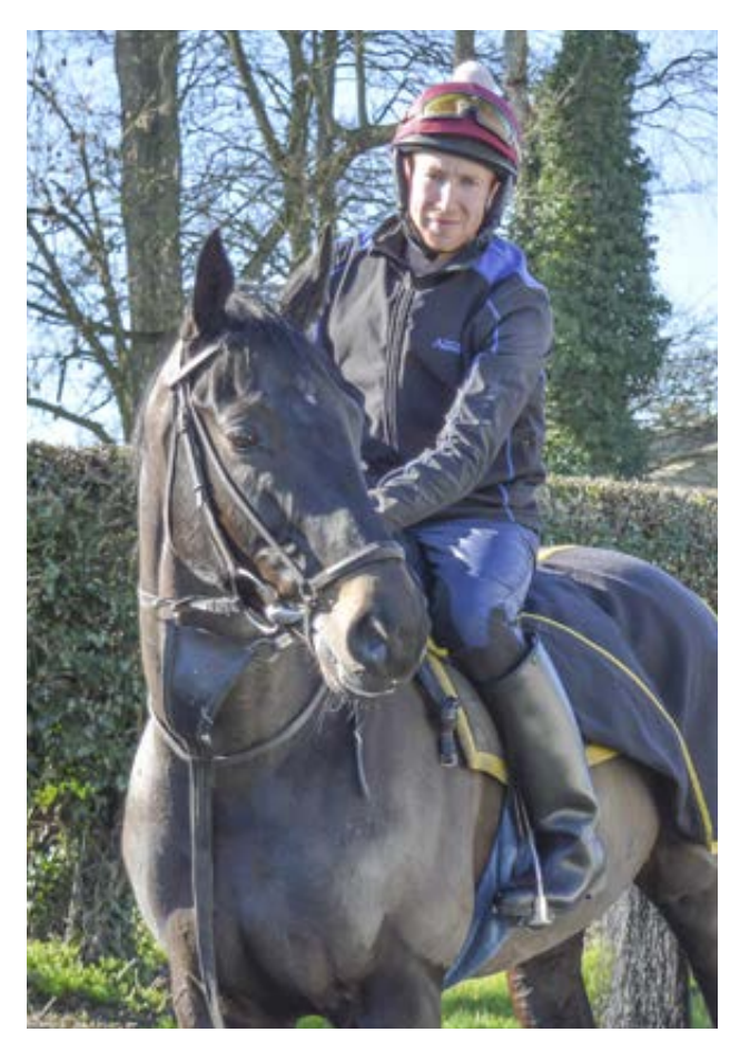
SCOTLAND enjoying some winter sunshine

Here Comes When is a very high-class horse when conditions are in his favour, as shown when winning two Group 2 contests in the autumn of 2014. He ran some good races in defeat last year, notably when runner-up in the Bet365 Mile at Sandown Park and fourth in the Group 1 Sussex Stakes, but was unable to get his head in front and we took the decision to give him a breathing operation