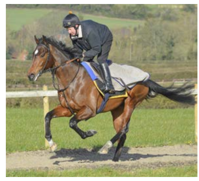
BLUFF CRAG looks to have progressed over the winter

French Legend showed little in three starts in the autumn, but the daughter of Pour Moi looks sure to improve and I am confident she is capable of winning off her opening mark, as is Bluff Crag , who in contrast showed plenty in his three runs in maidens and, having been gelded, looks another that is likely to progress.