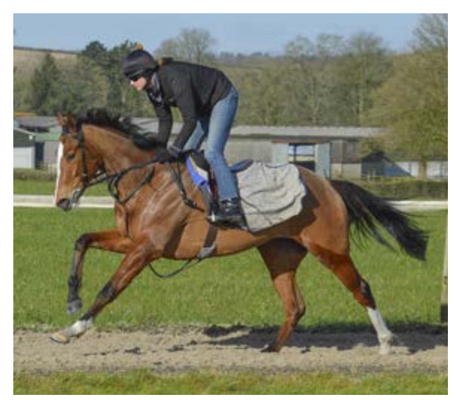
ELBERETH has blossomed further over the winter

Secret Hint is a smart mare on her day and ran several good races in defeat last term. A beautifully-bred daughter of Oasis Dream, the priority this season is to get some black type, which we will seek after she takes up her engagement in the Fillies and Mares' contest on Good Friday.