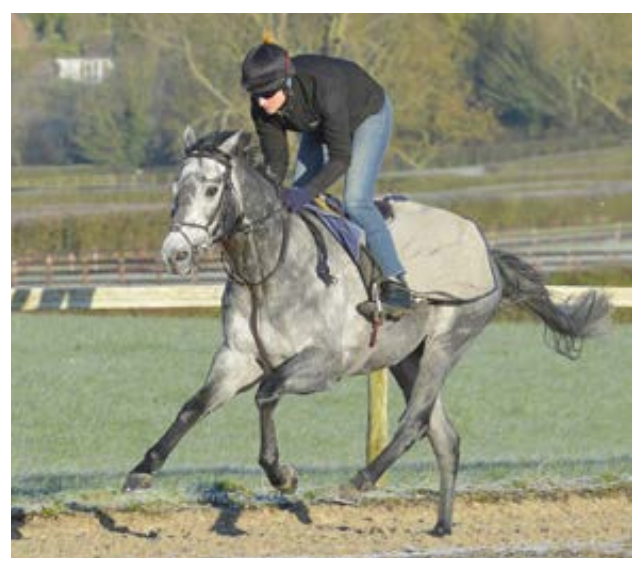
BALLYNANTY heads to the All-Weather Championships

finalised plans for her, but she could possible start off in the Listed Conqueror Stakes at Goodwood or the Group 2 Dahlia Stakes at Newmarket on Guineas weekend, before a crack at the Duke Of Cambridge at Royal Ascot.