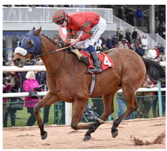
DUNGANNON returns to winning ways at Southwell on New Year's Day

At the age of nine, Dungannon remains an enthusiastic performer at home and a smart sprinter on the racecourse, winning his 11th race at Southwell on New Year's Day. We will keep going with him and he fully deserves to get his head in front again this season.