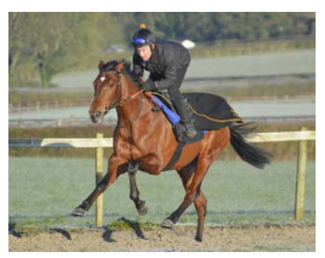
New recruit HAIRDRYER is on a handy-looking mark

Vanishing Point was another that was too weak to make his debut at two, but he has done well and this half-brother to three black-type performers, including Irish