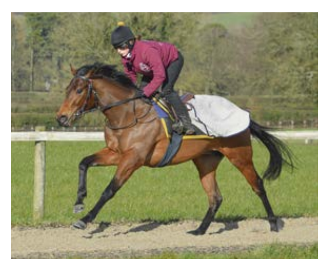
Kennet Valley's SIGNAL HILL has come on leaps and bounds

2,000 Guineas runner-up France, looks a progressive type. Touchdown Banwell is a fine, big sort who has benefitted from gelding and a patient approach. He will be ready to go at the beginning of the turf season though he may start off on the All-Weather before switching to the grass.