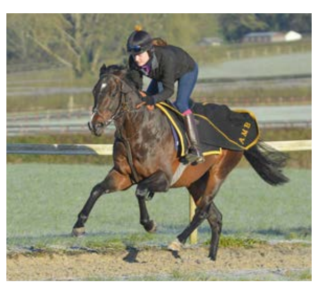
KINGSTON KURRAJONG looks stronger than ever

Make Fast may not be very big but she has a wonderful attitude both in her work and on the racecourse. She followed a debut win at Ffos Las last September with a close second in the Listed Radley Stakes at Newbury the following month. Unseasonably fast ground prevented her from justifying favouritism in Listed company in Italy on her final outing, but she is capable of making her mark at that level this term.