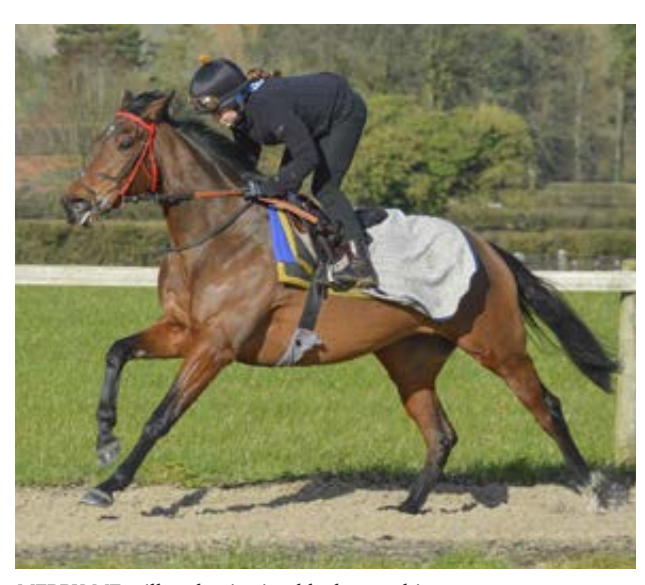
MERRY ME will seek winning black type this term

Scotland was one of several of our leading performers to suffer a setback last summer. This was hugely frustrating as he had run a fine race to finish sixth from a poor draw in the Gold Cup, staying on strongly in the closing stages to suggest he has the makings of a real Cup contender this year. Thankfully, he is back on the go at home and we