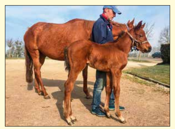
Park House star BLOND ME has had a strapping colt by Dubawi

Front cover: Talented homebred BROROCCO, who sadly died in January this year, at Newbury in 2017