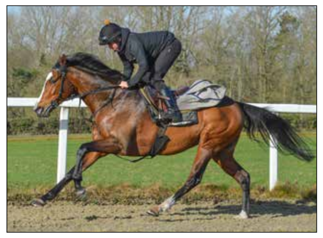
NATURAL HISTORY's form has worked out very well

the highly progressive Mekong too good at Haydock in September. The form of that last run is very strong, and Natural History looks an exciting horse for 2019.