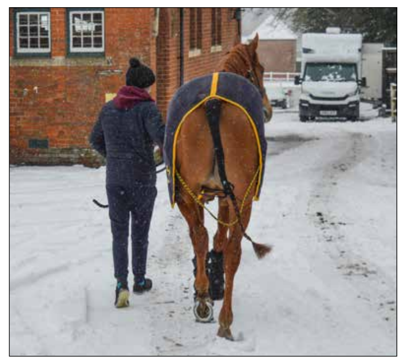
No business like snow business - ISOMER leaving for the races in February

Having enjoyed a record breaking season in 2018 it is very much our intention to better these results yet again in 2019. We are blessed with a strong team of older horses for the coming year and the most exciting group of three year olds assembled at Park House for many years. Obviously hopes are high for a season to remember. One thing is for certain – it will take a record number of points to win this year's Twelve-To-Follow competition and I for one am struggling like mad to reduce my list to anywhere near twelve horses! ■