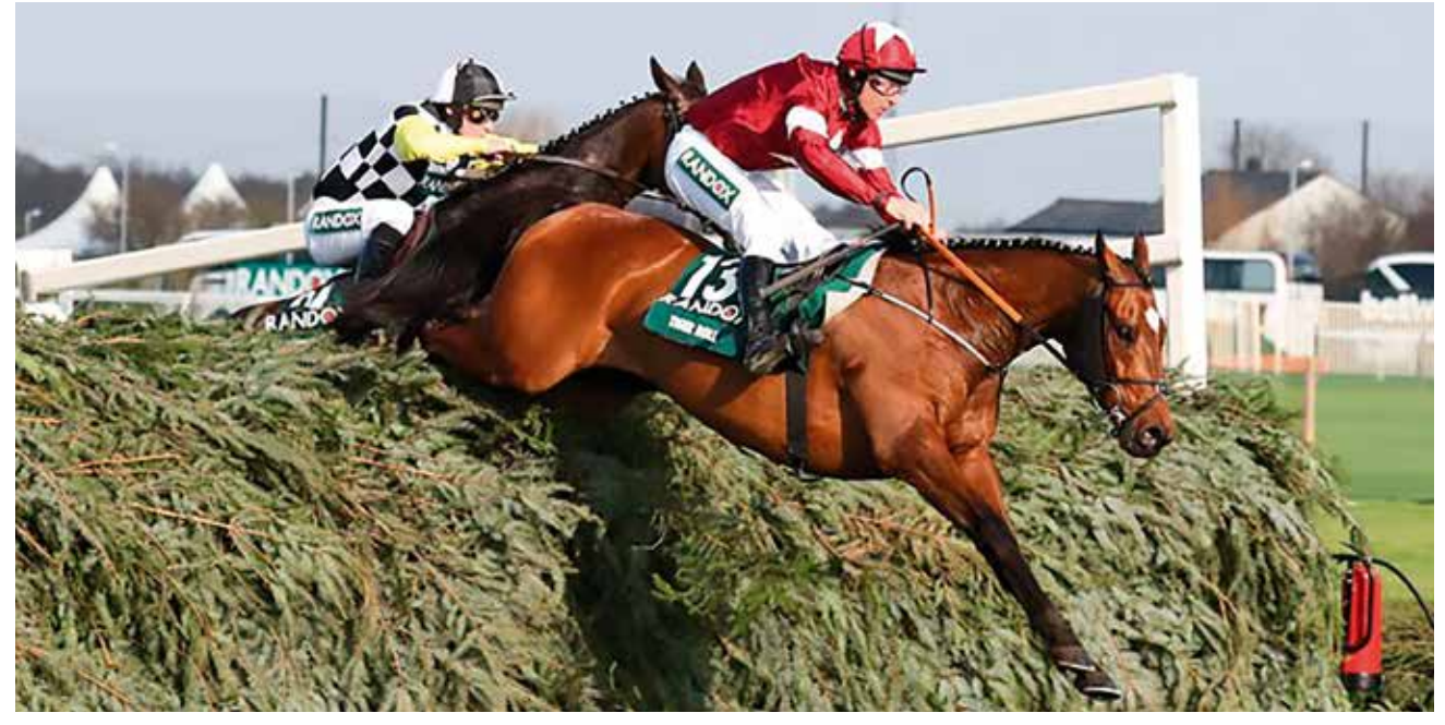
TIGER ROLL winning at Aintree last year

The British government has said as far as it is concerned in the event of no deal the movement of horses from Ireland into the UK will remain broadly the same. But for it to work effectively it needs