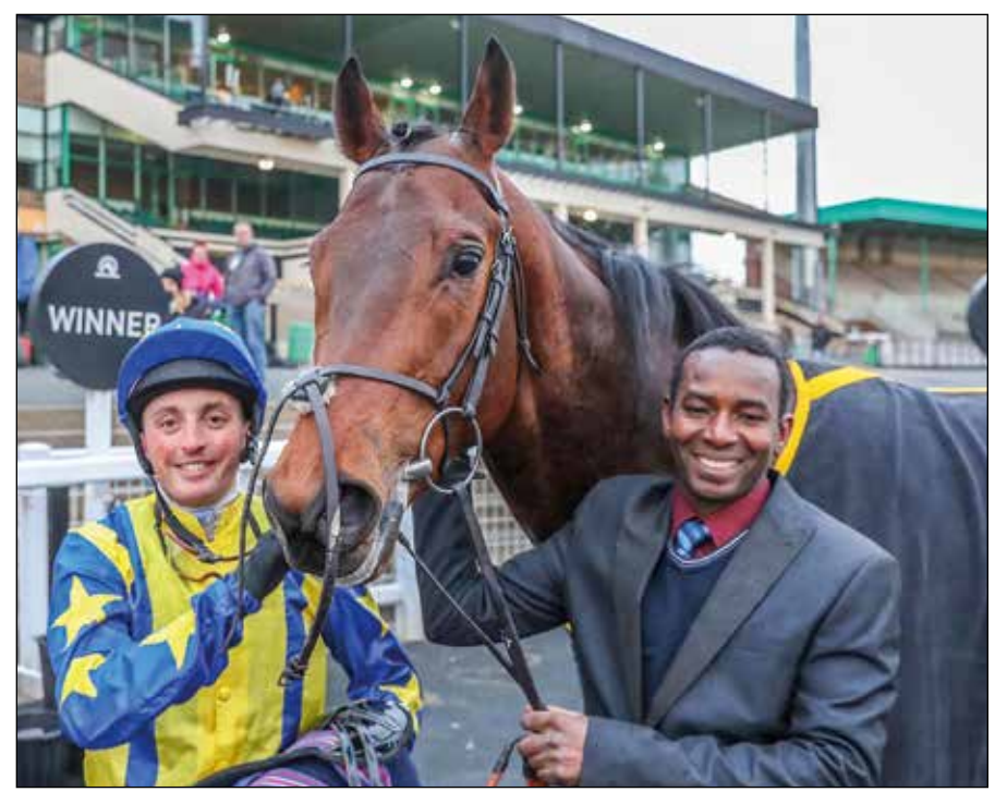
SEEUSOON after winning at Newcastle under Duran Fentiman

Hello Bangkok also showed great promise on debut when beaten a neck at Newmarket in August (the winner since placed in the Fillies' Mile and now rated 100) but she