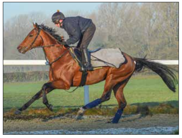
FOX TAL is an exciting prospect for 2019

progress over the winter. Blessed with enormous scope, he seems to skip up the Lochsong in about three strides and we are very excited to see what he can achieve this year. He will go for one of the Derby trials with the Listed Feilden Stakes at Newmarket's Craven meeting perhaps his most likely option.