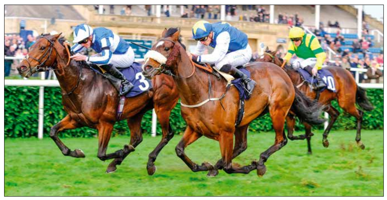
DONJUAN TRIUMPHANT winning the Listed Wentworth Stakes at Doncaster in November

Now nine, Here Comes When is the second oldest horse in training but firmly believes himself to be one of the youngest, attacking the gallops with great gusto every morning. He has nothing to prove but continues to love his work and remains capable of competing at the top level. We will go where the ground is right for him but the Group 2 Bet365 Mile at Sandown could be his early season target.