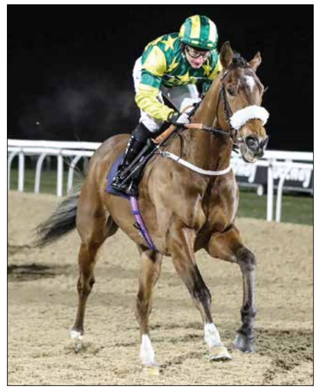
HAVANA ROCKET built on his good juvenile form to score at Newcastle

another nice three year old in Le Don De Vie , who made a very encouraging debut at Newmarket before running well in a typically competitive renewal of the Peter Willett maiden at Goodwood despite being keen. He was again keen at Chelmsford on his third start but by this stage his behaviour in the stable had already cemented his position at the top of the gelding list. He is a much happier individual now and should get off the mark easily this Spring.