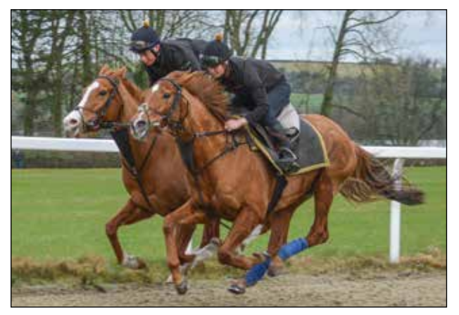
Early Spring work for CLEONTE (nearside) and SHAILENE

Cleonte had struggled to find his form during his first year with us but benefitted considerably from a gelding