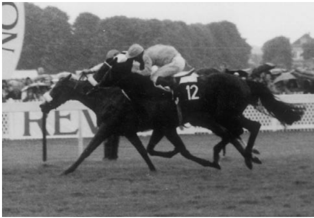
Prix de Diane