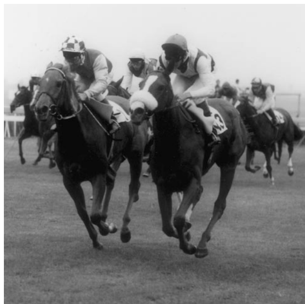
Winning the Cheveley Park