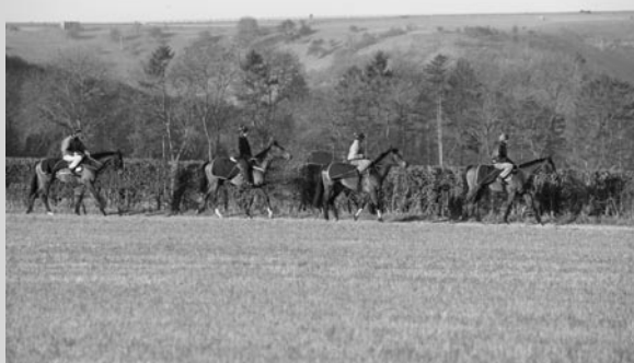
Front cover: Chilling out Back cover: Warming up