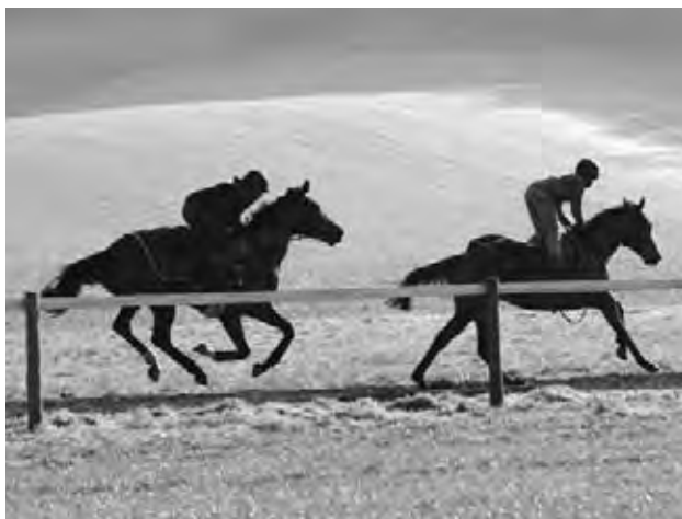
MY AUNT FANNY

may well prove to be a blessing that an injury excluded her from taking up her place in the Cornwallis Stakes in October. If she wins a valuable handicap this year, she would not have done so had she run that day!