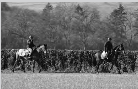
Above: BID ART and TOP LOCK return after work