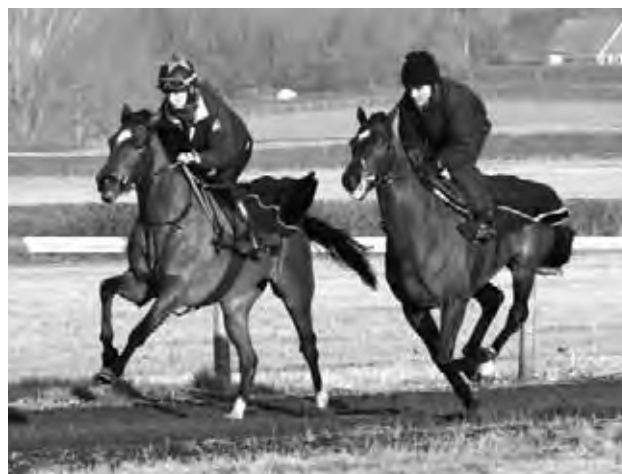
HUTTON FLIGHT (right)