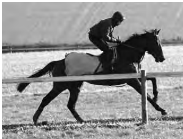
PINCH OF SALT

Vanderlin needs little introduction for regular readers of the Kingsclere Quarter, as he has been omnipresent since its inception in 1999! In spite of his advancing years, he still managed to win a heritage handicap at the age of eight and