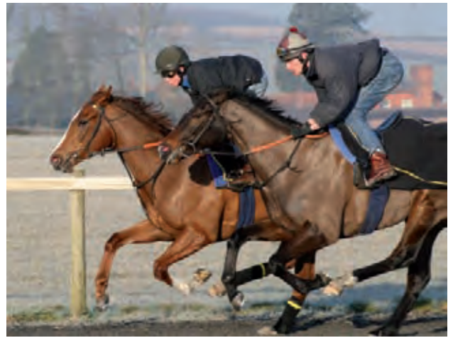
VENI BIDI VICI and BUZBRY RINGS