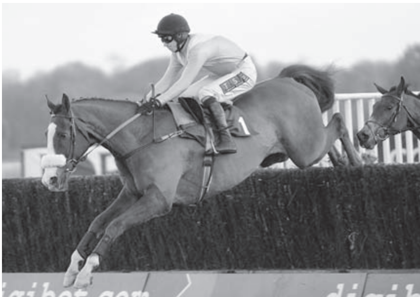
BRIAREUS winning at Kempton in 2008

Kingwell Hurdle at Wincanton and the sixth was in the Champion Hurdle!