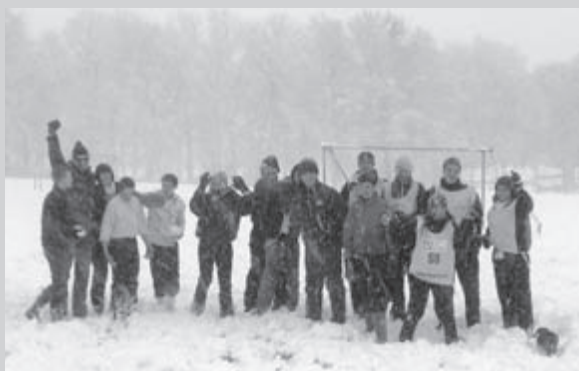
The winning team from The Park House snowball fight

Front cover: DREAM EATER off to Exercise Back cover: 'Walking home' Spring 2010