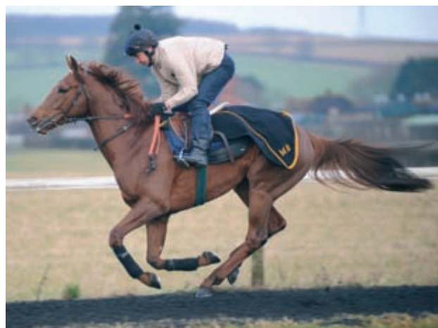
CHINK OF LIGHT