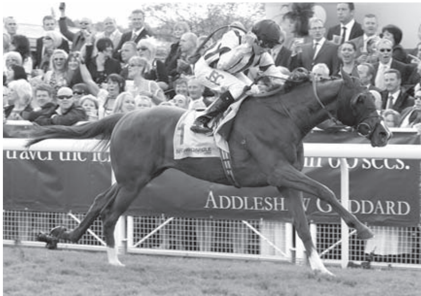
BUCCELLATI winning the Ormonde stakes at Chester, 2009