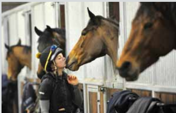
Becky Long enjoys a quiet moment with VIVACIOUS WAY

Front cover: Storm Rash and GRAND PIANO Back cover: TARTEN TRIP and BIG NOTE heading to the Gallops