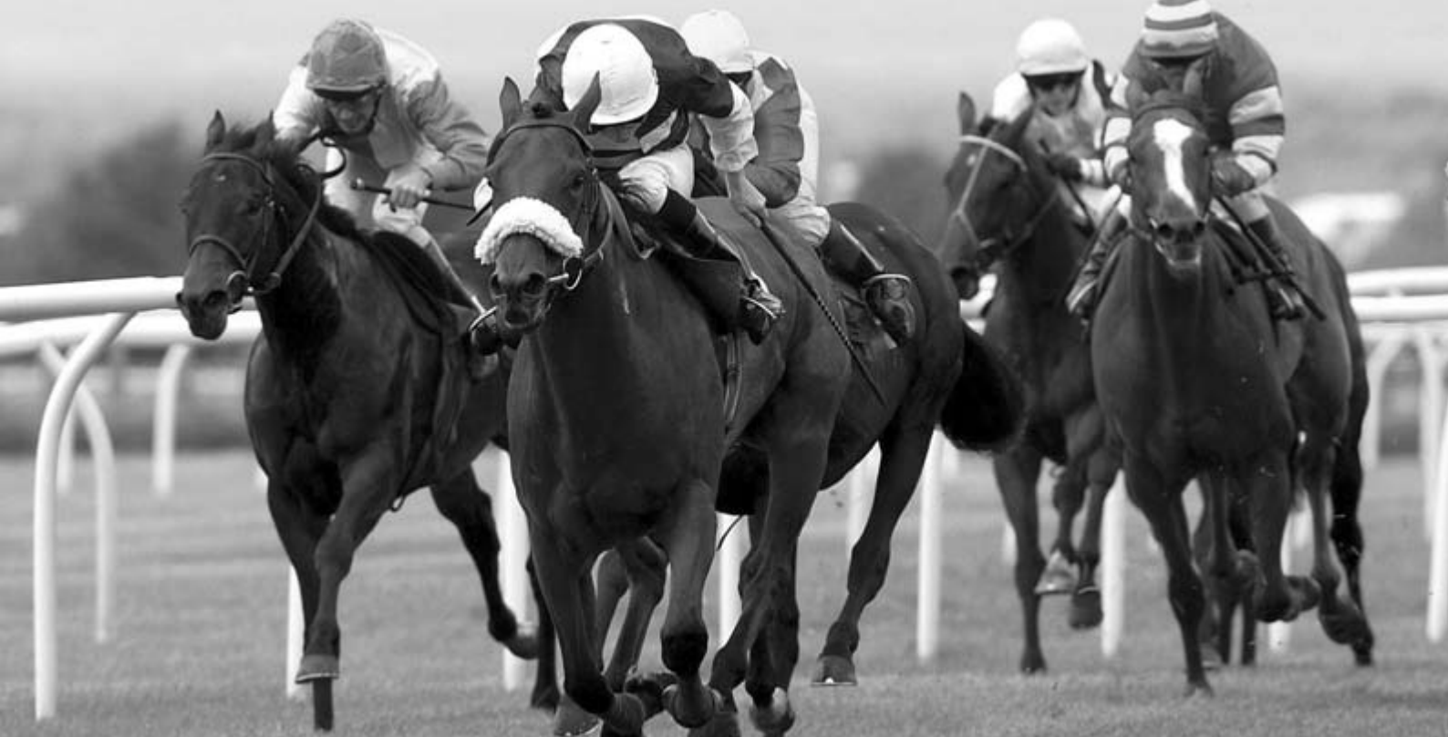
TRAVELLING BAND winning the Carlisle Bell