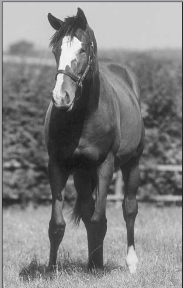
BARATHEA - SPURNED