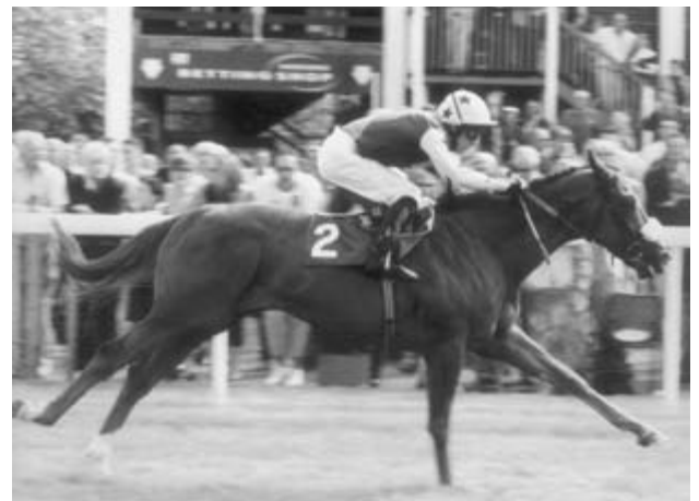
GOLDEN CHALICE's second win at Salisbury

VANDERLIN was lightly raced as a two year old owing to injury, but he has more than made up for that in a busy three year old campaign. He started off the year finishing second in a Haydock maiden before winning a similar race at Pontefract with the minimum of fuss. A quick reappearance