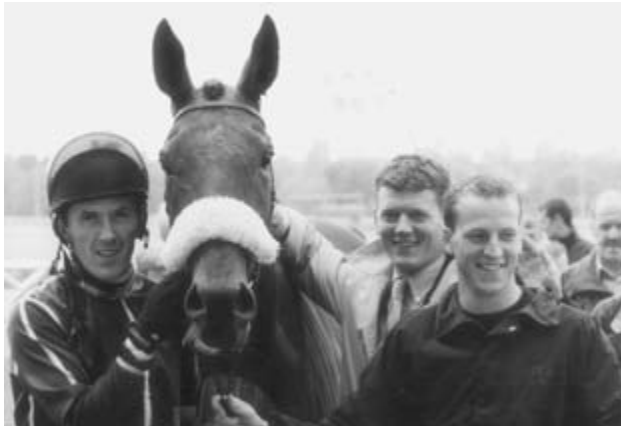
LOGICIAN at Wolverhampton

The record-breaking Tony McCoy was in double form for the yard in July. Although riding winners is nothing new to the champ, the slightly unusual angle of this achievement was that one happened to be a steeplechase at Wolverhampton and the other a flat race at Brighton.