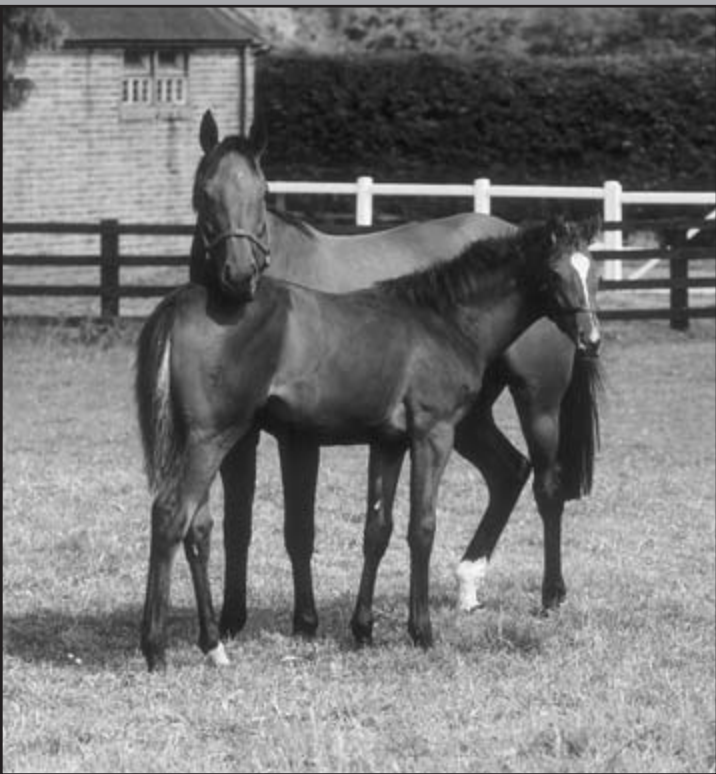
SANKATY LIGHT and daughter