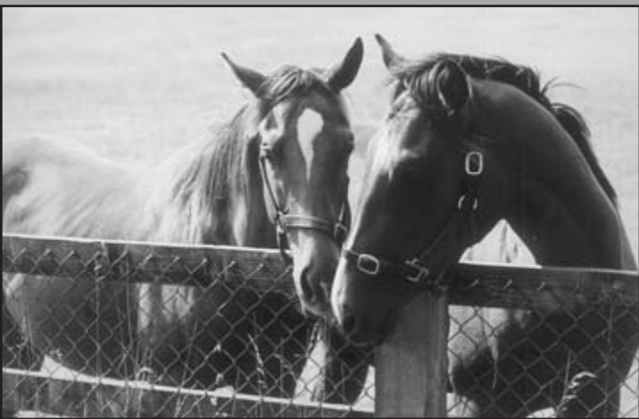
Yearling colts MAGIC RING and KIRKWALL