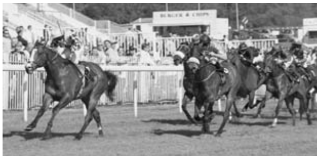
SEIGNOSSE wins at Epsom