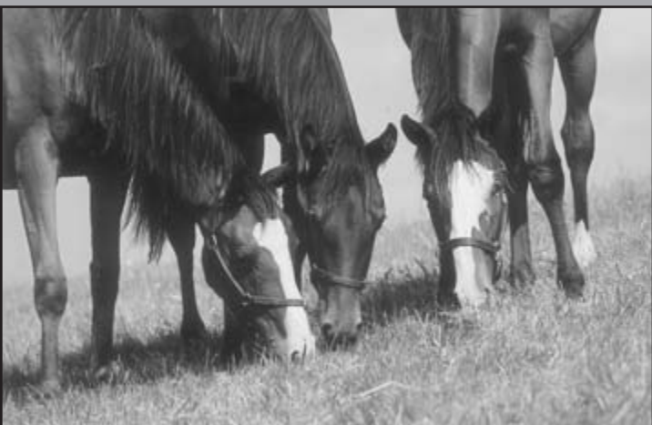
Yearling fillies CROCO ROUGE, FOXHOUND, BARATHEA