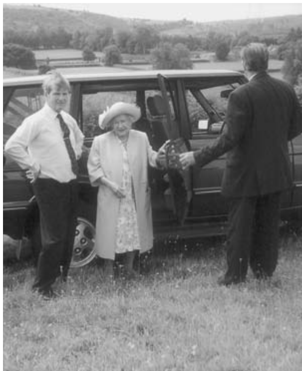
Her Majesty's last visit to Kingsclere

H er Majesty Queen Elizabeth the Queen Mother's most successful horse at Kingsclere was probably her first – INSULAR. Bred by the Queen and a multiple winner for her on the flat he won his first race over hurdles and went on to win the Imperial Cup at Sandown as a novice. He was the middle leg of a memorable treble that day for Her Majesty. INSULAR later showed his versatility by winning his first and only steeplechase at Exeter – sadly in the process sustaining a horrid injury which curtailed his career. Two other home-