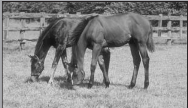
SINNDAR and ROBELLINO fillies