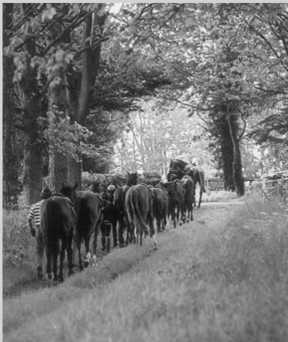
Prince of Wales's Avenue