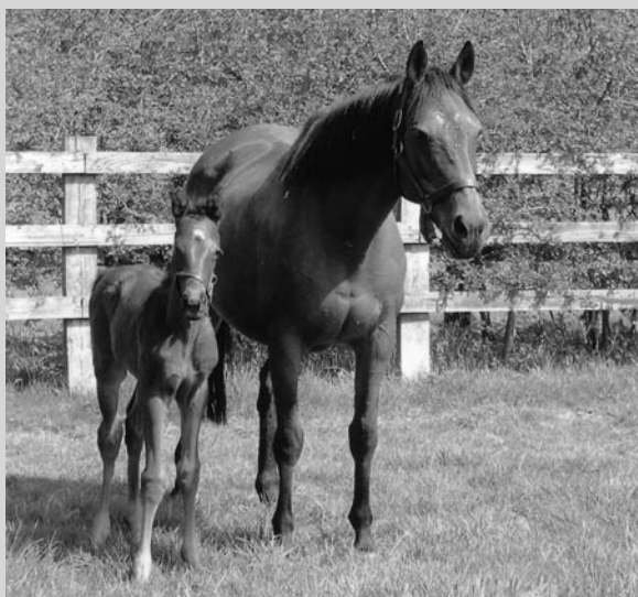
Front cover: PASSING GLANCE at Epsom Back cover: CAPE GREKO at Ascot