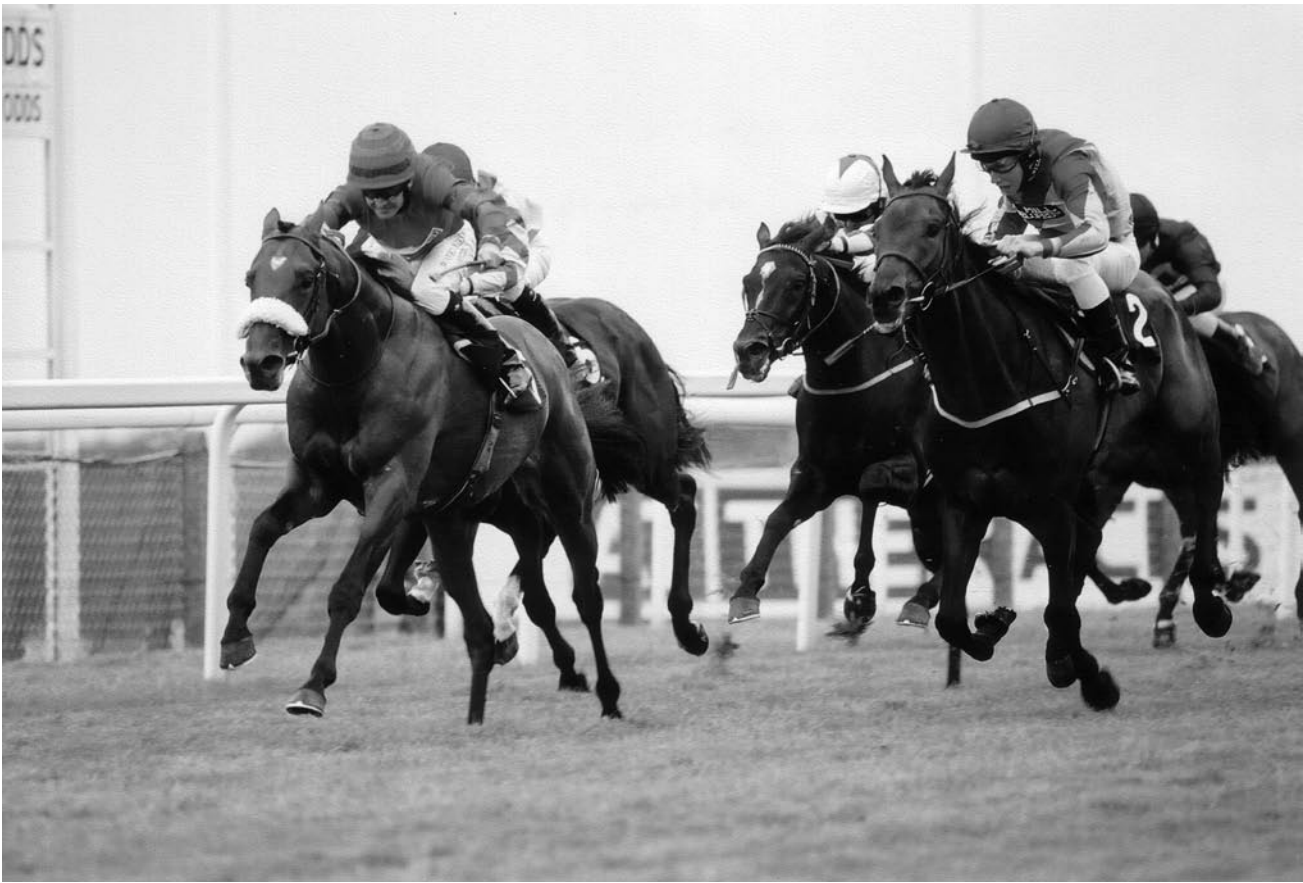
PRINCE OF THEBES winning at Ascot

at Newbury this year, we feared he would never live up to his illustrious pedigree. The application of a pair of blinkers, however, has seen him rise thirty seven pounds in the official handicap the highlights of which were a facile win in the Bibury Cup at Salisbury and an excellent third in a listed event at Haydock. The intention is that he will run next in the St Leger at Doncaster and although he still has a length or two to find on form he has every chance of being able to snatch a place.