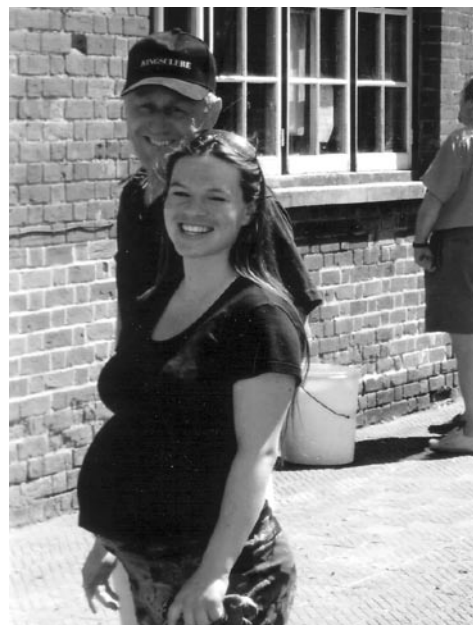
'Trooper' in waiting