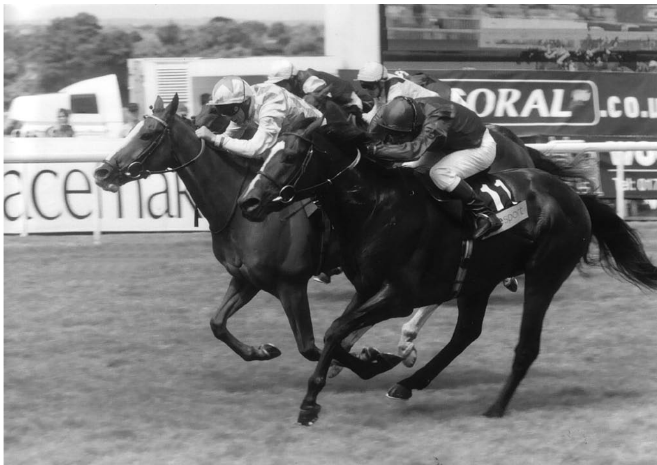
PENTECOST – L. Dettori at Sandown on Eclipse Day

any odds on favourite should and even if the Racing Post describes it as "one of the worst races ever run in this country" - it didn't matter.