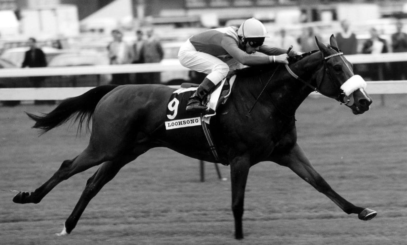
LOCHSONG 1994 Prix de L'Abbaye

she should return to Kingsclere as a six year old and try and win them all again.