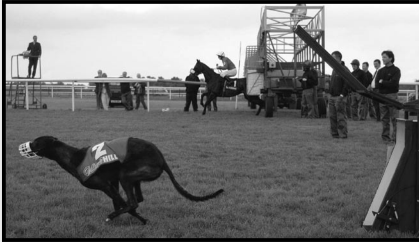
HOUND v HORSE