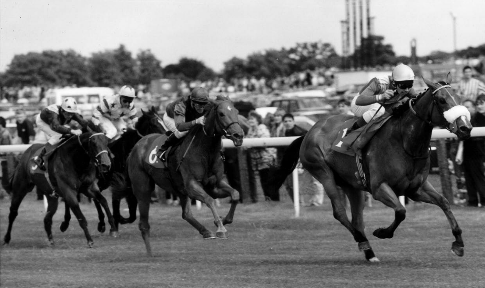
LOCHSONG 1994 Temple Stakes

able just to hold on and win a 7 furlong apprentice race by the minimum margin.