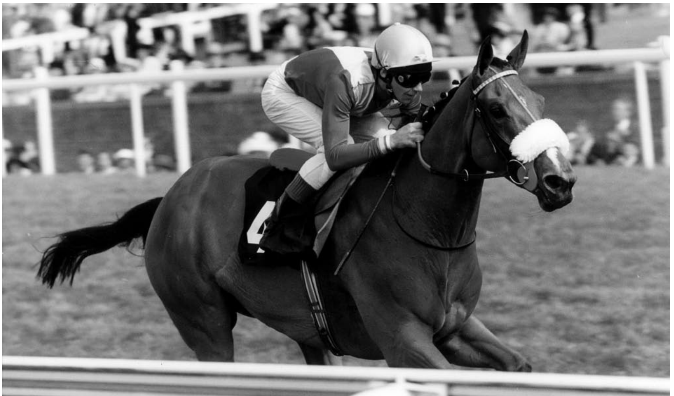
LOCHSONG 1994 Royal Ascot, Kings Stand Stakes.