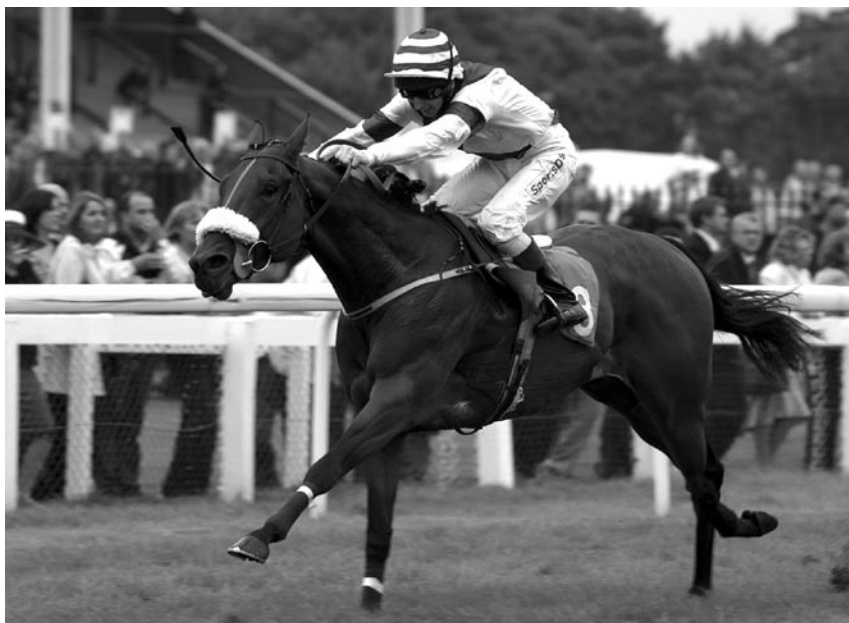
DUBAIAN GIFT at Windsor

In what had been a topsy turvy season the three most disappointing aspects have been under-performance of stable star Phoenix Reach, the injury to Victory Moon before he had even run for Kingsclere and most distressing of all the loss of the wonderful Dubaian Gift, who suffered a ruptured aorta after the Kings Stand Stakes at Ascot. He had been a wonderful servant and one of the great rags to riches stories before his cruel demise. He is sorely missed by us all. He ran 26 times winning 7, second 3 and third once.