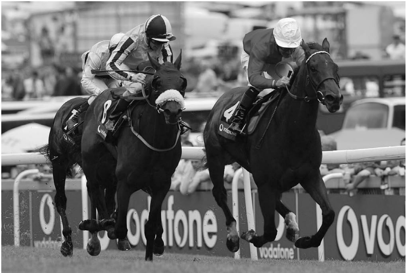
DESERT QUEST just beaten at Epsom

at Doncaster she is well on track to build on what she achieved last season.