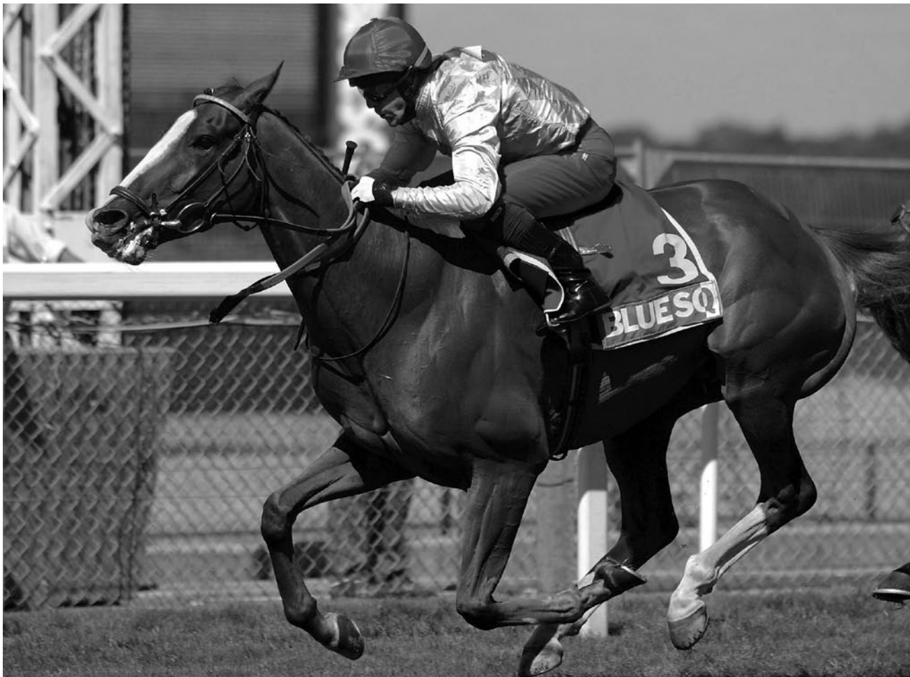
PENTECOST on Shergar Cup Day

We will keep our website www.kingsclere.com up to date with horses that are for sale and hopefully some pictures of them although there is no substitute for seeing them in the flesh.