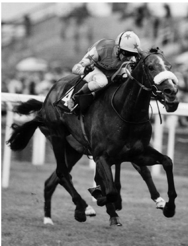
CAPE GREKO winning at Ascot

suffered from a similar injury. However, in his case, it could well prove to be a blessing in disguise as he has so much physical improvement in him and should make in to a high class three year old.