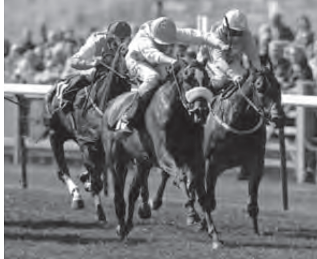
OCEANA BLUE the third leg of the treble

bringing him back for an Autumn campaign, however he fully deserves to continue to take his chance at the highest level.