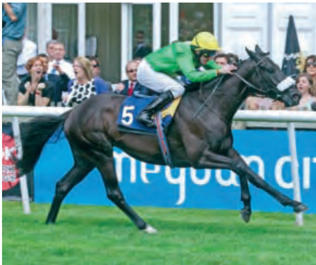
BRIEF ENCOUNTER at the July meeting at Newmarket

Little Pete came within a nose of winning at last year's Glorious Goodwood festival, and the good level of form he has shown in competitive sprints this season gives hope that he can land a decent prize in the coming months.