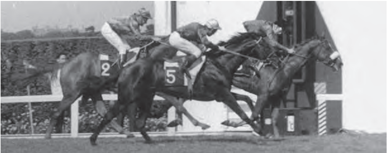
H.M. The Queen's EXAMPLE ridden by L. Piggott in France

In writing an article elsewhere on the use of the whip I was prompted into more thought on this subject which always causes a great deal of debate in the Racing Press. No one can argue that style has changed considerably over the past forty years. At the same time there has been much alteration in the rules and in the public's sensitivity concerning it. Gone, thank goodness, are the days when tired horses were flogged every stride up the hill at the Cheltenham Festival which was not only unsightly but also totally unacceptable.