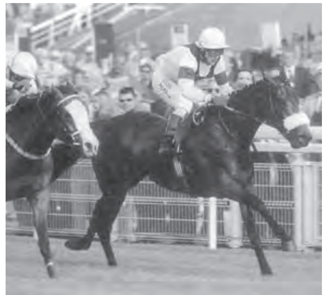
FIREBREAK winning his first start at Goodwood in May 2001