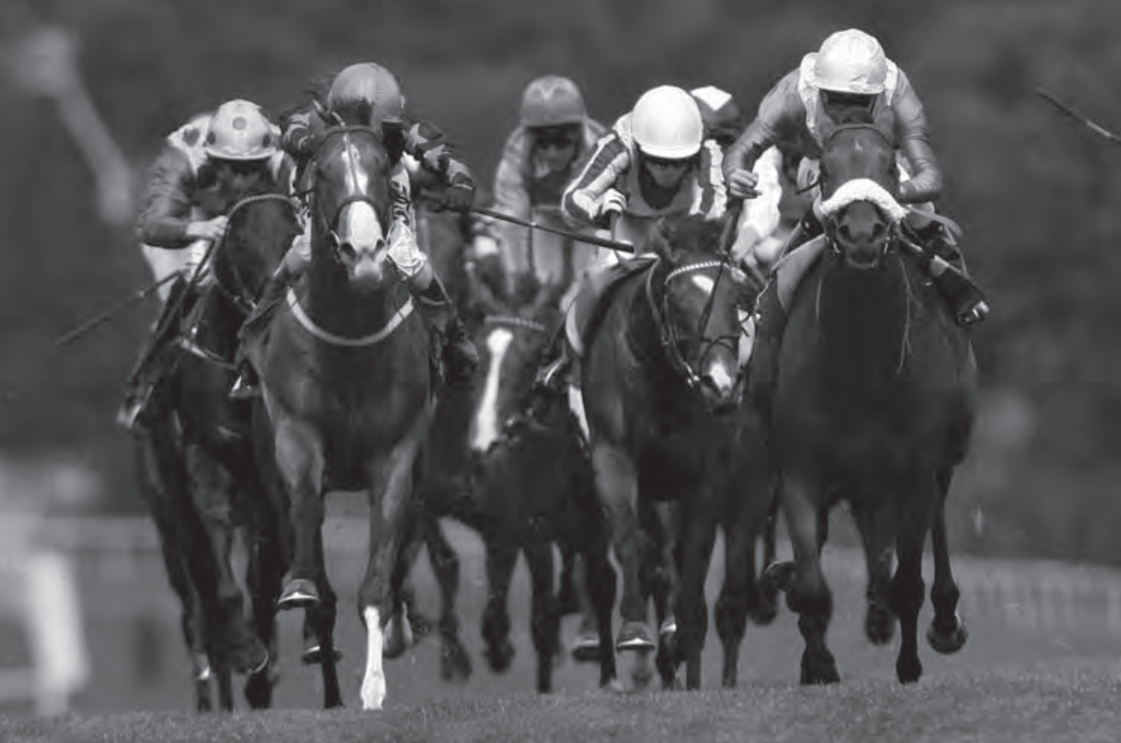
DREAMSPEED winning his maiden at Sandown

His future lies in nurseries and he should start off a fair mark.