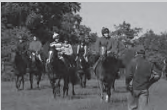
Debrief after work on the downs

Front cover: BUCCELLATI winning the Group 3 Ormonde Stakes at Chester