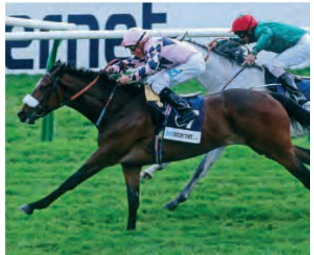
CHIBERTA KING wins the first leg of the Newmarket treble