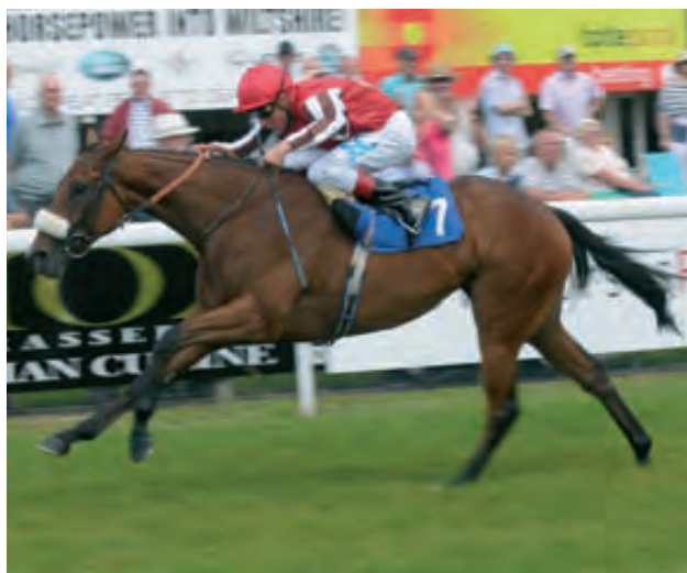
SWAN WINGS at Salisbury

We have also had plenty of horses running well without winning so far this season. Foundation Room was unlucky on her first start this year at Chester, and after a fair run in the valuable Silver Bowl she again ran with credit