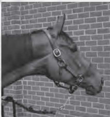
ISABELONABICYCLE, top scorer at half-way