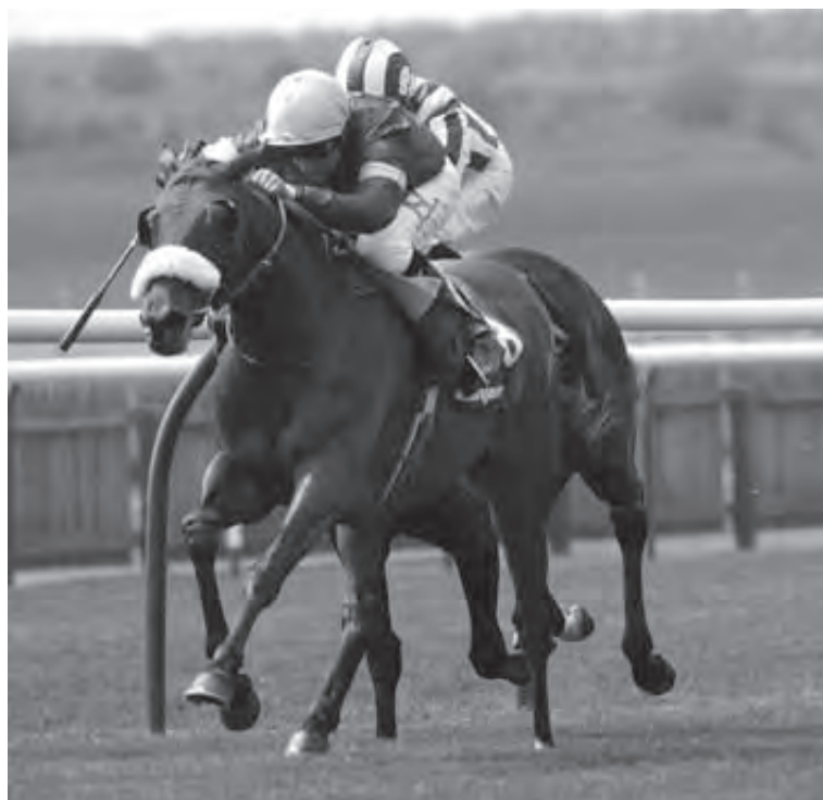
HATTON FLIGHT wins the Stan James Heritage handicap at the Newmarket Guineas meeting

The older horses have also done their bit and Buccellati has progressed with every year. His third in the Group 3 Gordon Richards Stakes on his reappearance in April suggested there would be more to come and he went on to win the Group 3 Ormonde Stakes at Chester on his next start. It was quite possibly the slowest-run Group race in racing history, with the field hardly trotting for the first three-quarters of a mile. William Buick, who is enjoying a terrific season, rightly earned plenty of plaudits for taking up the running before quickening from the front as they approached the straight. It is worth remembering his two rivals were former Group 1 winners and in his next start Buccellati was travelling very well before being badly hampered in the Group 1 Coronation Cup on Derby Day. He was lame after that race, and so has been given a break with a view to