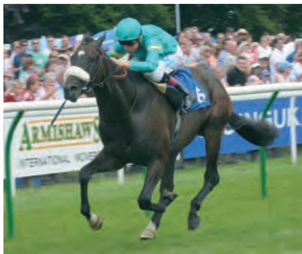
LORD ZENITH impressive over seven furlongs at Salisbury

We introduced two smart prospects at Salisbury in June with Swan Wings successful over five furlongs and Lord Zenith over seven. Both went to the Newmarket July Festival, with Lord Zenith finishing fifth despite being