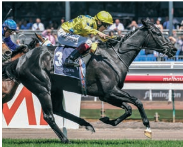
SIDE GLANCE continues to run well internationally

He is set to return to the States for another crack at the Arlington Million, a race in which he finished third last