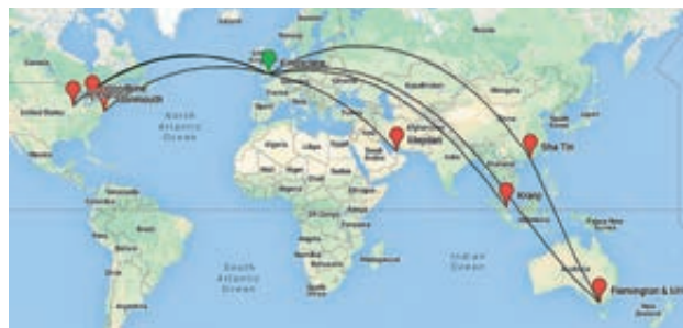
Air Miles a plenty with Side Glance's travels charted