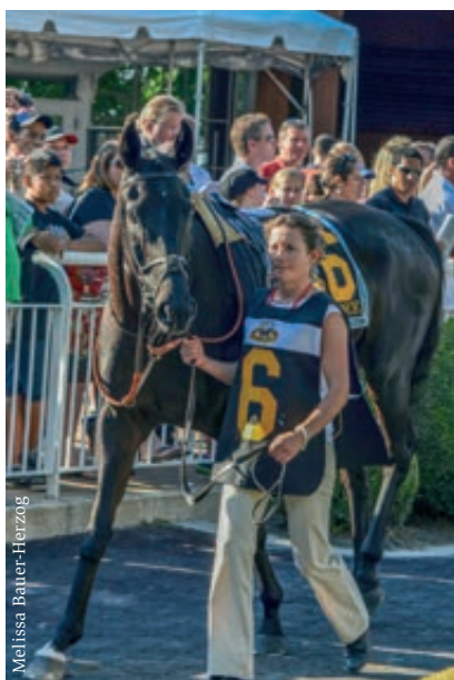
Arlington – Chicago USA

his way to Singapore for the Singapore Airlines International Cup. Held up in last position until the final 2 furlongs, he couldn’t quite close in on the leaders but stayed on well to finish 5th.