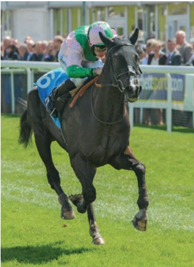
HERE COMES WHEN puts in an impressive seasonal debut at Chester

Purcell started the season in style, winning twice over 7f at Lingfield Park, on the latter occasion benefitting from an easy time of it in front under a well-judged ride from Oisin Murphy. Unfortunately, the subsequent 7lbs rise has proved insurmountable in a couple of strong turf handicaps, but he has been freshened up since and should return with renewed vigour later this term.