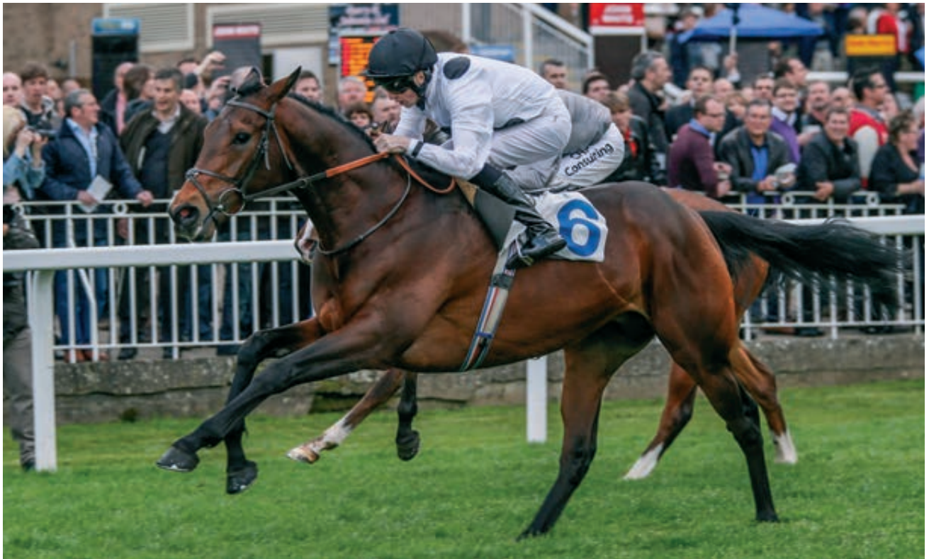
MAN OF HARLECH wins his maiden in good style at Windsor

Hint , a daughter of Oasis Dream who displayed a nice turn of foot to win a Doncaster maiden on her second start, the form of which has since been franked by the 82-rated runner-up winning next time.