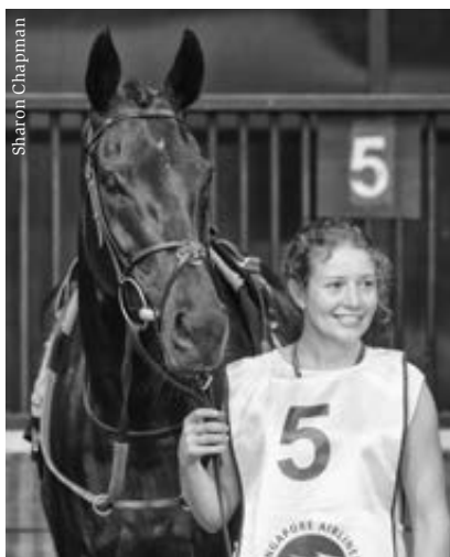
Singapore – high humidity