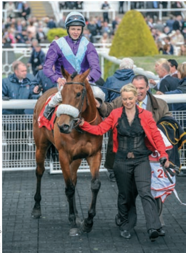
SWAN SONG showed blistering speed to win at the Chester May meeting

Last year's Group 1 Mackinnon Stakes hero and stable