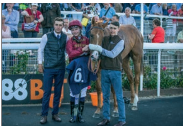
FORTUNE'S PEARL was our first juvenile winner of the season