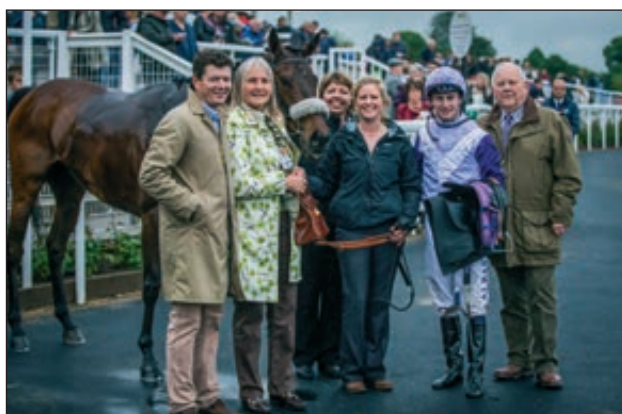
SIR PASS I AM delights his connections at Chepstow

Sir Pass I Am returned this season as a changed horse both physically and mentally, and duly confirmed his latent promise with a victory over two miles at Chepstow. Eased down in the final half furlong, the winning margin is recorded as a neck but could have been ten lengths. This did not escape the attention of the handicapper and