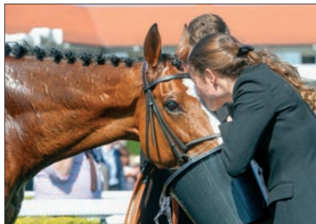
MONTALY enjoys a well-earned drink after victory in the Chester Cup

Shortly before Here Comes When and Blond Me made their reappearances, Montaly had already got the season off to a flier with victory in the prestigious Chester Cup.