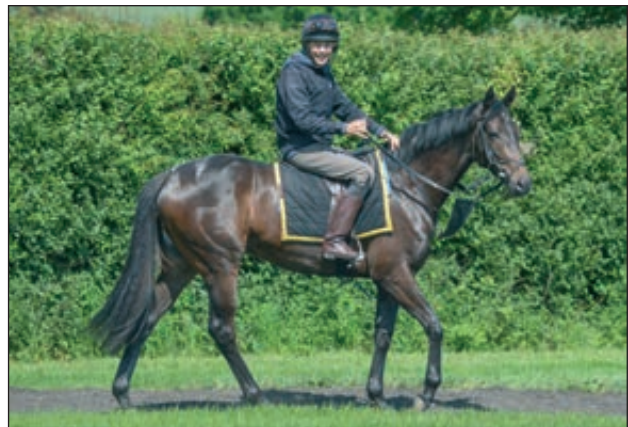
CROSSING THE LINE has heaps of class and won on debut at Newmarket