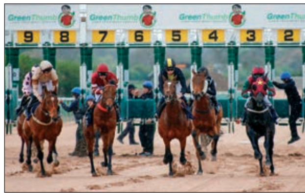
LOOK MY WAY on his way to victory at Southwell on Easter Sunday

Kennet Valley's Contango was unraced last year but has grown into his tall frame and been a revelation this year, winning his first three starts with ease, including a Class 3 at Newmarket over ten furlongs. Wonderfully straightforward, he ran well to be second in the Shergar Cup and is an exciting young horse. Look My Way is another who was