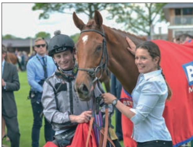
BLOND ME has been a superstar mare for her connections

Blond Me made an excellent start to her campaign when she won the Group 2 Middleton Stakes at York on the same day as Here Comes When's Hambleton triumph. Unlike him, she has long been thought to prefer a firmer surface, but her win over some smart fillies (not least