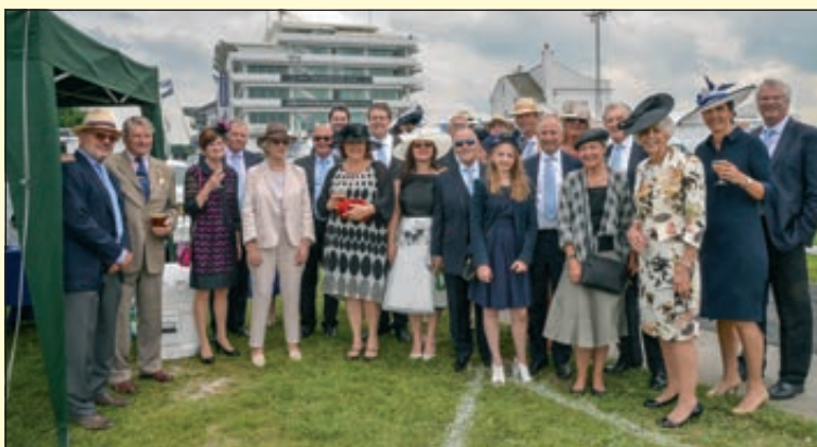
Derby day picnic