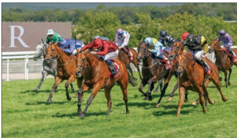
SCORCHING HEAT was the yard's third winner at this year's Goodwood Festival

Qatar Racing's Count Octave came closest to providing us with a Royal Ascot winner this year, following up his maiden win at Wolverhampton and encouraging fifth in the Chester Vase with an excellent second in the Queen's