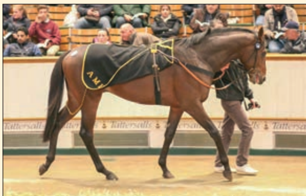
REAL DOMINION selling at Tattersalls Horses-in-Training Sale last year

This is always a sale that deserves close inspection as many top-class jumpers have passed through here, including one of the all-time greats, Red Rum .