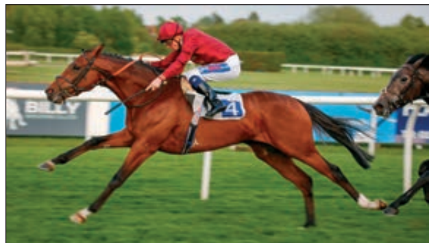
The likeable NAVAL WARFARE has won at Leicester and Newmarket this term