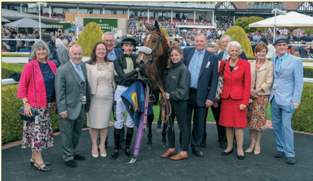
A happy team with ST MARY'S at Chester

The KRC enjoyed a tremendously successful start to the turf season, with Brorocco's impressive win in the prestigious City and Suburban Handicap at Epsom a real highlight. Though he was unable to justify favouritism back there on Oaks day, members enjoyed a wonderful picnic at the course and a memorable day's racing.