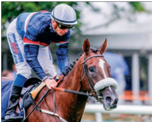
Kennet Valley's CONTANGO won his first three starts

South Seas and Isomer were also black-type two year olds but they are yet to flourish this year. The all-weather surface may have been too quick for South Seas on his debut at Newcastle but there were no such excuses in the French 2,000 Guineas, where the ground was soft. He has been gelded and hopefully this will help him re-find his excellent form from last year. Isomer's juvenile form is also impressive, having run Churchill and Cunco close on separate occasions. He returned from his winter break a much more physically imposing colt but he is difficult to keep sound and has been limited to one start so far this season, in the Listed Gala Stakes at Sandown, where he definitely needed the run. He should come on for that and we will look to capitalise on the current wet weather as he is at his best with a bit of give underfoot. Max Zorin has also had a few niggles this year but showed significant improvement from two to three when third in the Dee