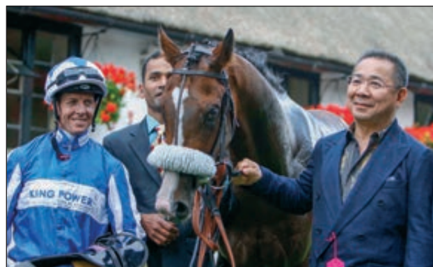
BEAT THE BANK is now a Group 3 winner and is a tremendously exciting prospect for King Power Racing