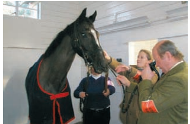
Post race scoping

examination after racing. This is best performed in the window of opportunity between 20-40