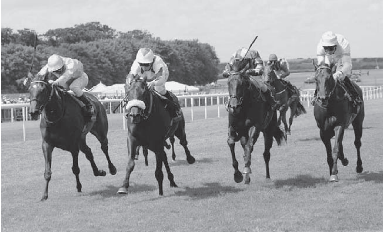
DONEGAL winning the Listed Bahrain Trophy at Newmarket

Two horses that were a little bit harder to justify selling were Top Lock and Kalahari Gold . Neither had raced as two year olds and both had made giant strides this summer to develop into genuine Pattern Race performers and there was evidence enough that further improvement was probable. Top Lock had started the year by winning an all weather maiden at Kempton and whilst he did not win again he was placed at the highest level. Third in the German Derby, second in the Great Voltigeur Stakes and third in the King Edward VII Stakes at Royal Ascot. A strong, handsome son from the first crop of the outstanding Nayef he has potential to be a top class middle distance performer as a four year old. However potential and actually realising it are two different things and a sales price of 410,000 guineas made the decision to sell the right one.