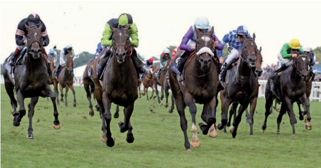
DARK MISSILE wins the Wokingham Handicap at Royal Ascot in 2007