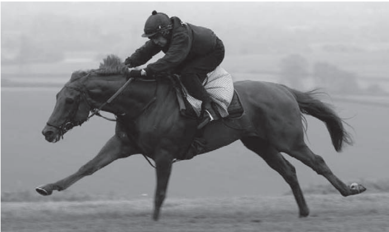
OLLIE GEORGE points his toe at home

throughout his racing career and his battling nature saw him win or be placed on fourteen of his twenty starts. Sadly a tendon injury has prematurely ended his racing career, but he will no doubt enjoy a long and happy retirement on the HEROS retirement and rehabilitation scheme. ■