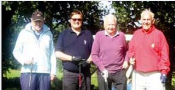
Team Kennet Valley