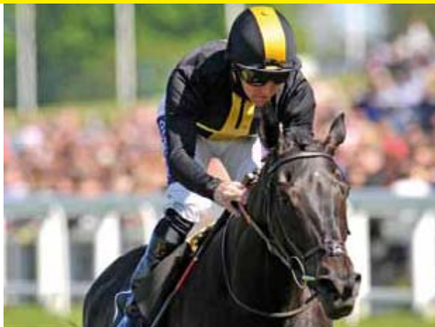
SIDE GLANCE winning at Ascot

The exploits of the other horses are to be found in the review of the season. The two year olds have been slow to appear but three of them have now run with INTRANSIGENT giving a great deal of encouragement for the future. At least three of the others should appear on the all weather before the end of the year and with HIDDEN VALLEY, TARTAN TRIP and RAWAKI among the older horses going on 2012, should keep up the level of entertainment and fun.