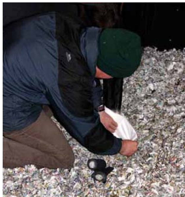
Cuts and bumps – all in a day's work