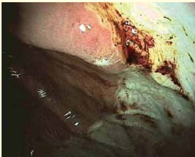
Examples of gastric ulcers

Like human ulcers, stomach acid appears to be the main culprit in the cause of gastric ulcers. However, in human ulcers damage to the mucus lining of the stomach by the bacteria Helicobacter pylori has been identified as a major cause, and is usually treated with antibiotics. This bacteria has not been isolated from equine stomachs and is currently not considered to be the cause of horse ulcers.