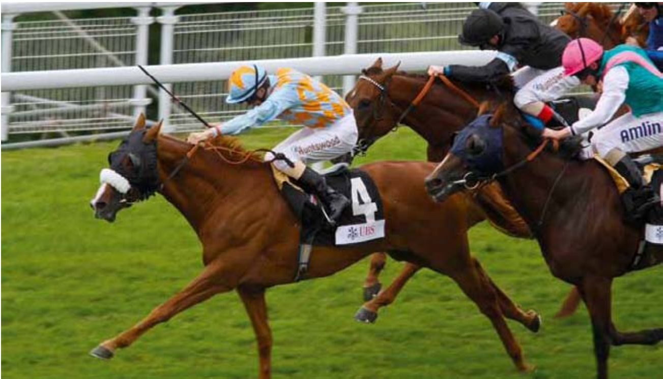
WHIPLASH WILLIE winning at Glorious Goodwood under a fine ride from David Probert

Eclipse Day treble completed by Chiberta King and Highland Knight. Her last two runs were in a very competitive Group 3 and Group 2 and on both occasions she showed enough to suggest she can reach the latter level with another winter on her back.