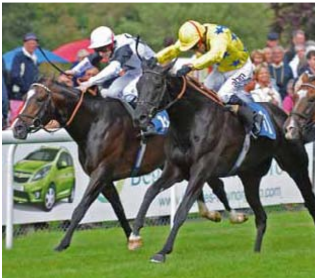
SIDE GLANCE wins the Gr 3 Sovereign Stakes at Salisbury

Opera Gal has had a busy season during which she has finished out of the first four just twice in nine starts. She has a fantastic attitude and after some fine efforts in defeat in handicap and Listed company she gained reward for her