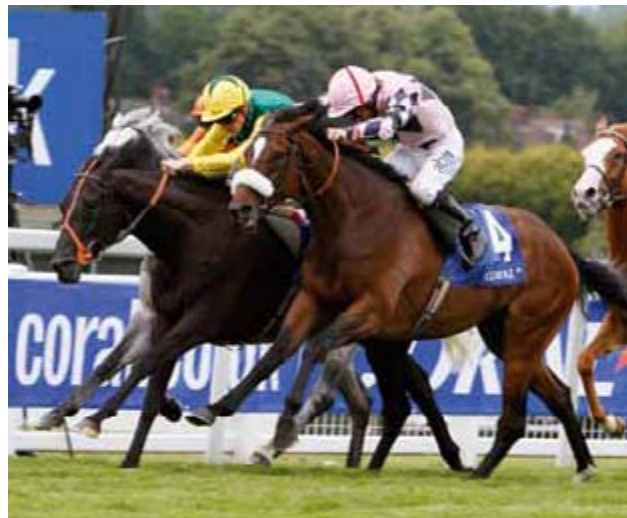
CHIBERTA KING is the last leg of a famous Eclipse Day treble for the yard