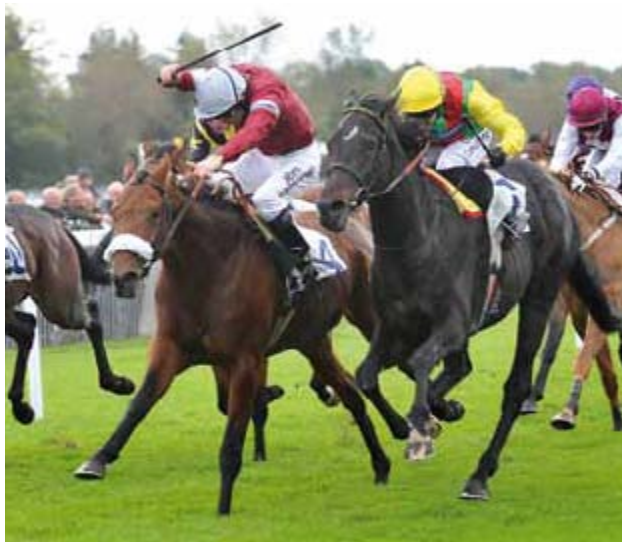
DISCOTECA makes it two from two at Windsor this year

King Ferdinand was in excellent form early in the campaign but has subsequently been sold to continue his career in Ireland. Hidden Valley and Guided Missile look capable of making an impression off their current mark. The former was proving to be something of an enigma before a marked step up in trip to 2m1f worked the oracle on her final start at Bath in October. The latter is a full sister to the very smart sprinter Dark Missile and she gained the second win of her career on just her fourth start with a runaway win over 6f at Chepstow in soft ground in May.