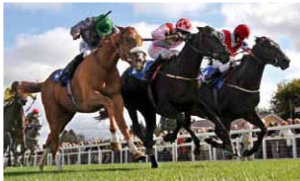
DUTCH MASTER near side just held in a tight finish at Salisbury on the first day of the new whip rules

So the current maximum of seven strikes in a flat race and eight in a jumping race seems to most people to be acceptable. Even an Irish jockey should