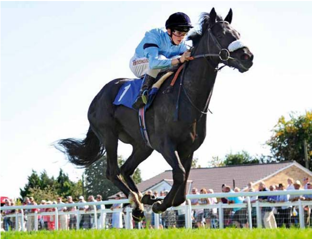
BONFIRE creates an excellent impression at Salisbury preceding an excellent third place in the Group 1 Criterium de Saint Cloud

Sadly Bonfire suffered a wretched run in the straight and found daylight when it was all too late, however he still managed a fast finishing and highly creditable third. From the first crop of Manduro and a half brother to last year's Musidora winner Joviality, we are hoping that he can develop into a possible Derby candidate next summer and at the very least he is a highly promising prospect for 2012.