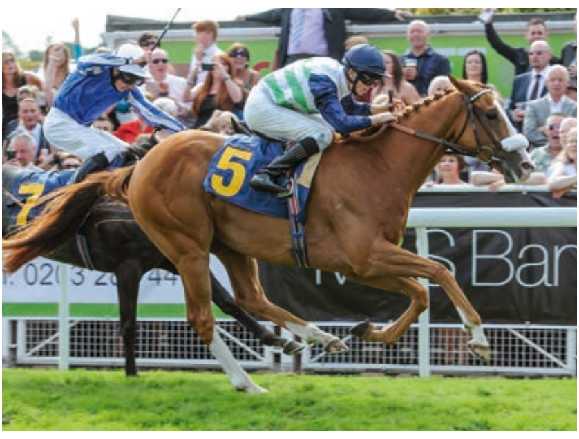
GOLDONI wins at Listed level at Chester

One of the surprise packages of the season has been Benzanno , who hasn't always appeared the most straightforward and was even dropped into a claimer in July following his win in handicap company at Epsom the previous week. However, he showed improved form to reach the frame in two decent handicaps in the autumn prior to running away with a heavy-ground contest at Haydock Park on his final start of the term.