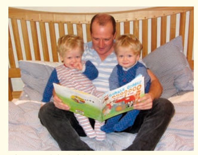
Life is a struggle for the father