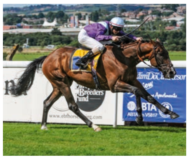
HIGHLAND KNIGHT wins his first listed race at Pontefract

heavy ground at Longchamp can be forgotten and, given his improvement this term, it is entirely reasonable to think that there might be more to come. He too might be Dubai bound in March.