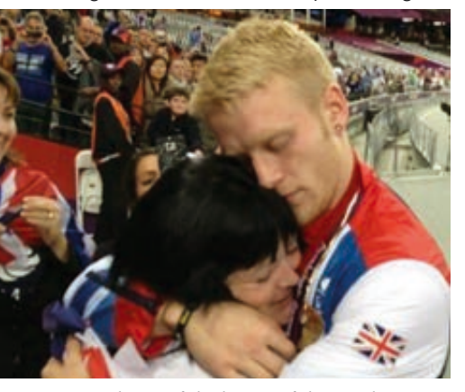
{\it Jonnie Peacock one of the heroes of the Paralympics} \\ {\it with his mother}

As for the rest of the plan, I am working on it but 2013 will not be dull. ■ © Clare Balding 2012