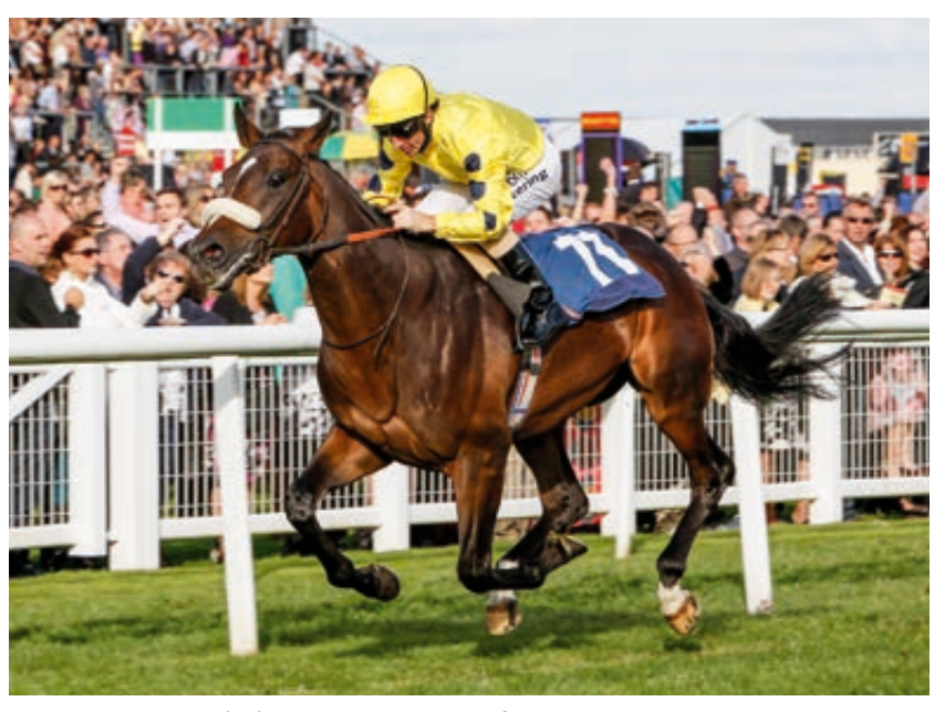
RACE AND STATUS looks an exciting prospect for 2013

Operation Chariot was another to win his maiden at Sandown Park, on his racecourse debut in June. He went on to finish a close 6th in the Group 2 Vintage Stakes at Goodwood and I anticipate he will prove capable of holding his own at stakes level in time.