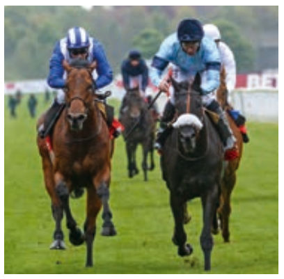
BONFIRE wins the Group 2 Dante Stakes

On a personal level, one of the most satisfying developments over the last two years has been the forming of what must be one of the finest