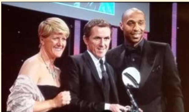
With AP McCoy and Thierry Henry

Having worked for 5 Live for 19 years at Wimbledon, I switched to TV in 2015 and had something of a baptism of fire but by 2016 the format of the highlights programme had settled down and I could relax to enjoy Andy Murray's second Championship win. To sit alongside the likes of John McEnroe, Boris Becker, Martina Navratilova and Tim Henman is an utter privilege.