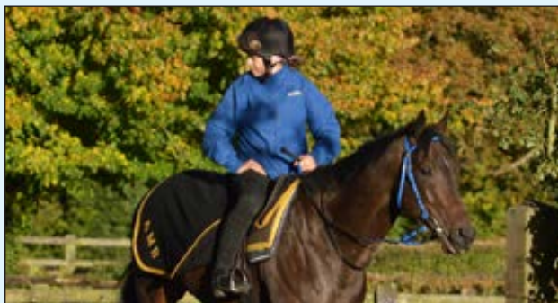
HIGHLAND COLORI ran 12 times this year