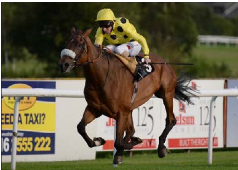
Big and beautiful – BRIEF VISIT wins on handicap debut at Leicester

second on her handicap debut on what was her final outing of the season and, like Brief Visit, is a big scopey filly who should improve further with time.