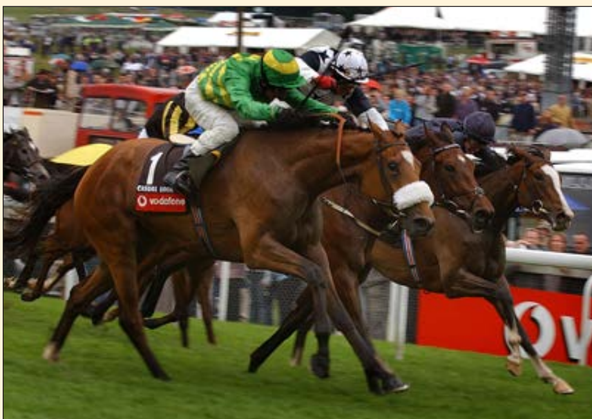
CASUAL LOOK winning the Oaks

I have only ever commentated on two sports – tennis and golf, both for 5 Live, and to be a part of the Ryder Cup commentary team is a great thrill. The combination of walking inside the ropes, whispering as putts are taken and then roaring when they drop, as well as interviewing players and family is quite a test of all round broadcasting and it's a challenge I relish. I was lucky to be on the microphone at the 15th hole as Jamie Donaldson played his second shot to within 2 feet of the pin to seal the win for Europe.