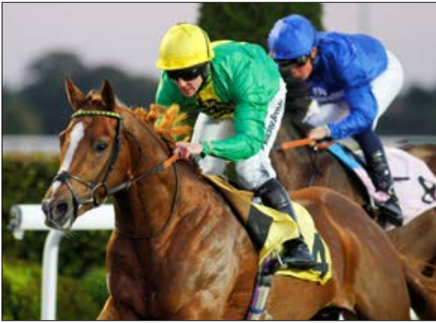
INTIMATE ART shows a great attitude to score at Kempton under Jim Crowley

Jim Crowley. A handy type, he has since been gelded and looks set for a successful time of it at three for his owners Thurloe Thoroughbreds.