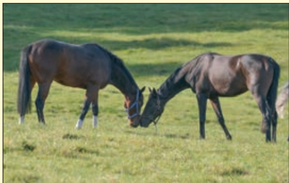
BERKSHIRE BOY and COLD SHOULDER make friends during their holiday