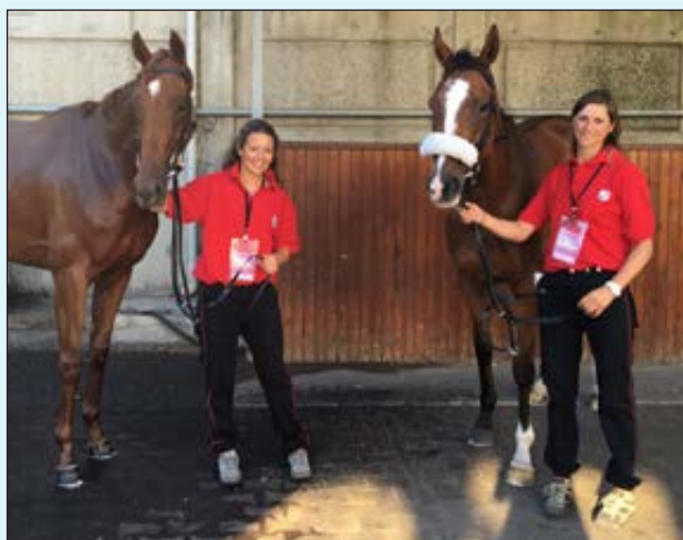
ELBERETH and BLOND ME