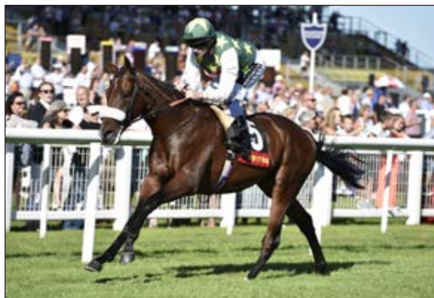
GENETICS puts daylight between himself and his rivals at Newbury