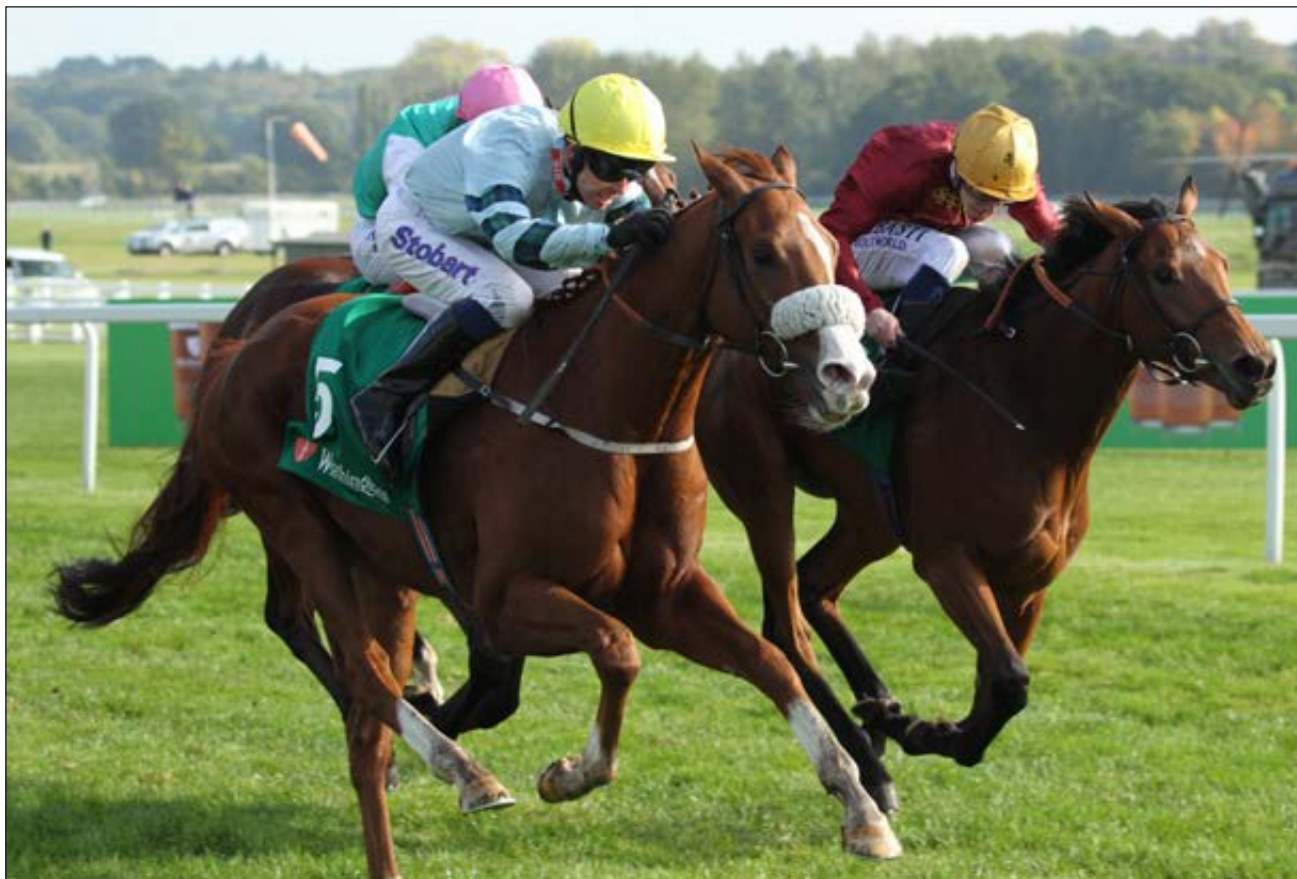
DURETTO records his first Group win, in the St Simon Stakes at Newbury