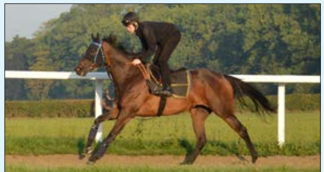
INTRANSIGENT also had a busy season