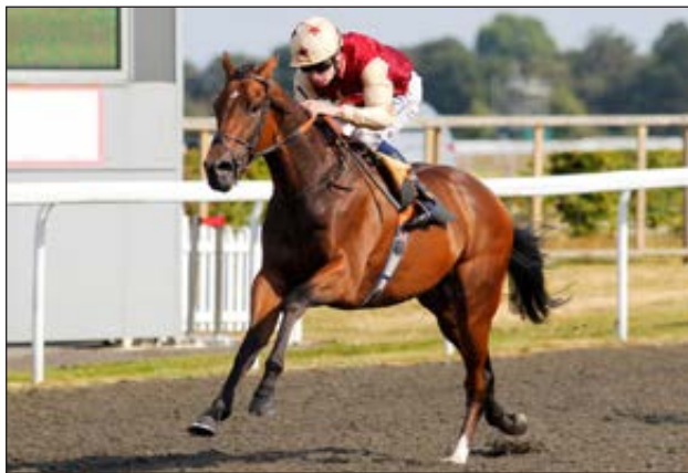
LOADED completes the middle leg of a hat-trick, at Kempton under Oisin Murphy

A half-brother to Elm Park, Brorocco was far too keen in his races in the first half of the season, but improved with experience and went on to record wins at Newmarket and Yarmouth in the summer. Physically he looks the type to progress, which is also the case with Swashbuckle. Swashbuckle looked a young stayer of some potential