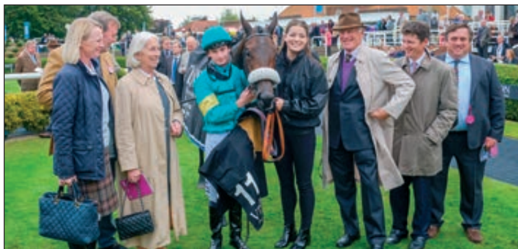
A happy crew with POET'S VANITY after the Group 3 Oh So Sharp Stakes

I have no doubt that the management team has the strength and expertise to maximise the performances of what looks to be a very exciting team of horses for the new season. We are all counting down the days now!