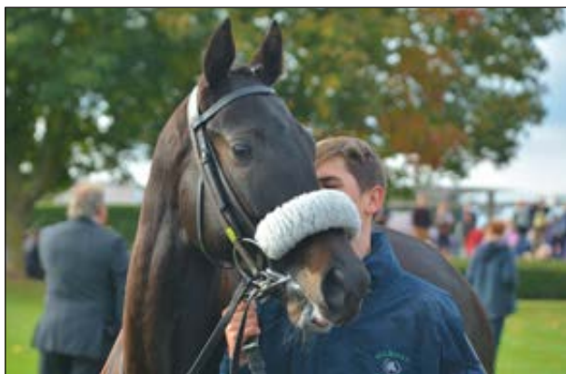
PERFECT ANGEL was amongst our best two year olds and has scope to progress

Isomer started his career in most promising fashion, bumping into Frankel's first winning progeny on his debut at Newbury, and then running an outstanding race in defeat in the Chesham at Royal Ascot, finishing second to the