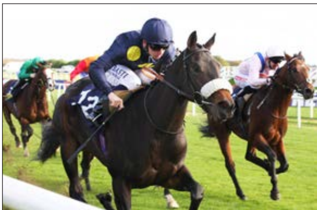
Doncaster winner RELY ON ME is an improving type

looked likely to make up into a better three year old. Similar comments applying to Doncaster winner Rely On Me . A daughter of Kyllachy, she showed marked improvement on her debut form to make all on her second start and she is a filly to look forward to next season. Another winning juvenile filly, Night Law , has since been sold.