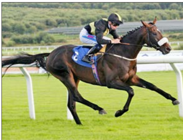
SWASHBUCKLE was a dual winner for the Club in 2016

The 10 winners recorded this season could well be surpassed in our 10th year, as a particularly strong team of older horses, headed by this year's dual winners