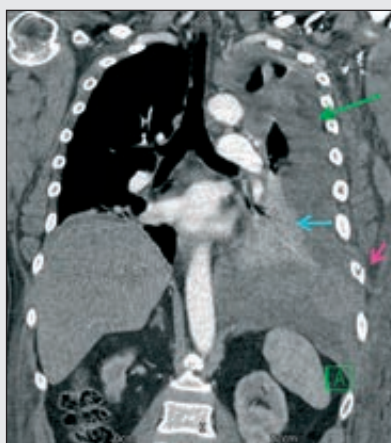
CT chest scan showing one of multiple rib fractures (pink arrow), collapsed left lung (blue arrow) & fluid collection occupying most of left chest