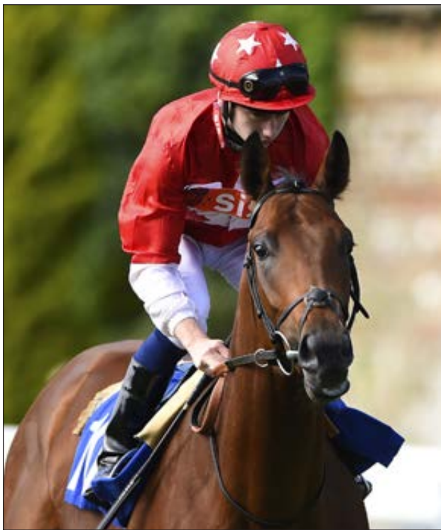
MUCHO APPLAUSE put in a taking performance to win at Salisbury

Transatlantic Racing's Acclamation colt Mucho Applause showed considerably promise on his debut at Newmarket in June. Two starts later, he was off the mark with a taking performance over seven furlongs at Salisbury under Oisín Murphy, handling the soft ground very well and showing a willing attitude. A big, strong individual, he is a lovely type and he should do very well at three, as should Drochaid . A bargain purchase from Book 1, he recouped the vast