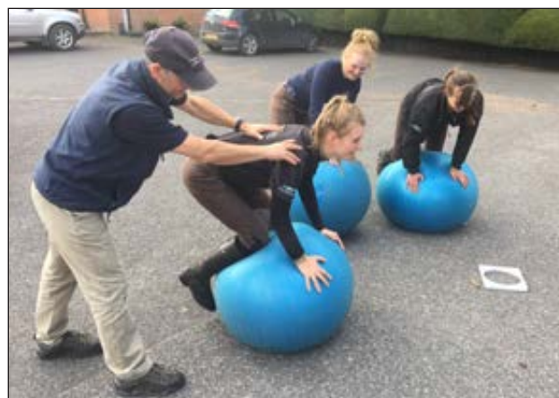
BRS Training Day