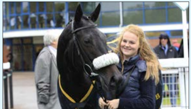
HORSEPLAY recorded the longest winning distance