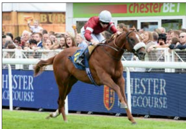
The tough and consistent LEONTES wins at Chester under Oisín Murphy

Though he was one of our first two year olds to reach the track, Leontes improved from race to race, and his narrow maiden win at Hamilton in mid-July was followed by a facile success in a three-runner conditions contest on the Roodee. He wasn't at his best when finishing in midfield in the sales race at Doncaster's St Leger meeting, but has been gelded and enjoyed a good break since. He will stay further and is another very bright prospect.