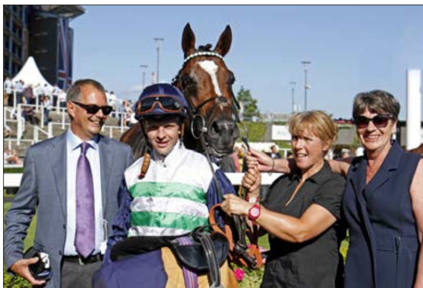
REAL DOMINION had an excellent season before topping the Park House draft at the October sales

Real Dominion's two wins at Kempton Park and Ascot were followed by two excellent runs in defeat in valuable