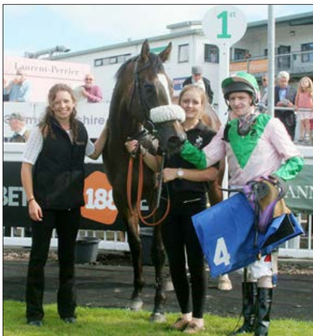
LADY PERIGNON defies long odds to score at Ffos Las

Lorelina had won on her debut at Epsom at two, but a subsequent fall saw her lose her confidence. It was