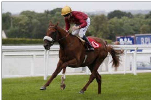
SOUTH SEAS cruises to victory in the Group 3 Solario Stakes at Sandown

Following a slightly below-par run in the Dewhurst, I was very pleased with his performance in the Group 1 Criterium