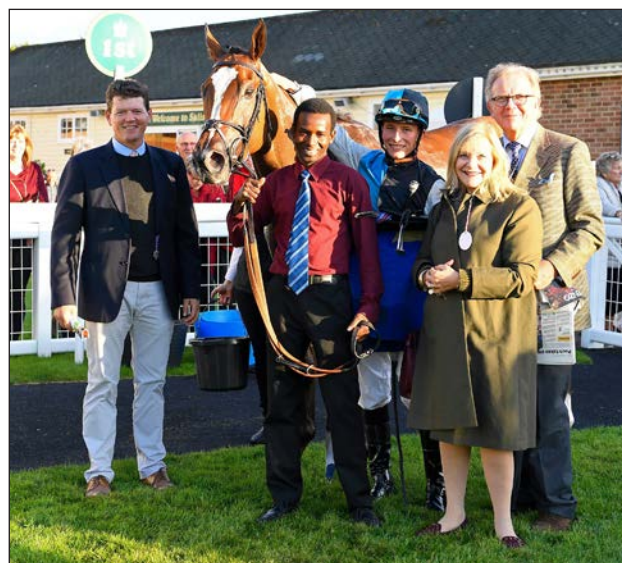
SILVER SWIFT and her fans after winning at Salisbury in September