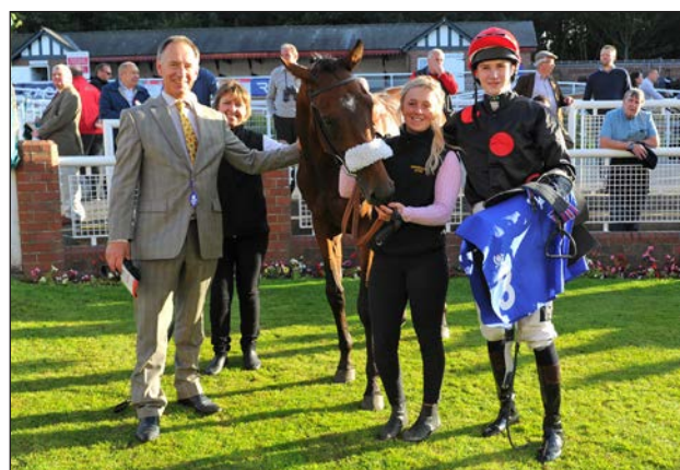
NEVER DO NOTHING after the first of two victories this season