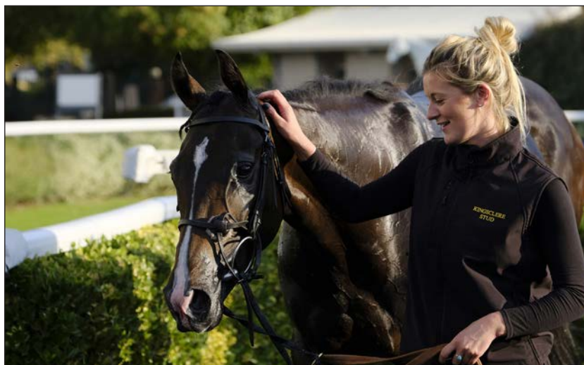
DREAM CATCHING has been a star for connections this year