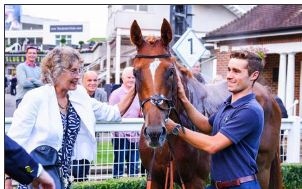
BELLE MEADE was a winner at Sandown and San Siro this year

Making up the Italian trio was Belle Meade who, having won well at Sandown in August and come close at Epsom in September, travelled to Milan to contest the Listed Premio Chiusura over seven furlongs at San Siro. In a perhaps typically Italian fashion, San Siro has several winning posts, with a different one used for each race depending on its length. This was not clear to Belle Meade's owners, who unwittingly managed to position themselves beside a post some way ahead of the actual finish of the