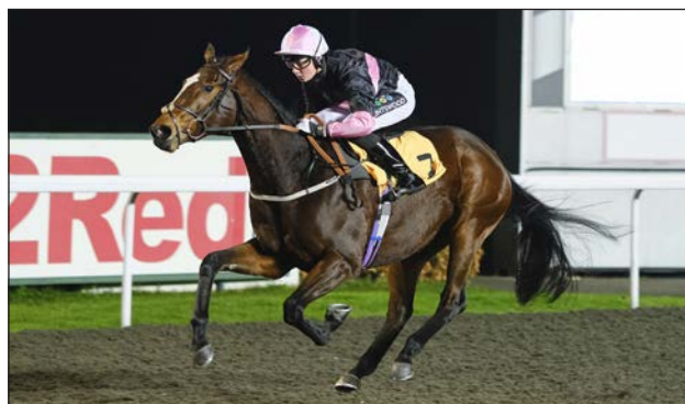
RECTORY ROAD flies home to a six length victory on debut at Kempton