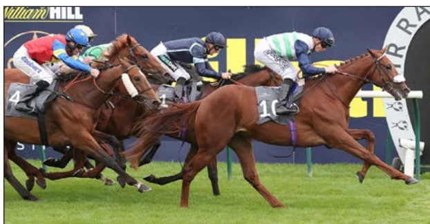
LARIAT wins at Ayr on his second start

Havana Rocket's two runs at Ffos Las is working out very well and has seen him allocated an opening mark of 83. He had a wind operation at the end of the season which should help him get off the mark early on next year.