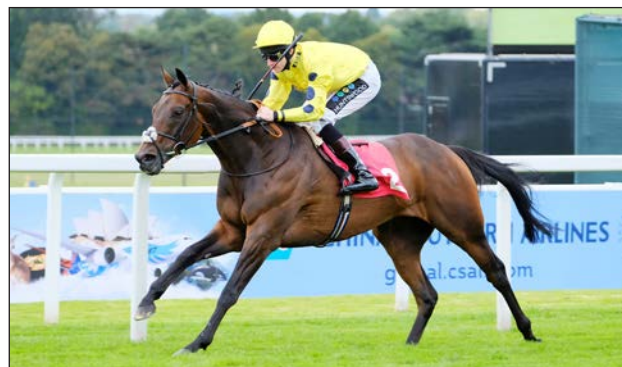
ABSOLUTELY SO records an emotional win at Sandown on his final career start

Duretto is another who will not be gracing the Kingsclere gallops next year, having been sold to race on in Australia. He showed excellent form throughout the season, placing in the Listed Grand Cup at York and the Group 2 Princess Of Wales Stakes at Newmarket before winning the Listed Chester Stakes and travelled to Australia looking to give Park House a real chance in the major Cup races of their Spring Carnival. Having taken his travelling well he ran a blinder in the Group 1 Caulfield Cup, finishing with a late flourish to be fourth in a race not run to suit. He went into a number of notebooks for the Melbourne