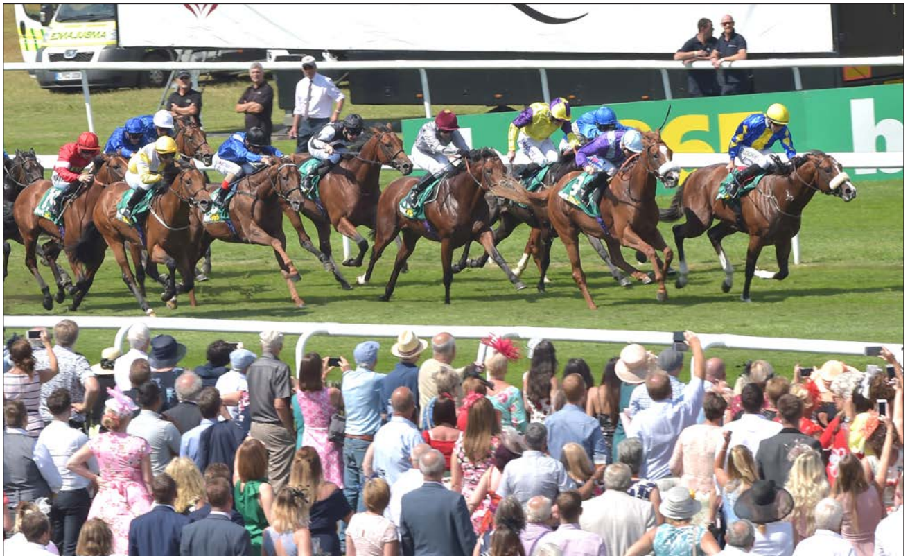
FOXTROT LADY was the top point scorer in 2018