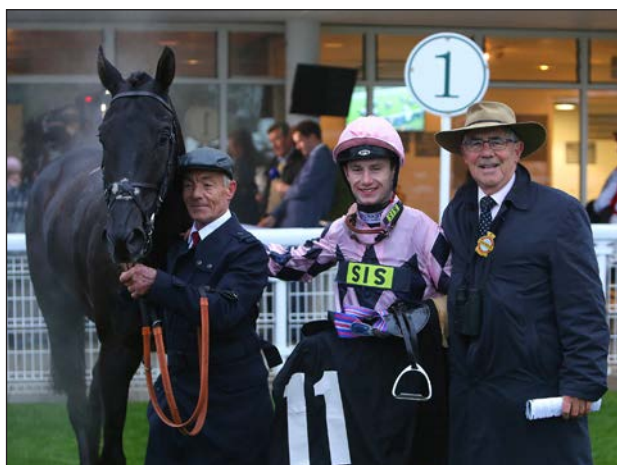
MACAQUE won well at Goodwood in October

A smart two year old, Macaque made a promising start to his season but then became rather keen in his races