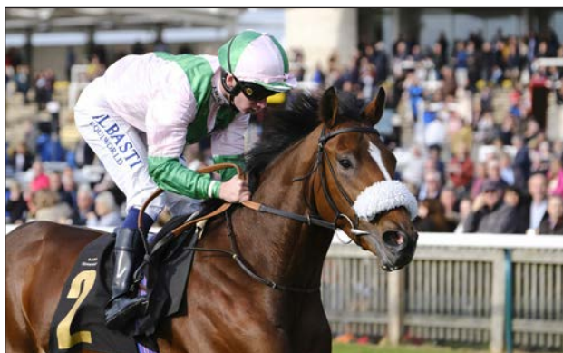
BELL ROCK was very impressive when winning on debut at Newmarket