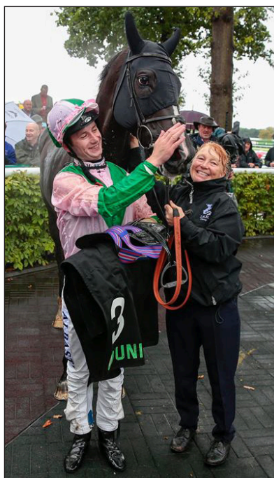
HERE COMES WHEN relishes the mud to win the Group 3 Unibet Mile at Haydock

Whenny will not be the oldest horse in training at Park House next year as Kingsclere Racing Club's Intransigent is also reluctant to hang up his boots. He will be ten next year but continues to be a match for most on the gallops and, having been dropped in the handicap after a couple of below par runs in the first part of the year, placed at