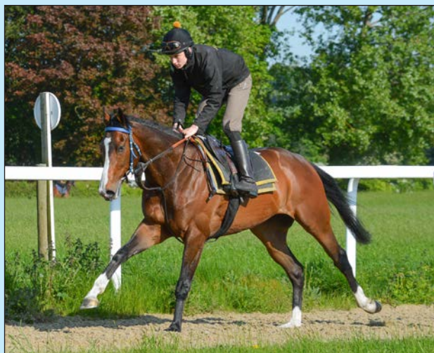
BEAT THE BANK was our top earner in 2018