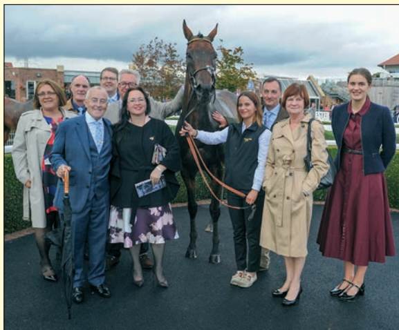
The marvellous INTRANSIGENT wins at Chester at the grand age of nine, one of seven winners on the day for Park House