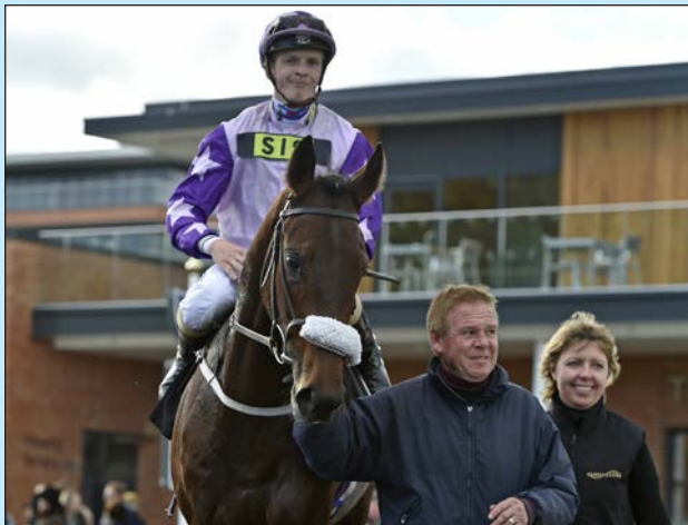
LANDA BEACH was our longest priced winner