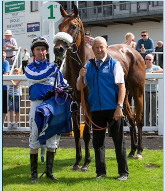
FOX TAL was our highest rated juvenile