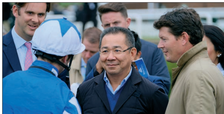
Park House owner Vichai Srivaddhanaprabha will be greatly missed

The Chairman's legacy will live on and the memory of this fantastic man will also remain with all who were lucky enough to have known him for many years to come. ■