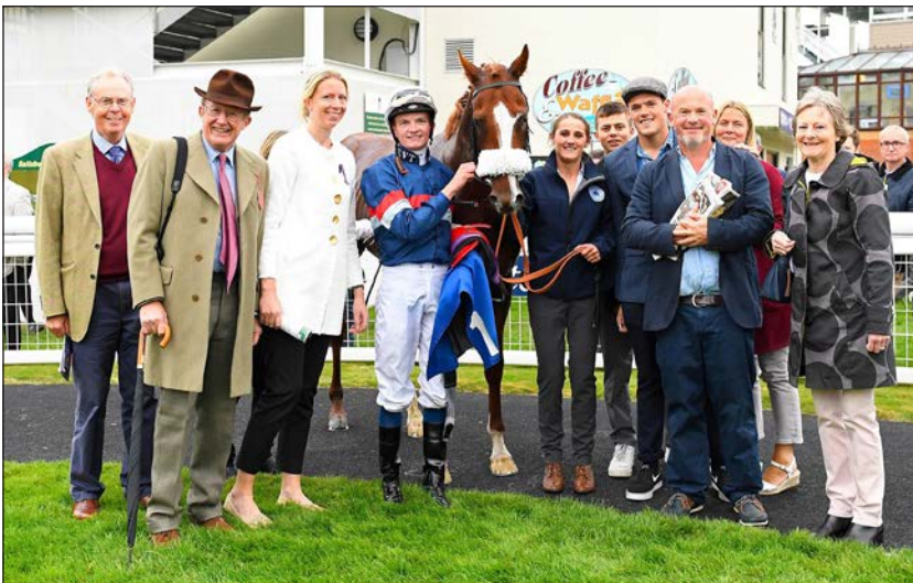
FLASHCARD after recording the second of two victories at Salisbury