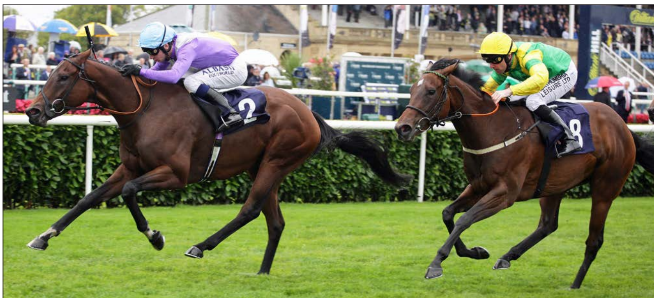
DANCING STAR's victory in the Group 3 Sceptre Stakes at Doncaster was our 100th winner of the season