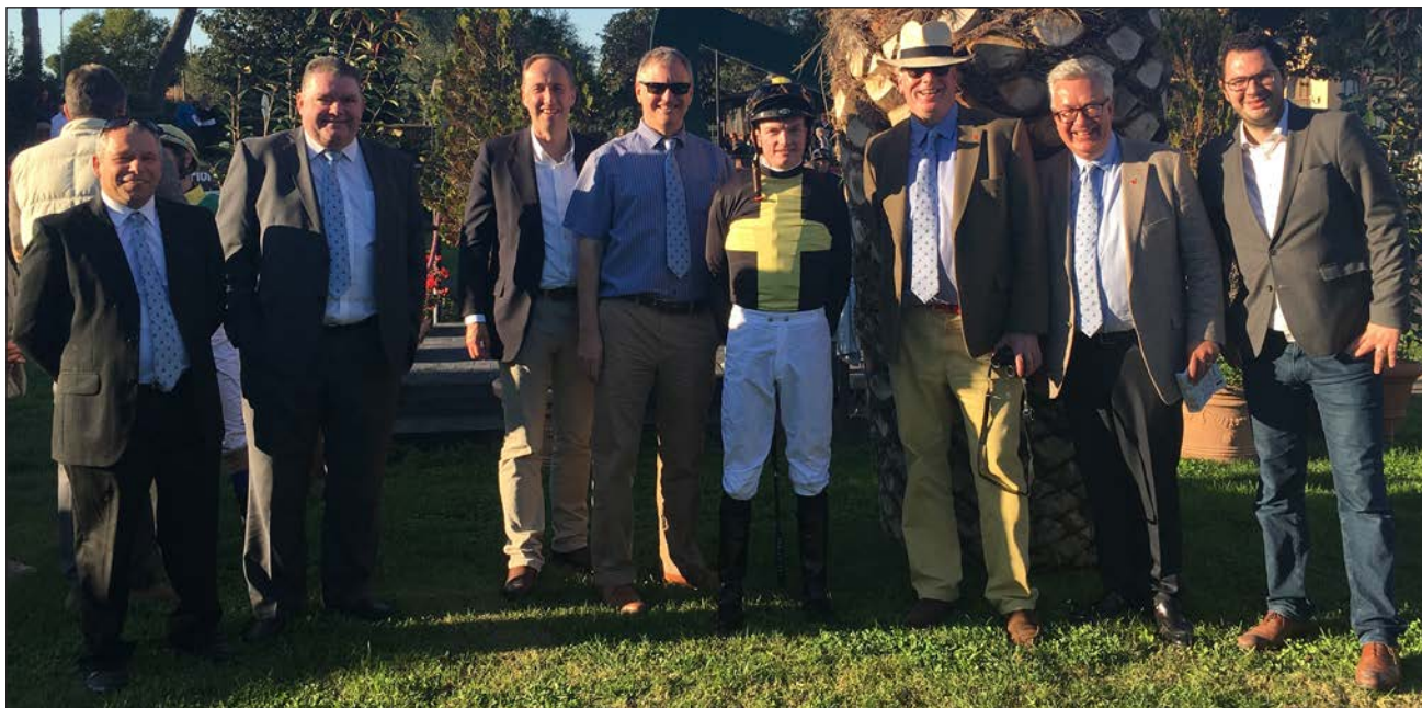
The Italian Mob: a strong KRC presence at Capannelle in November

With so much to look forward to, our launch day for KRC 2019 on Gold Cup day can't come soon enough and our varied social diary (which includes, by popular demand, the return of the Golf Day in April!) will ensure it is a busy season both on and off the racecourse. ■