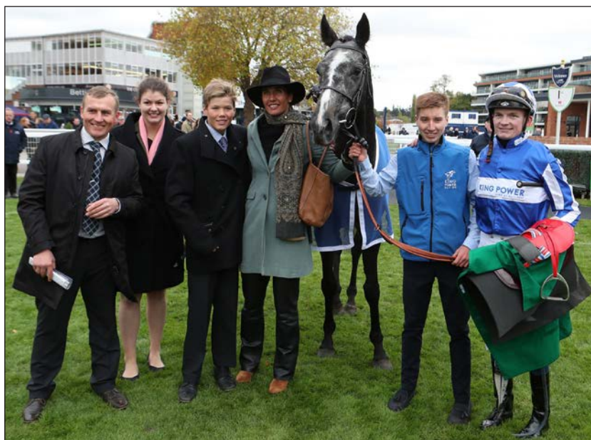
MORANDO shares the spoils in the Group 3 Royal British Legion Stakes at Newbury in October

Kingsclere Racing Club's Brorocco elevated himself from classy handicapper to genuine Group horse this season. Having placed in Class 2 Handicaps at Epsom and twice at Newmarket he ran well to be fifth in the John Smith's Cup before taking the plunge into Pattern company. He defied the weights and his odds to be beaten only a neck in the Group 2 York Stakes in July and, whilst some commentators may have initially crabbed that form, it has since been franked by the winner Thundering Blue who went on to be third in the Group 1 Juddmonte International and second in the Group 1 Canadian International. Brorocco also did his bit for the form when runner-up again at Group level, this time in the Group 3 Rose Of Lancaster Stakes at