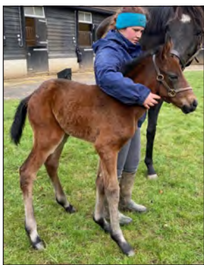
Masar/Highland Pass colt