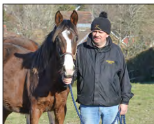
Cityscape/Casual Glance colt

St Mary's) and Averami and Casual Glance have retired so we have their last. Casual Glance is actually retiring for a second time as we felt we had to attempt to produce another Urban Aspect!