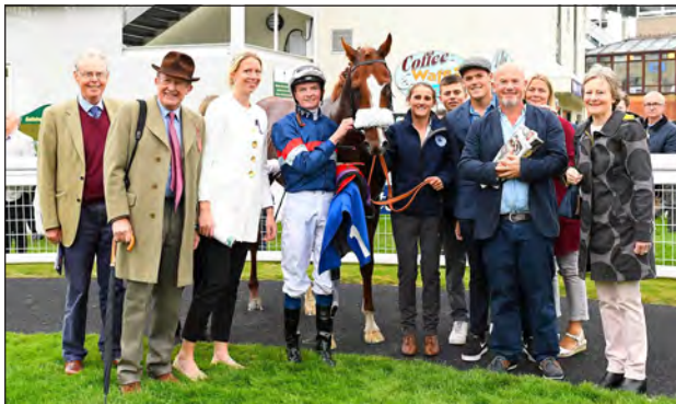
A large group of owners at Salisbury for Flashcard in pre-COVID times

The first recorded racing up on The Race Plain was in 1584, making Salisbury the second oldest course in Britain, after Chester. It has a fascinating history, which includes the reputed most aged building on any racecourse in the world. The Rubbing House (built sometime between 1675 and 1706) is located opposite the parade ring, and has now gained Grade II Listed status. Eclipse and Gimcrack both won at the course, as did Brigadier Gerard and Mill Reef in the 1970's. Lester Piggott's first ever ride in public in 1948, and Steve Cauthen's British debut in 1979, in ground conditions unlikely to be passed fit these days.