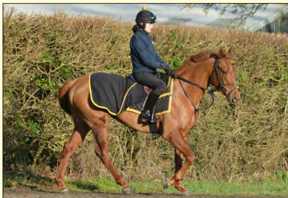
BOUNCE THE BLUES gleaming in the winter sun as she heads out to exercise

Front cover: Reunited – ARCTIC VEGA and devoted groom Shelby Joubert