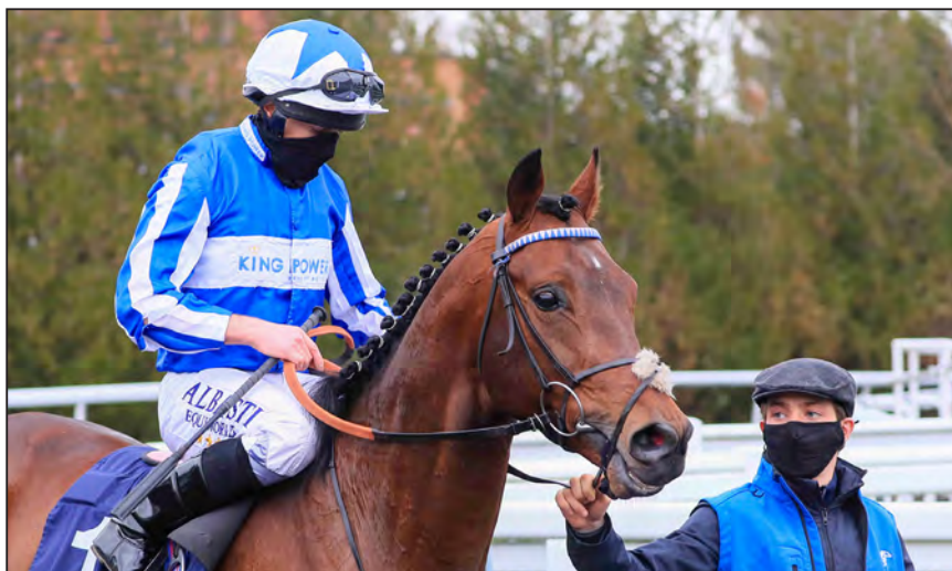
BANGKOK won the Lingfield Winter Derby Trial for the second year running

Spanish Mission's travelling companion to Saudi Arabia was Bangkok , whose victory in the Winter Derby Trial at Lingfield in early February bumped him up the selectors' list for a coveted place in the nine furlong Saudi Cup, the world's richest horse race with a total prize value of a cool US $20m. In a sad twist of fate Bangkok's selection for the race had already been assisted by the demise of his half-brother, Matterhorn, who had been slated for the contest before suffering a fatal injury at Meydan just two days earlier.