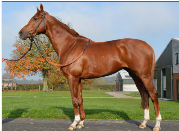
BERKSHIRE ROCCO has already got off to a great start in 2021