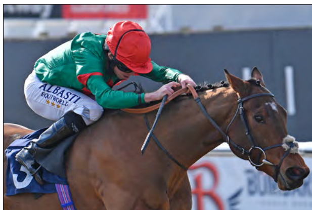
GROVE FERRY won at Lingfield in February and heads to the Lincoln next

Of course, before we get to any classic trials this spring the turf season will kick off at Doncaster with the Lincoln, and we should have a runner in that contest in the shape of Grove Ferry . A dual winner at two, Grovie had run well in good company all last season without getting his head in front and so it was very gratifying to see him back in the winner's enclosure at Lingfield in February, having won a Class 2 handicap over a mile under an excellent ride from Ryan Moore. The penalty for that win will ensure his place in the Lincoln proper and he will head there next. We hope