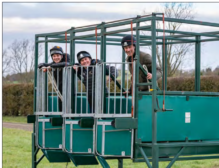
Stalls practice for some unruly youngsters.....

We all have so much to look forward to in the months ahead and will be striving as a team to keep improving. We are very fortunate to have been supported with horses of a very high calibre this year, and I hope that it may even be possible to better the excellent results of 2020! ■