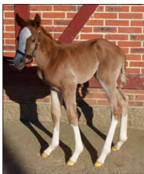
Donjuan Triumphant/Imperial Act filly