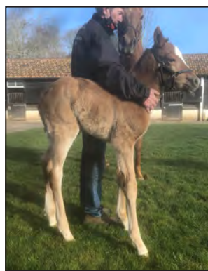
Ulysses/Lizzie Tudor filly