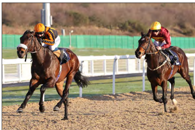
FLYIN' HIGH recording the first of two Novice wins at Newcastle this year

In the race itself Bangkok was not assisted by an inside draw which meant he had to deal with a lot of kickback from the dirt surface, but he stuck to his task well under Ryan Moore (who had ridden him to win at Lingfield) and finished eighth, which equated to just over £290,000 in prizemoney. Bangkok's Lingfield victory qualified him for the ten furlong Easter Classic at the All Weather Championship finals and he will represent King Power Racing there next, whilst the Huxley Stakes at Chester's May meeting could be his first outing on the turf.