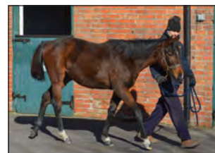
Lightning Spear/Hidden Valley filly