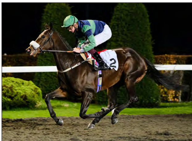
AURIA made light work of a decent field at Kempton in November