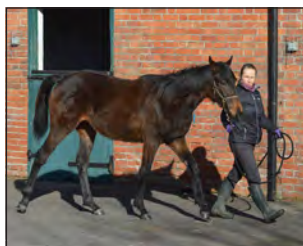
Shirocco/Highland Pass filly