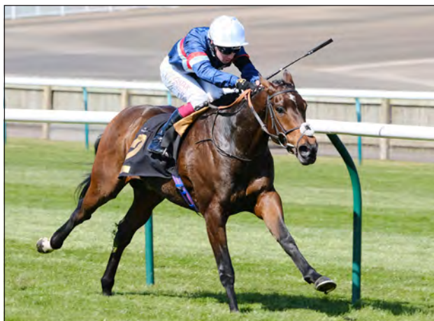
CAROLUS MAGNUS overcame adversity to win the Alex Scott Maiden at Newmarket