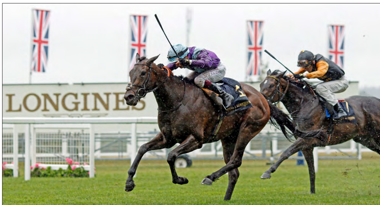
ALCOHOL FREE surges clear under Oisin in the Group 1 Coronation Stakes at Royal Ascot

Hopes were high as Alcohol Free headed for her next Group 1 assignment, the Falmouth Stakes at Newmarket's July meeting, but she jumped almost too well and so had to do all the hard work in front and was just touched off by Snow Lantern and Mother Earth. Next she headed to Goodwood for the Group 1 Sussex Stakes, where she faced Snow Lantern once more but also took on older horses and colts for the first time, most notably 2,000