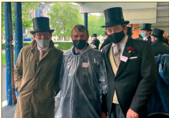
Above: Masked marvels at Ascot before Alcohol Free's win

Front cover: True love – Oisin and the Group 1 Coronation Stakes trophy