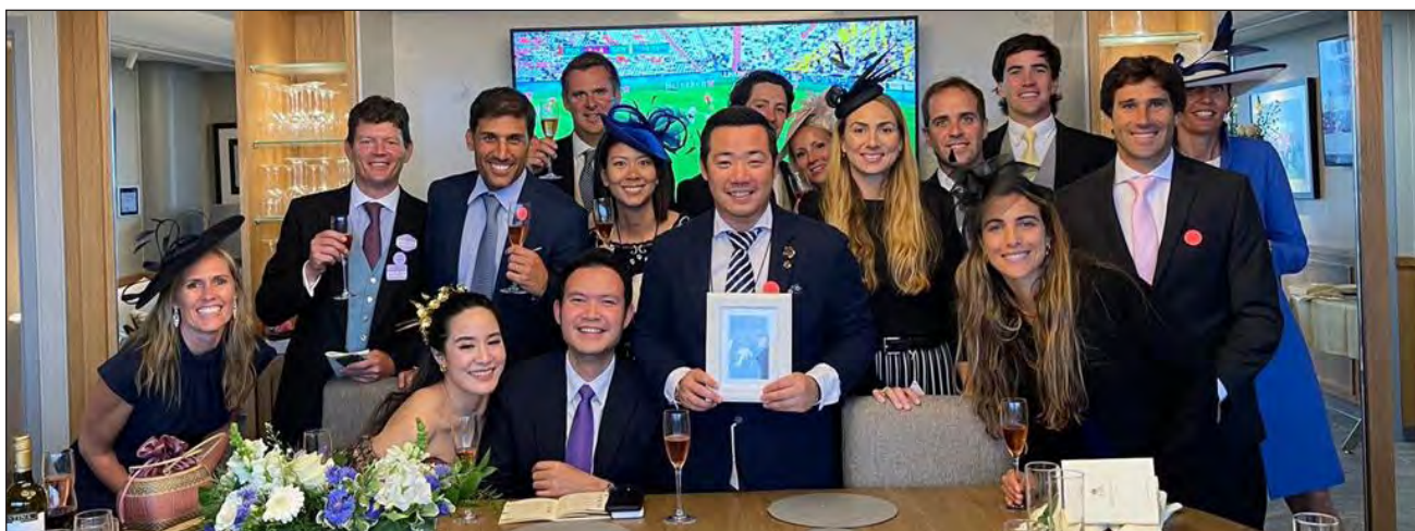
All smiles in the King Power box after FOXES TALES' victory at Royal Ascot