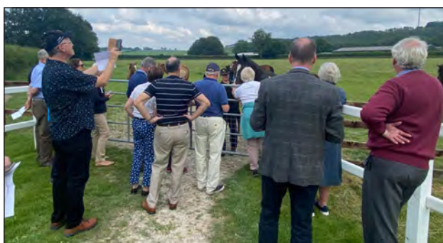
Getting to know some of the youngsters during a visit to Kingsclere Stud

The easing of restrictions has allowed us to welcome members back to Park House again and there was a very good attendance for our 'evening stables' visit, which included an enjoyable and informative trip to the Kingsclere Stud to see the mares and their foals, many of which will be racing in the Club's colours in time.