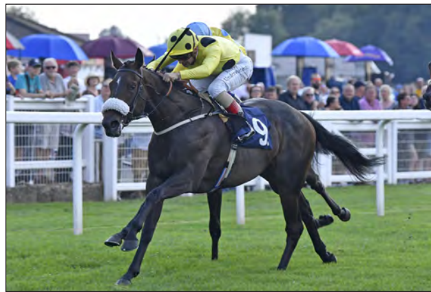
DUBAI JEWEL has a great attitude and has already won twice