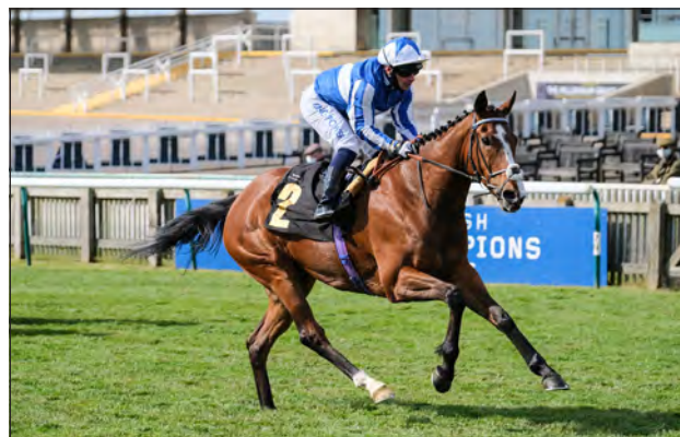
CHIL CHIL has continue to progress this year, winning twice already including at Group 3 level

Chil Chil has recorded close to the fastest top speed on our gallops at home but that title is held by Kings Lynn , who has had a great season so far. Narrowly missing in a Class 2 Handicap at Newbury and a conditions event at Chester, he gained a much deserved stakes victory in the Listed Achilles Stakes over the minimum trip at Haydock