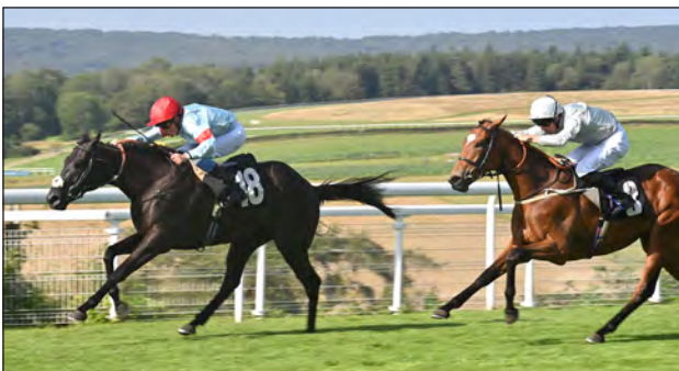
WILDERNESS GIRL streaks clear of her rivals at Goodwood