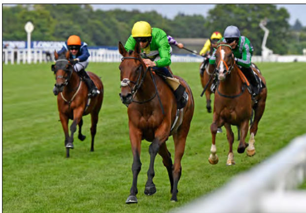
ACHELOIS winning at Ascot, her second of three wins so far this term