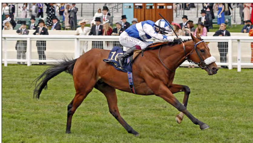
King Power Racing's FOXES TALES was our fourth winner at the Royal meeting