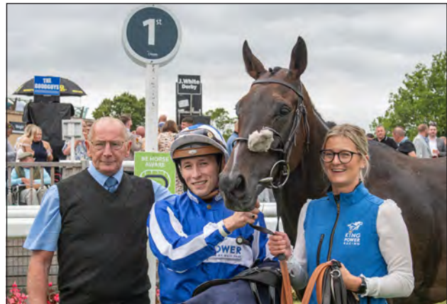
GOOD BIRTHDAY was King Power Racing's 100th winner from Kingsclere