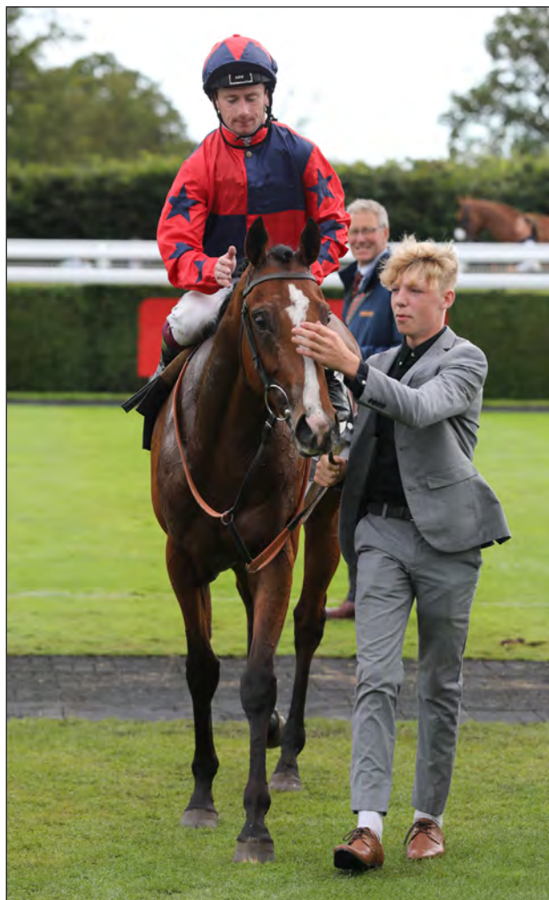
IMPERIAL FIGHTER has really blossomed this summer and won on debut at Goodwood under Oisín Murphy

Having made a flying start with the two year olds it may even be that the best is still yet to come, with plenty of more stoutly bred youngsters impressing at home and waiting in the wings to make their debuts. Exciting times! ■