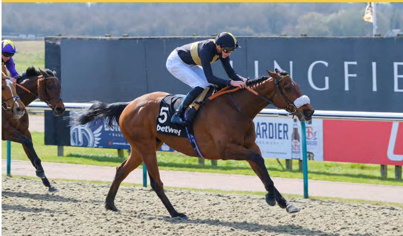
RANCH HAND has been the KRC's flagship this year and took the Marathon at the All Weather Championships

The season got off to a fantastic start for the Kingsclere Racing Club, with Ranch Hand winning twice on the All-Weather, including a memorable success in the All-Weather Marathon Championships Final at Lingfield Park on Good Friday.