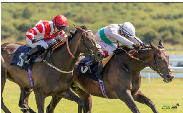
VALLEY FORGE was one of a host of successful raiders at Ffos Las so far this year