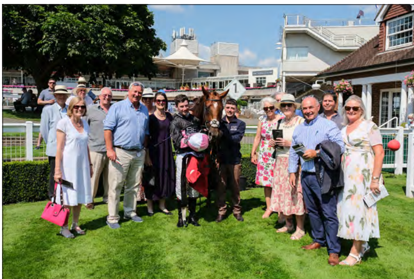
CLASSIC LORD with some of his many fans from the Park House Partnership