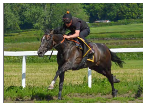
BERKSHIRE SHADOW, winner of the Group 2 Coventry Stakes at Royal Ascot, was purchased by the team for 40,000gns last year

It will not be long before yearling sales season is once again upon us, and members of the team will be at Goffs UK (24-25 August), Baden-Baden (3 September), Tattersalls Somerville (7 September), Tattersalls Ireland (21-22 September), Goffs Orby (28-29 September) and Books 1, 2 and 3 of Tattersalls October (5-15 October). If you have any interest in purchasing a youngster at the sales or getting involved in ownership at Kingsclere, please let us know ( tessa@kingsclere.com ).