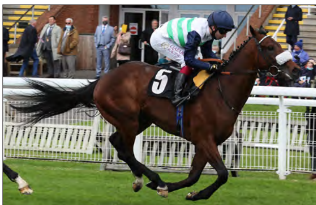
MASEKELA is already a Listed winner and looks well capable of further progress