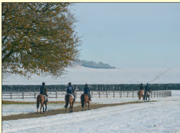
Front cover: BANGKOK loving life in his new home at Chapel Stud