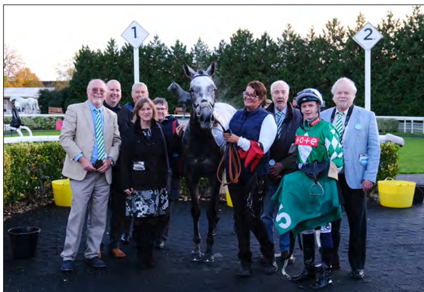
SPRING GLOW was a late developer but has won three times this year