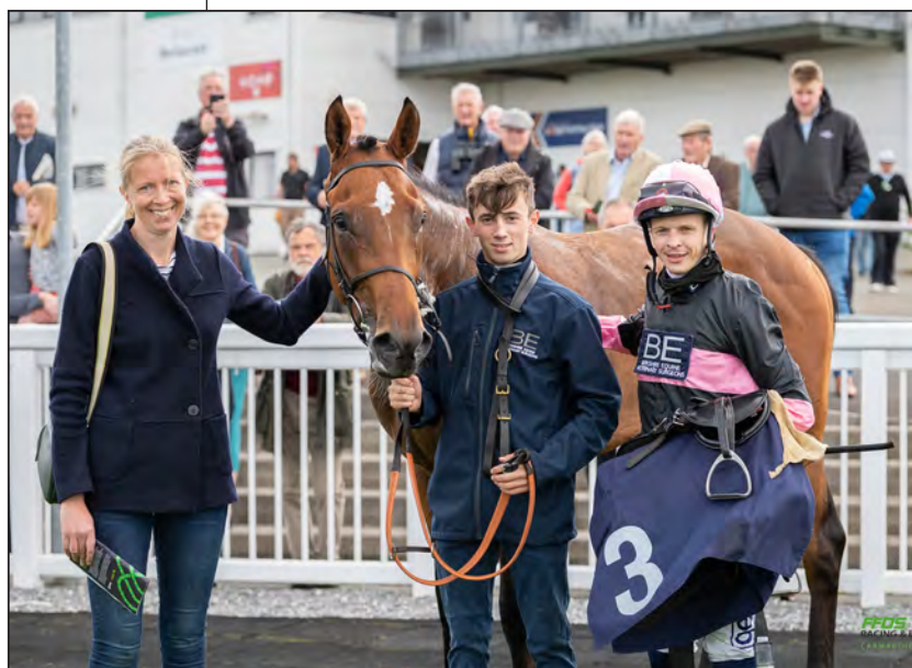
HEY TEACHER was one of seven winners for the team at Ffos Las this season