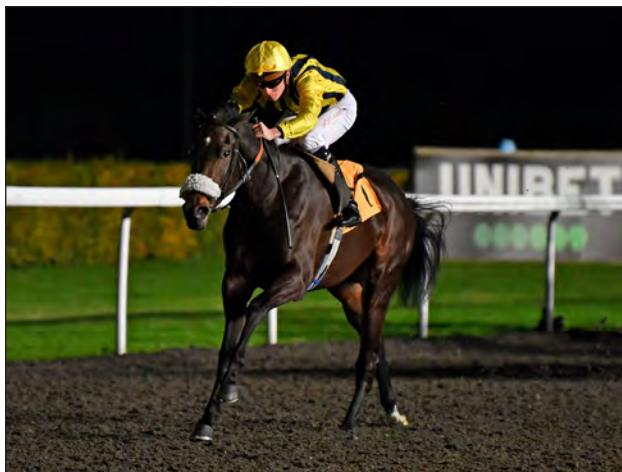
ORZO left her opposition well behind when winning on debut at Kempton