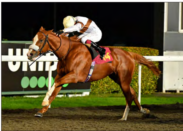
MAY NIGHT is thriving on his racing with three wins this year