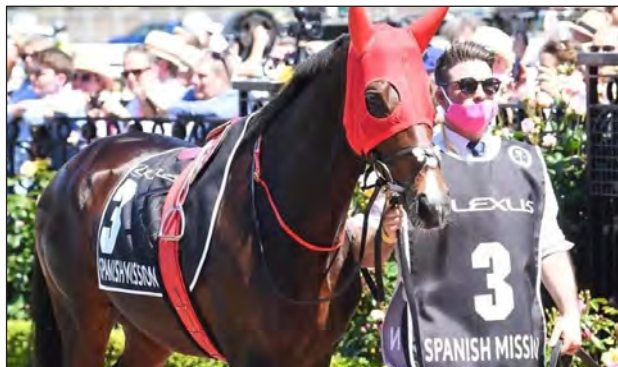
SPANISH MISSION before the Melbourne Cup