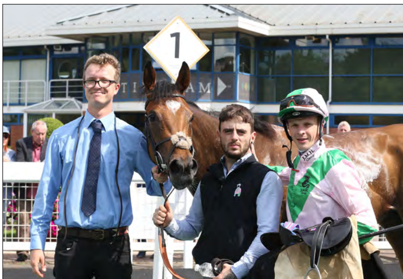
TYPEWRITER won twice at Nottingham and looks a filly to follow next year