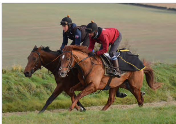
NOBEL and BIZARRE LAW working on the top gallops

As ever there are a host of nice juveniles in the yard who have not yet got their head in front but have shown plenty of promise in their early runs, with Groundbreaker , Aztec Empire , Al Marmar , Soul Stopper , Filbert Power , Love Mystery , Teumessias Fox , Schmilsson , Duty Bound , Hoffman , Lady Clementine and Australian Angel springing immediately to mind. There are plenty more that I have missed in that list, plus a fair few yet to make the track who have impressed in training. Following this crop's exploits next term will be a full-time job in itself, but no doubt one with plenty of highlights! ■