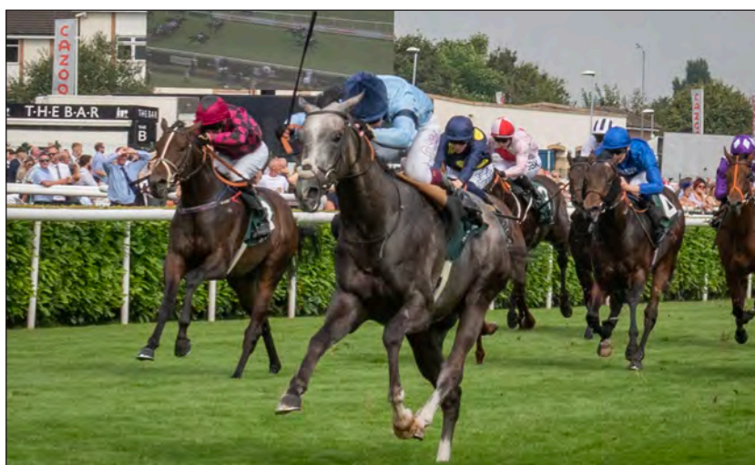
HARROW's win in the £200,000 2yo Stakes at Doncaster was one of three victories for the talented juvenile

Masekela cost just 30,000gns at the yearling sales and £30,000 was what it took to buy Imperial Fighter , his sire The Gurkha having already become rather unfashionable in the fickle bloodstock market. Imperial Fighter won on debut at Goodwood before filling the runner-up spot in two Group 3 contests – the Acomb Stakes at York (behind subsequent Royal Lodge winner Royal Patronage) and the Autumn Stakes at Newmarket (behind the hugely exciting Coroebus). A close-up fifth in the Group 1 Futurity Trophy