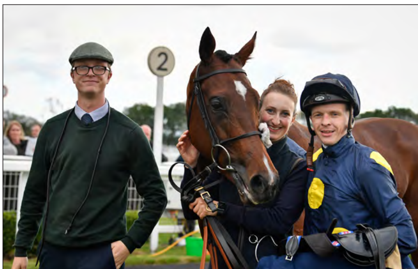
Listed winner GOOLWA is one of a very strong squad of older fillies

A half-sister to Chil Chil, Auria had looked talented when winning at Kempton in December last year on just her second start. She ran well on reappearance when second in a conditions event at Ascot in April before winning the Listed Coral Distaff at Sandown in July under Oisin Murphy. She faced a tough task in a strong renewal of the Group 3 Atalanta Stakes back at Sandown in August, finishing seventh behind subsequent Sun Chariot