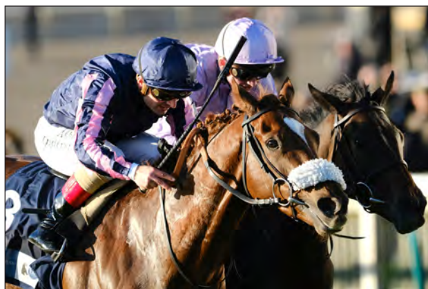
JUAN BERMUDEZ showed a great attitude when winning at Newmarket on his second start