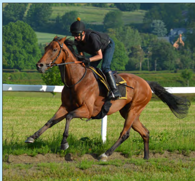
FOX TAL has run an impressive eleven times this year