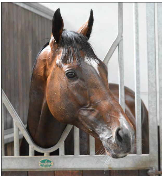
SPANISH MISSION made a big impact in his relatively short time with the yard

The Melbourne Cup had been on the agenda for some time but just getting to the race was an achievement in itself. The impact of COVID meant that travel to Australia had become much more complicated, whilst new rules introduced by Racing Victoria in the wake of a run of injuries and fatalities in the race in recent years meant that all international contenders had to pass an onerous series of scans, tests and veterinary examinations before being allowed to board the plane. Spanish Mission duly sailed through these hoops only for his departure to be delayed after he presented with muscle spasms after exercise in quarantine, meaning he missed his intended prep run in the Caulfield Cup.