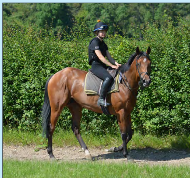
HOLD FAST is another busy bee with eleven starts