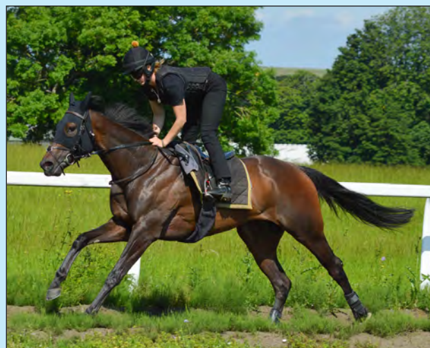
ALCOHOL FREE was our top earner this year