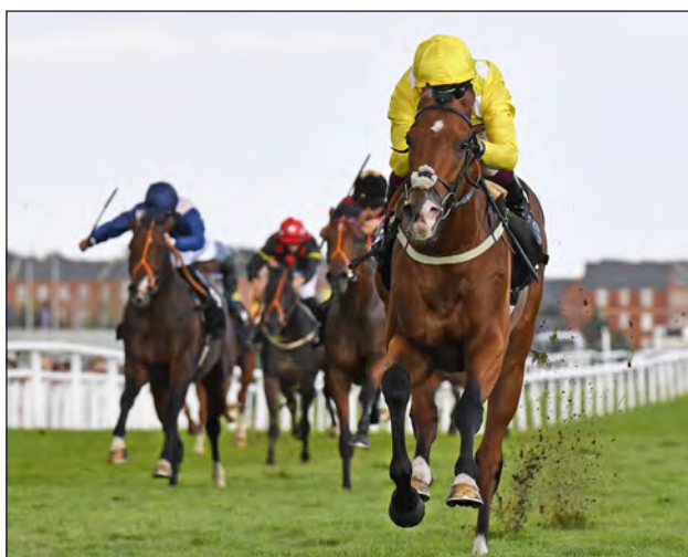
KOY KOY surged clear of the rest when winning at Newbury on his third start