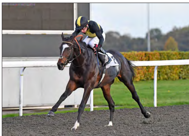
BASHFUL finally got his head in front after six placed efforts for the KRC