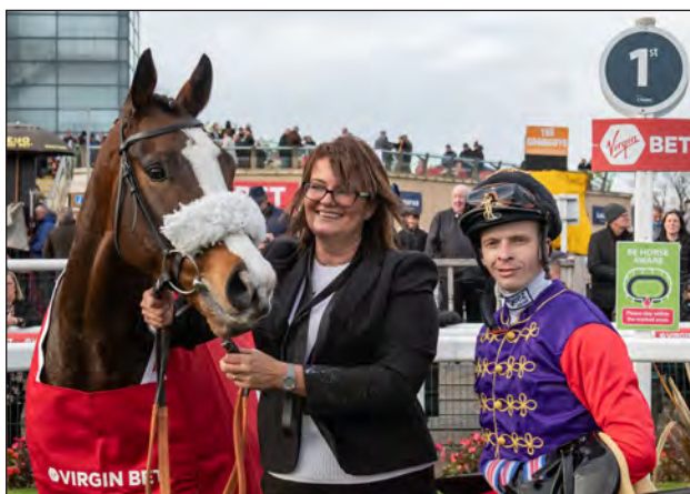
KING'S LYNN was a dual Listed winner this year for H.M. The Queen

at Ascot – the Challenge Cup over seven furlongs and the Balmoral over a mile. Best on a softer surface, he should continue to do well when he returns to the track in the Spring. The same is true of fellow mudlark Happy Power who, despite not having won this season, has continued to perform with great credit over six furlongs to a mile, placing in the Group 2 Bet365 Mile at Sandown in April, the Group 1 Diamond Jubilee Stakes at Royal Ascot in June, and the Group 3 Lennox Stakes at Goodwood in July. Very fresh and well after a break, he is back cantering and should be ready for any softer turf conditions in the Spring.