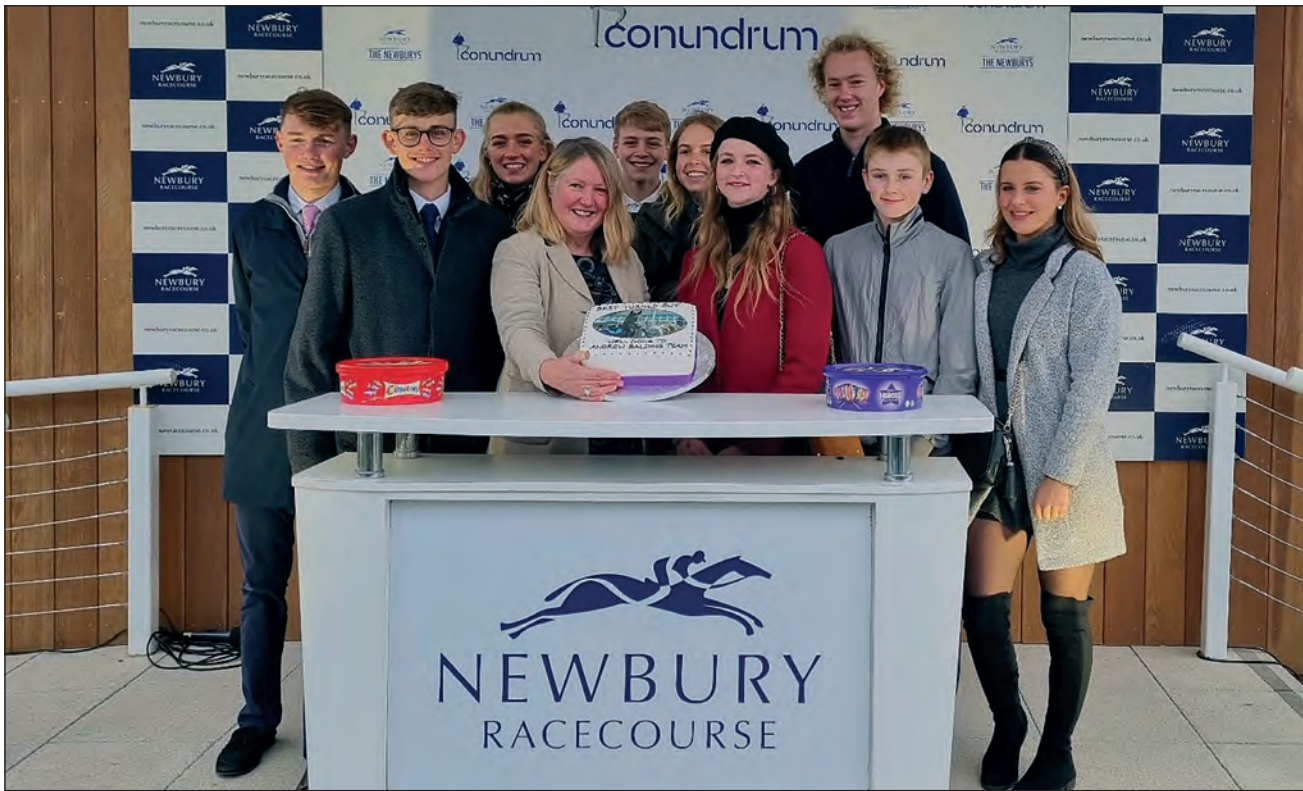
Members of the team collecting the award for most Best Turned Out prizes at Newbury during the season