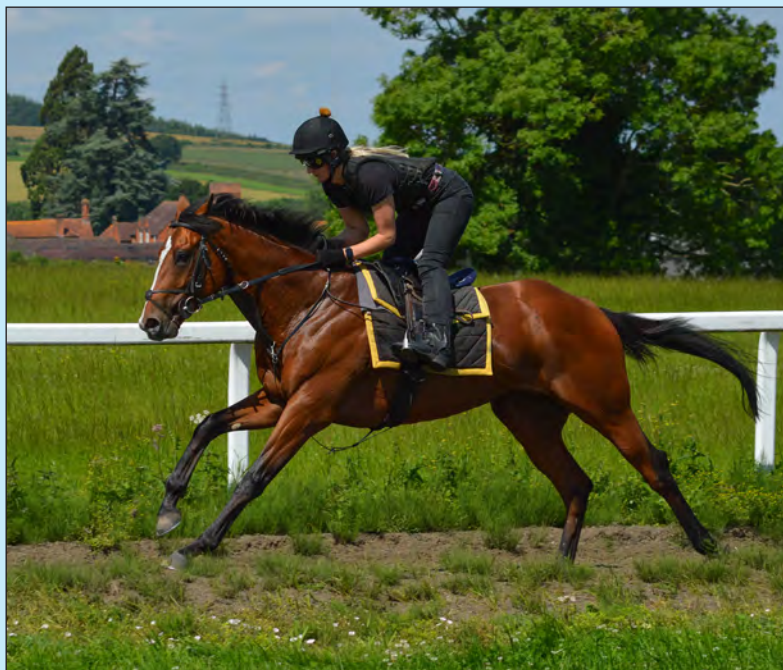
IMPERIAL FIGHTER was our top-rated juvenile with Timeform