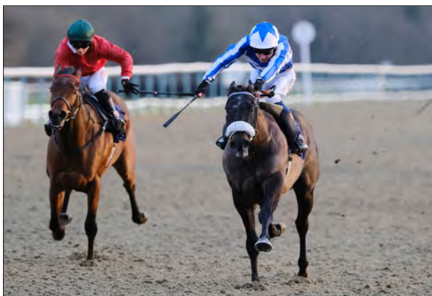
NOTRE BELLE BETE opens his winning account on stable debut at Lingfield