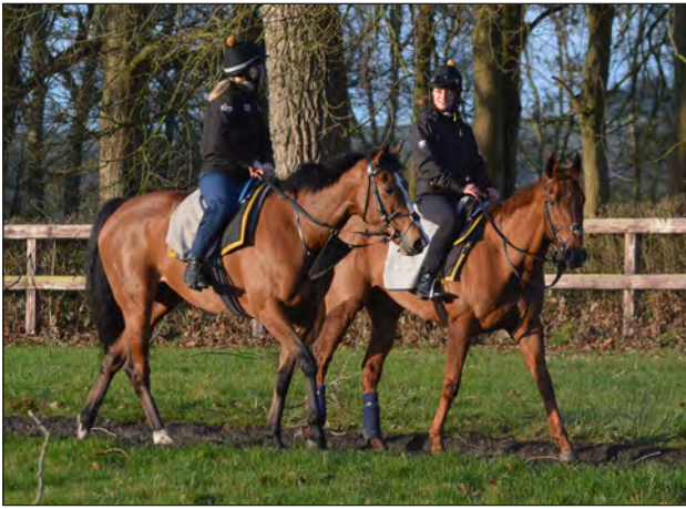
CHIL CHIL and BOUNCE THE BLUES return from exercise