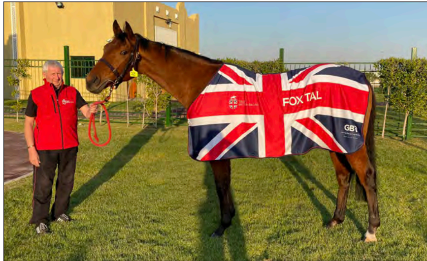
FOX TAL has enjoyed a busy last twelve months finishing a fine third in the Amir's Trophy in Doha