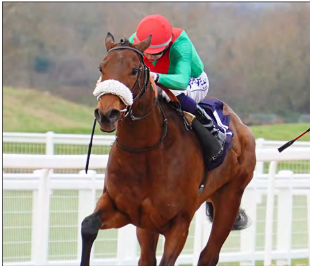
DUCAL CROWN winning at Southwell