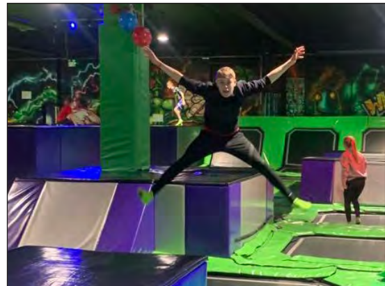
Hostel trip to Flip Out