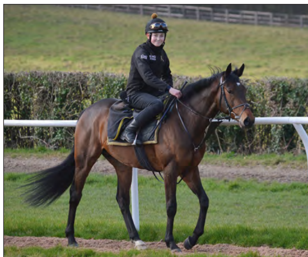
BERKSHIRE REBEL a Goodwood winner who shaped like a future stayer in the Zetland Stakes

Amongst the squad of older horses it may well be the fillies and mares who lead the charge. Alcohol Free has returned from her winter break in great order and is very much full of the joys of Spring. Her main target will be the defence of her Sussex Stakes crown at Goodwood and she won't be rushed this term, but the Group 2 Duke Of Cambridge Stakes over the mile at Royal Ascot and another crack at the Group 1 Falmouth Stakes at Newmarket's July meeting might well provide good stepping stones. Chil Chil enjoyed a fabulous season last year, culminating in her close third in the Group 1 Haydock Sprint Cup in September. Now six, she looks tremendous at home and her main target will be the renamed Group 1 Platinum