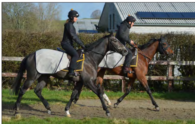
BERKSHIRE SHADOW and HOO YA MAL are both exciting three year olds