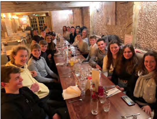
Sampling local cuisine

Everyone in the hostel has been kept entertained over the winter with various expeditions and activities. Recently there has been a nice Italian dinner at Amore in Overton and a trampolining trip to Flip Out in Basingstoke, along with regular football on Tuesday and Wednesday evenings.