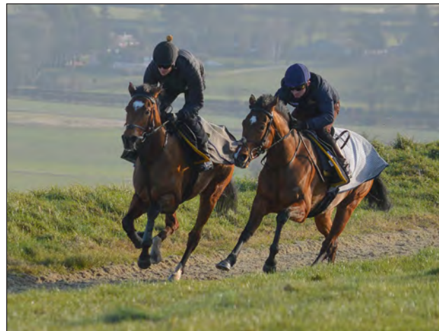
GOOLWA (nearside) finished last year in style with a Listed win

King's Lynn had two Listed wins last year and his Royal Ascot performances proved that he is a force to be reckoned with at Stakes level. Equally effective at five and six furlongs, his main target for the first half of the season will be the Group 1 King's Stand at the Royal meeting, where we will be hoping for significantly more luck in running than