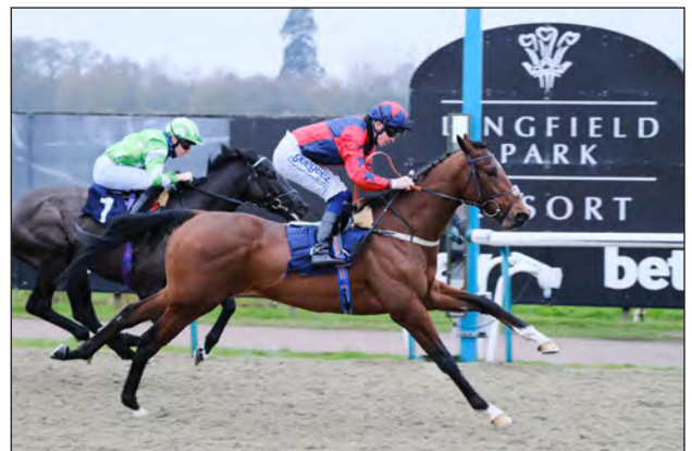
WAR IN HEAVEN makes it two from two at Lingfield