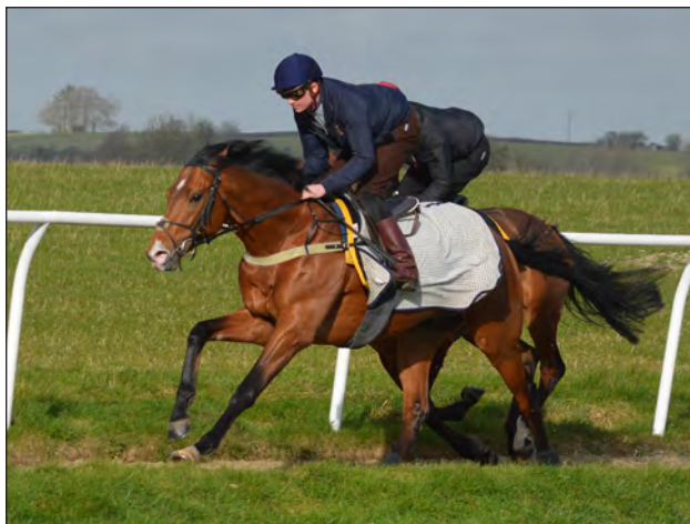
KOY KOY an easy winner at Newbury on his third start