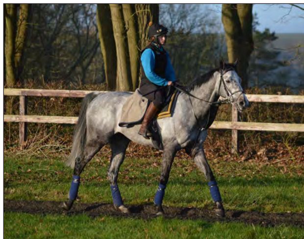
MORANDO the senior citizen at Park House

The wonderful Bell Rock is entering his fifth season racing for Park House and is a very valued part of the furniture here. He is three from four at Newmarket's Rowley Mile course, with his one miss at the track being a creditable third in the Cambridgeshire in 2020. He will probably start out back there at the Guineas meeting, seeking back-to-back wins in the Suffolk Stakes. He could, however, have to contend with Carolus Magnus , who is two from two at the track and has youth on his side with only six starts at three last year to his name. Shining in his early work this term, Carolus is entered in the Lincoln but might not make