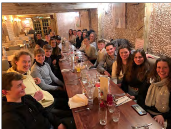
Sampling local cuisine

Everyone in the hostel has been kept entertained over the winter with various expeditions and activities. Recently there has been a nice Italian dinner at Amore in Overton and a trampolining trip to Flip Out in Basingstoke, along with regular football on Tuesday and Wednesday evenings.