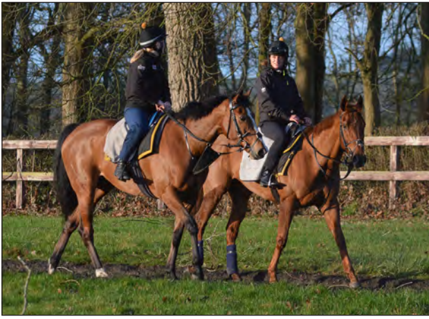
CHIL CHIL and BOUNCE THE BLUES return from exercise