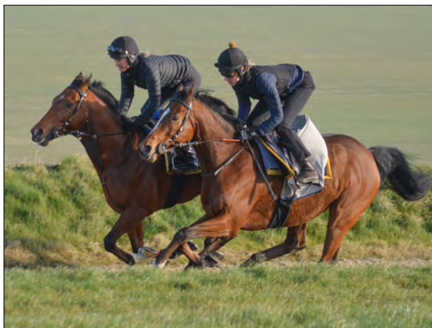
BELL ROCK and FOXES TALES both enjoyed successful seasons in 2021

Oo De Lally is another genuine type over seven furlongs and won three decent handicaps last term. We hope that a wind operation might help him bridge the gap into Stakes company this year.