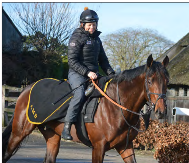
MASEKELA winner of the Denford Stakes at Newbury

Highclere Thoroughbreds' Harrow was very progressive last year and has developed into a physically impressive colt over the winter. Having narrowly missed an invitation to the Saudi Derby, he ran very well in the Kempton "Road to the Kentucky Derby" conditions race on his reappearance,