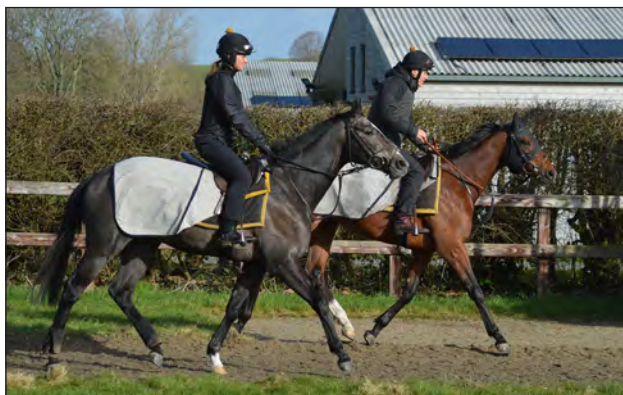
BERKSHIRE SHADOW and HOO YA MAL are both exciting three year olds