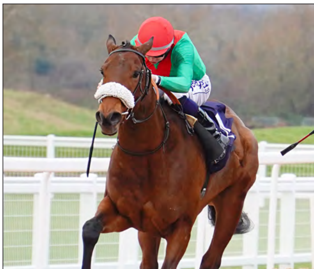
DUCAL CROWN winning at Southwell