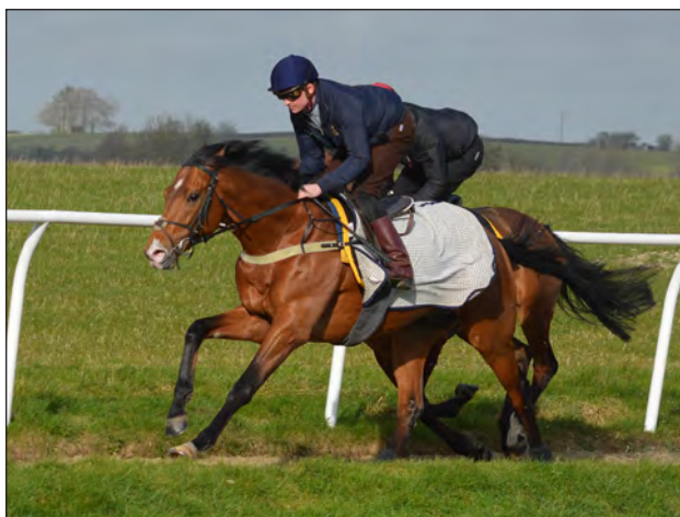
KOY KOY an easy winner at Newbury on his third start