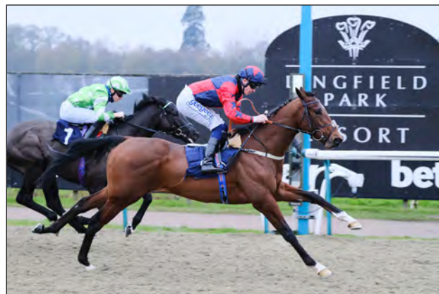
WAR IN HEAVEN makes it two from two at Lingfield