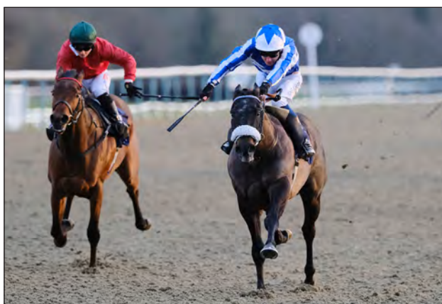
NOTRE BELLE BETE opens his winning account on stable debut at Lingfield