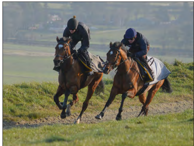
GOOLWA (nearside) finished last year in style with a Listed win

King's Lynn had two Listed wins last year and his Royal Ascot performances proved that he is a force to be reckoned with at Stakes level. Equally effective at five and six furlongs, his main target for the first half of the season will be the Group 1 King's Stand at the Royal meeting, where we will be hoping for significantly more luck in running than