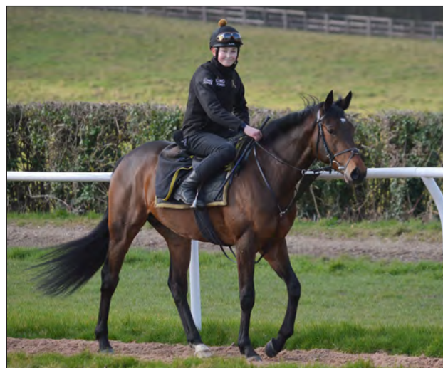
BERKSHIRE REBEL a Goodwood winner who shaped like a future stayer in the Zetland Stakes

Amongst the squad of older horses it may well be the fillies and mares who lead the charge. Alcohol Free has returned from her winter break in great order and is very much full of the joys of Spring. Her main target will be the defence of her Sussex Stakes crown at Goodwood and she won't be rushed this term, but the Group 2 Duke Of Cambridge Stakes over the mile at Royal Ascot and another crack at the Group 1 Falmouth Stakes at Newmarket's July meeting might well provide good stepping stones. Chil Chil enjoyed a fabulous season last year, culminating in her close third in the Group 1 Haydock Sprint Cup in September. Now six, she looks tremendous at home and her main target will be the renamed Group 1 Platinum