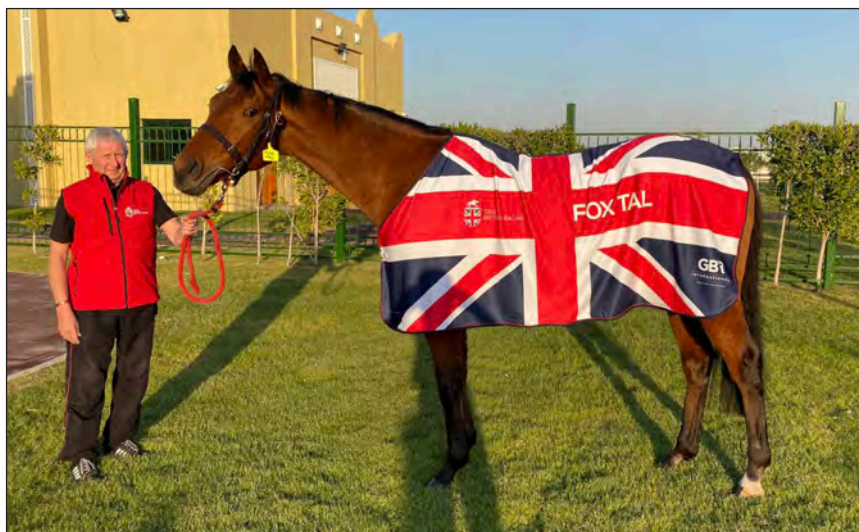
FOX TAL has enjoyed a busy last twelve months finishing a fine third in the Amir's Trophy in Doha