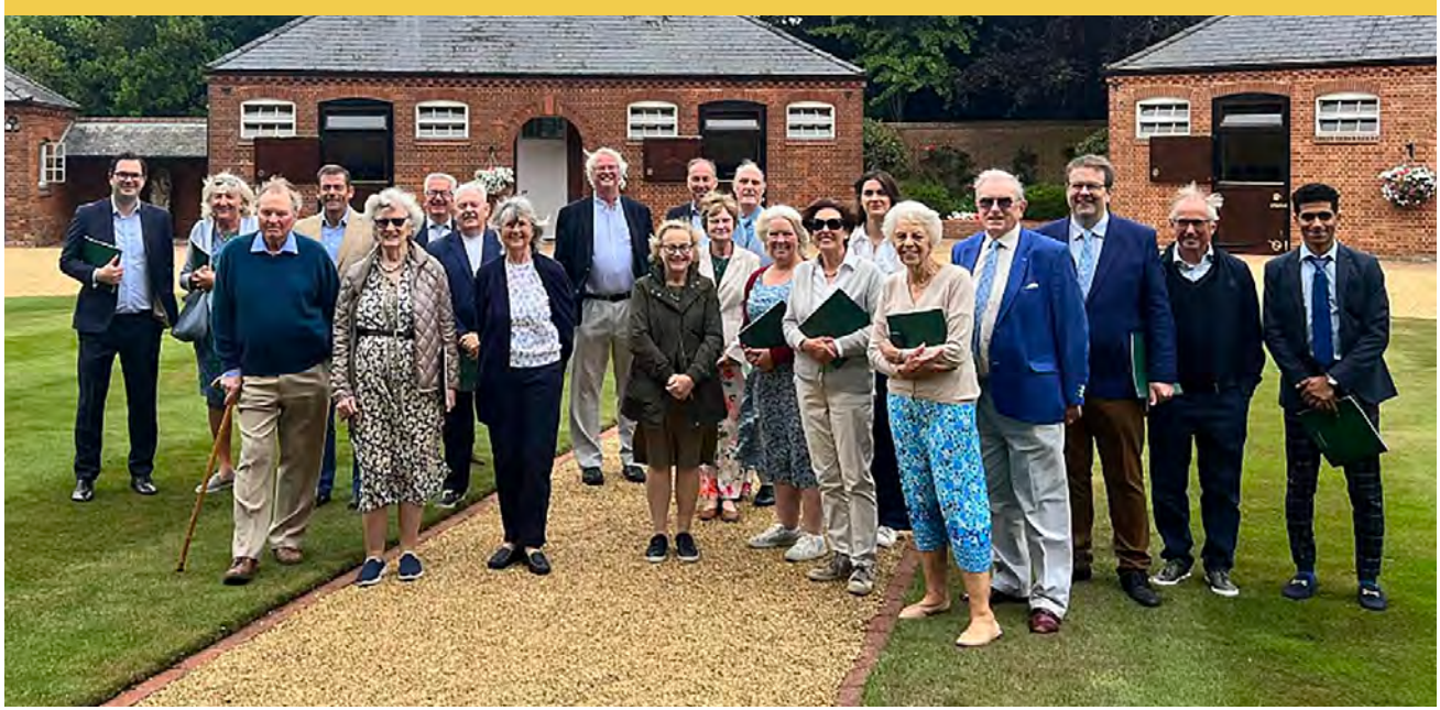
Kingsclere Racing Club visit to Banstead Manor Stud during the Newmarket July meeting

he Kingsclere Racing Club are enjoying a fine season on the racecourse, with seven winners already on the board.