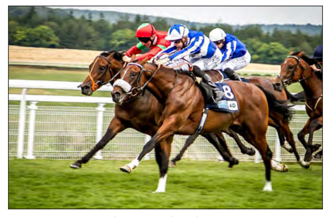
THE FOXES wins at Glorious Goodwood

King Power look to have a smart two year old in The Foxes , who although ran a disappointing race in the Chesham at Royal Ascot, made no mistake when winning at Goodwood next time. In doing so, he beat a well-bred, and well-fancied son of Dubawi, who had already shown strong form and he will jump up to pattern level for his next start.