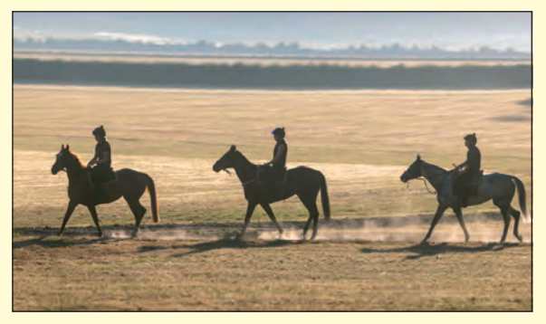
Above: Horses heading home in the heat