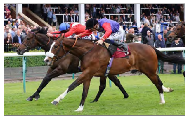
KING'S LYNN wins the Group 2 Temple Stakes at Haydock

at the start of this year, he has disappointed in three starts on turf, including in cheekpieces last time in the Britannia. He has been gelded, and hopefully that can put him back on track for his return in the autumn.