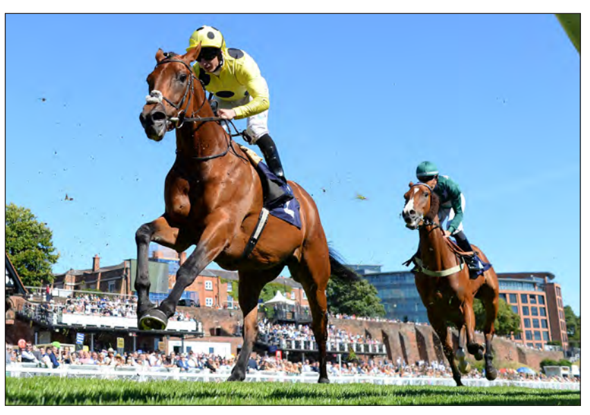
SOUL STOPPER wins at Chester

It was no surprise to see Soul Stopper illustrate improved form when stepped up in trip as a three year old, rather like his sire Postponed, also owned by