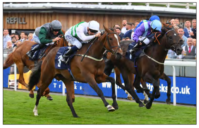
MLLE CHANEL makes a winning debut at Chester

As a half sister to Miss Cap Estel, a multiple 8-12f winner for us at Kingsclere, it was exciting to see Mile Chanel win on her debut over 7f at Chester in June, beating a previous winner into 2nd. She showed her inexperience throughout the race, and although they finished in a bit of a heap, she was value for much more than the winning distance of a head. She