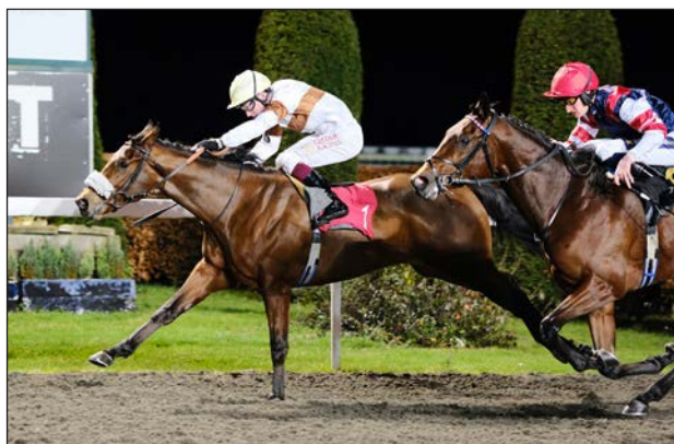
LESSAY made a winning debut in December