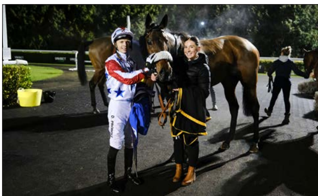
PAGE THREE has headed back to the USA to be covered