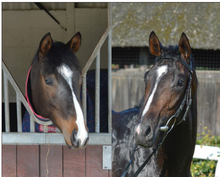
Like Father like Son: current two year old BERKSHIRE KAMEO (left) and his sire KAMEKO (right) at a similar age

We also have talent amongst the three year olds and some high class older horses have remained in training, providing the basis for a very solid team for the season ahead. With 21 winners already on the board, the foundations have been laid for a memorable season for the Park House team. ■