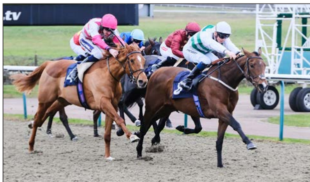
ALL AGLEAM was our first winner of 2024