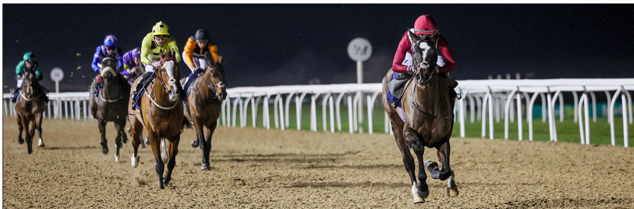
HOPEFUL showed her rivals a clean pair of heels at Newcastle