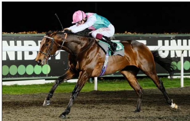
FIRE DEMON has already won twice this year

and win by over three lengths from three-time Group 3 winner Max Vega, who has since won again. All being well, Teumessias Fox will head to Newcastle on Good Friday for the ten furlong race at the All Weather Championships and, as a previous course and distance winner, he should give a good account there. Fivethousandtoone had been knocking at the door on the All Weather this winter and fully deserved his Class 2 win at Kempton on Valentine's Day, coming between horses under Oisín Murphy to score over six furlongs with a bit in hand. He too has the All Weather Championships on his agenda and is another course and distance winner, in his case for the Sprint. The imposing Legacy Power has taken time to mature into his sizeable frame but a step up in trip and a drop in class saw him get his head in front over two miles at Kempton in late February. He has only gone up a pound for that success and, having always had a bit of class about him, he should remain competitive in the coming months.