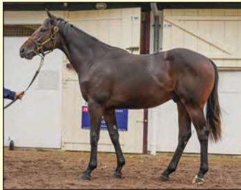
PARC DOSNE, Cloth Of Stars / Edavanna colt Lot 327, Arqana October Yearlings