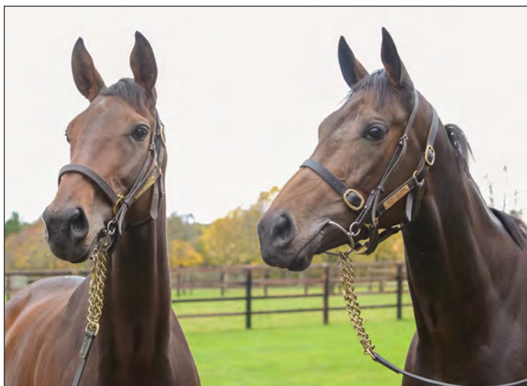
KALPANA (right) on holiday at Juddmonte's Banstead Manor Stud with fellow Group 1 winning filly BLUESTOCKING

Although there is not a huge amount of time to sit back and reflect on this year's achievements as the new season is only a month away, there is time to say a heartfelt thank you to everyone who has worked so hard to make 2024 a record-breaking year to remember. ■