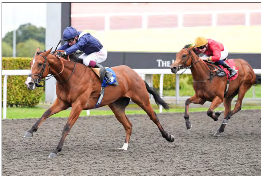
GALLANT was part of an excellent start for his young sire Hello Youmzain