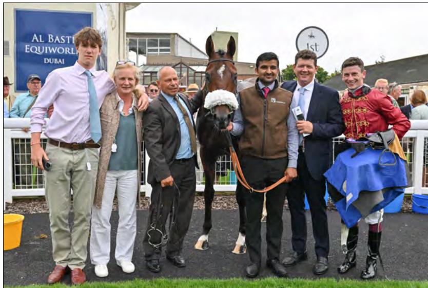
Grade 1 winner NEW CENTURY has been a great flagship for his young sire Kameko

Cool Hoof Luke had blossomed from a leggy yearling into a imposing juvenile in the Spring and, after winning on debut at Chelmsford, went very close in the Group 2 Coventry Stakes at Royal Ascot when beaten only three-quarters of a length in fourth. He ran well to be third over seven furlongs in the Group 2 Vintage Stakes at Goodwood but looked as if a return to six would suit, and so it proved when he forged home to take the Group 2 Gimcrack Stakes at York's Ebor meeting in the hands of Oisin Murphy. That form could hardly be stronger with the second, Shadow Of Light, going on to win the Middle Park and the Dewhurst. Cool Hoof Luke picked up a knock after York which prevented him from taking up intended engagements in the Mill Reef and the Middle Park, but he should be back on the track in the Spring and, as a big scopey horse who has continued to fill out and strengthen up for his time off, he should shape up into a lovely three-year-old. His Gimcrack triumph was a first win in the race for the yard