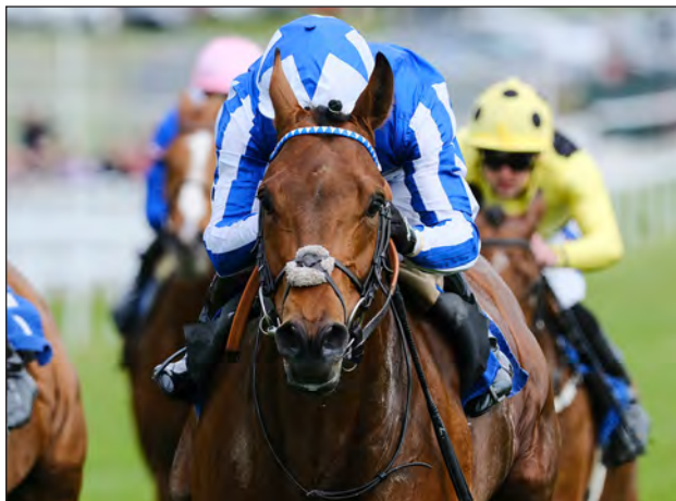
BELLUM JUSTUM netted a valuable prize in the Nashville Derby at Kentucky Downs

Having won the Group 3 Summer Stakes at York in July, Flora Of Bermuda again ran well to be first home of the British raiders in the Group 1 Prix Maurice de Gheest at Deauville in August, but was unlucky in the Group 1 Sprint Cup at Haydock when denied a clear run at a vital stage, rattling home to finish fifth. Sent off a relative outsider in the Group 1 British Champions Sprint, she ran a tremendous race to be third, beaten only a head and a neck by Kind Of Blue and Swingalong. She stays in training next year and looks to have plenty more to give, perhaps over seven furlongs as well as six. Off games since the Belmont Oaks Invitational in July, Secret Satire also returns next year and a return to York, scene of her Musidora triumph, for the Group 2 Middleton Stakes looks likely. Night Sparkle has run well twice at York this term, when second in the Group 3 Bronte Cup in May and when fourth in the Group