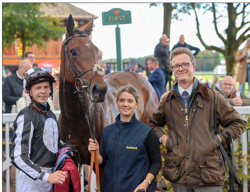
MUSIC PIECE caught the eye when winning at Haydock in September

As ever, there are plenty of unraced and lightly raced youngsters who are only now just beginning to grow into their frames and switch on to the job in hand, so there could well be more gems to be unearthed amongst an already very exciting set of rising three-year-olds. When this is coupled with a steady stream of fluffy yearlings arriving into the yard from pre-training, there is much to look forward to through the winter months. Bring on 2025! ■