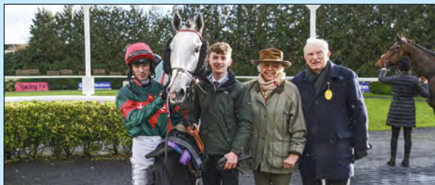
GRENHAM BAY was our busiest horse this year