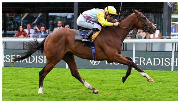
QETAIFAN won at Chester and Goodwood before selling to Hong Kong

At the other end of the trip spectrum, Tropical Storm followed in the footsteps of his half-brother Purosangue as a high class two-year-old, finishing second in the Group 2 Norfolk Stakes at Royal Ascot before going one better than his brother and winning the Listed Roses Stakes over five furlongs at York, beating subsequent Breeders' Cup Juvenile Turf Sprint winner Magnum Force. Then fourth in the Group