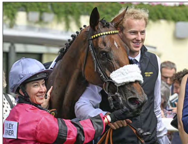
The marvellous RANCH HAND has been a great servant to the yard and the Kingsclere Racing Club