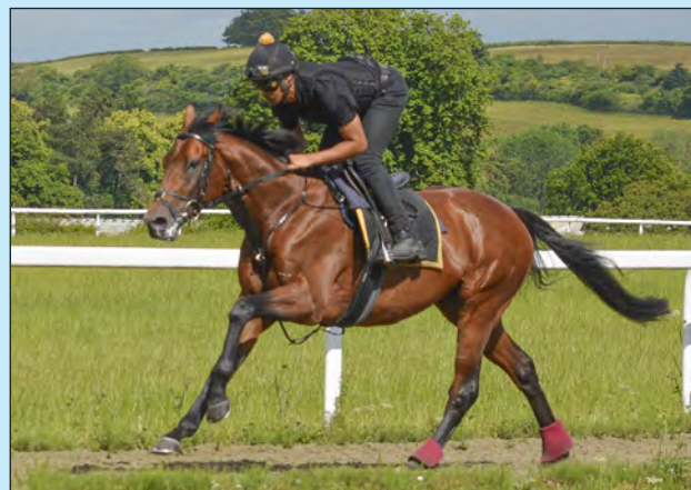
BELLUM JUSTUM was our highest earner of the year