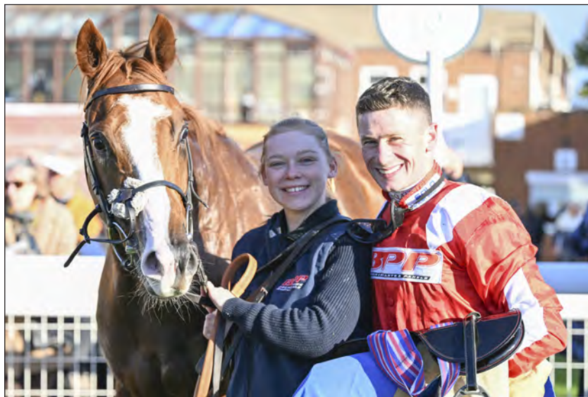
BERKSHIRE SUNDANCE has been a revelation in recent months

Alsakib was very impressive when winning the Group 3 John Smith's Silver Cup at York in July, beating the ever-consistent Al Qareem. He found life tougher at Group 2 level in the Lonsdale Cup and the British Champions Long Distance Cup, but he has now been gelded and will benefit from a good winter holiday and a chance to further strengthen and mature. He will be aimed at all the big staying contests next year. Fellow four-year-old Lieber Power had a very good season, winning at York and Chepstow and filling the runner-up spot on three occasions, including in a Class 2 at York in August. Still fairly lightly raced, he may not hit the heights of his three Stakes winning siblings but he should continue to give owners King Power Racing plenty of fun on the track. Fairbanks won twice this year and ran very well when beaten just a neck in the Class 2 Coral Summer Handicap