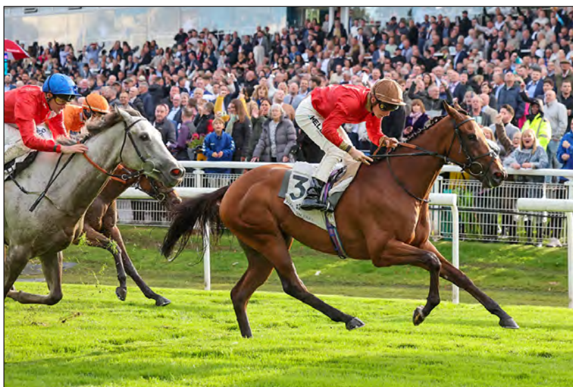
IMPERIAL EXPRESS won in Wales and in Scotland this season!

in November failed to yield black type, but she should be capable of better next year.