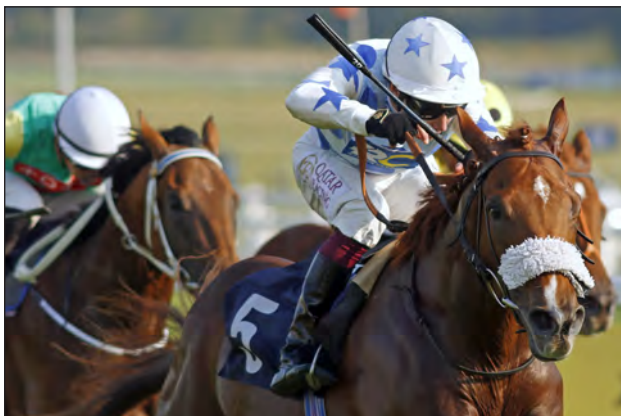
REGAL ULIXES was an easy winner of the Haynes, Hanson & Clark Stakes at Newbury