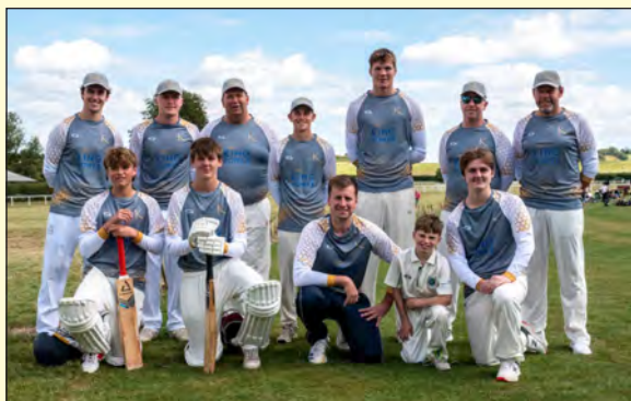
The Park House Pirates Invitational XI at the celebration of 250 years of cricket at Kingsclere

Front cover: Happy connections after KALPANA's win in the Group 1 British Champions Fillies & Mares Stakes at Ascot