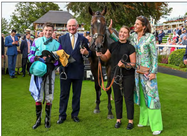
COOL HOOF LUKE with happy connections after his Gimcrack win