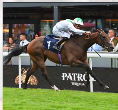
AL SHABAB STORM racked up 54 points