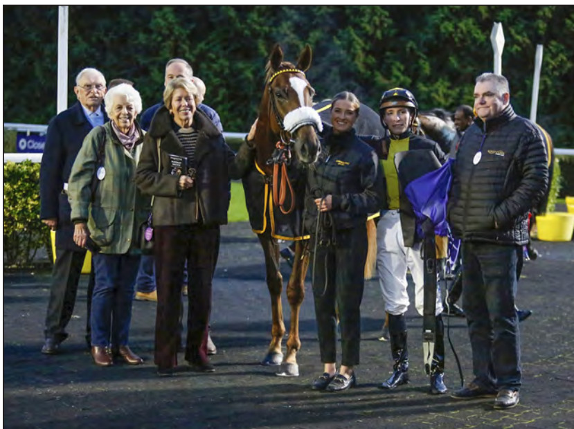
URBAN GLIMPSE with KRC members after winning at Kempton