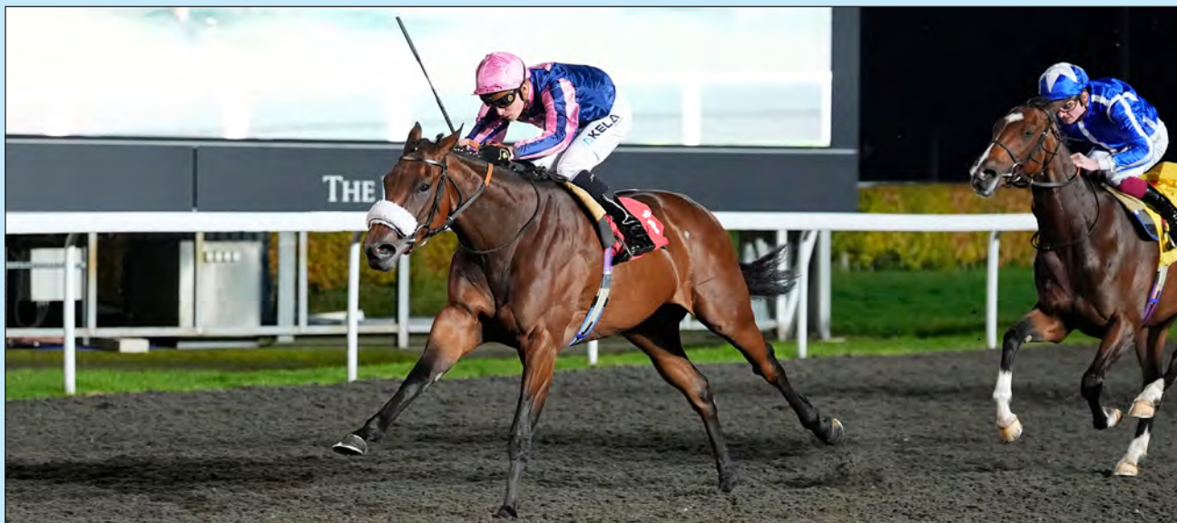
BERMUDA LONGTAIL was one of 23 winners at Kempton