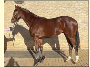
UNNAMED, Make Believe/ Heat Of The Day colt Lot 89, Tattersalls December Yearlings

£34,000 plus VAT (priced up to 1 December)