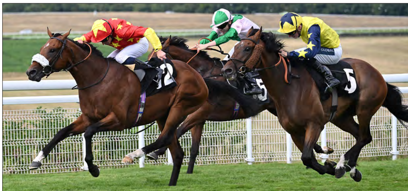
GLADIUS putting his rivals to the sword at Goodwood under William Buick