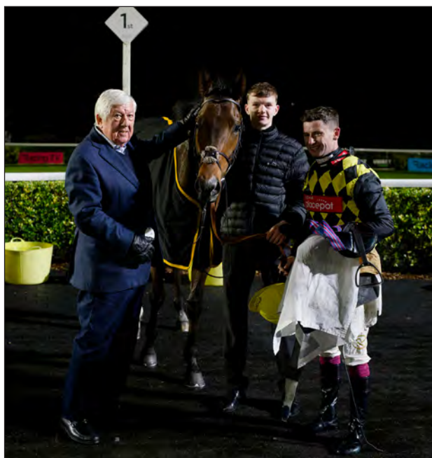
The much-missed TUSCAN STAR after winning at Kempton in February