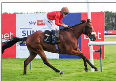
BELGRAVIAN was leading point scorer even before his recent Haydock win!