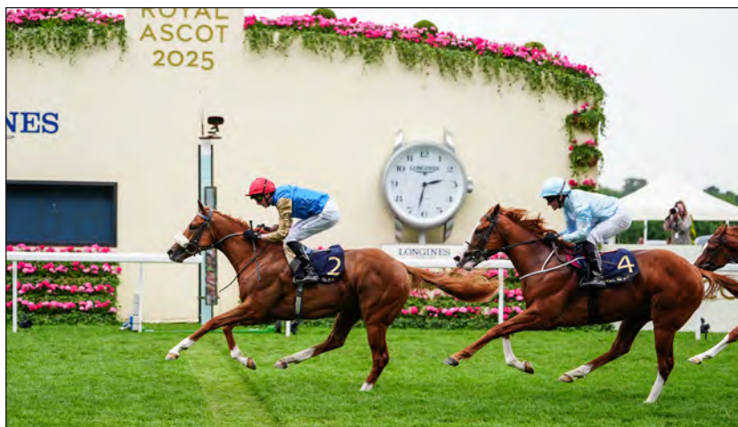
HUMIDITY carries the colours of Wathnan Racing to victory in the Listed Chesham Stakes

Cheveley Park homebred Humidity faced no less than seventeen rivals when making his debut at Newbury in May but proved undaunted by the task, making all and seeing off persistent challenges to win by a short head. A full brother to Holloway Boy, who won the Listed Chesham Stakes at the Royal meeting on his debut, Humidity headed to Ascot with the task to emulate his sibling and duly completed that mission, cruising clear in the colours of his new owners Wathnan Racing to win by a length under James Doyle. A consummate professional with a great attitude, he was therefore disappointing in the Group 2 Vintage Stakes at Goodwood, although not helped by a wide draw. Hopefully he can bounce back from that and the Listed Ascendant Stakes at Haydock is likely to be his next target.