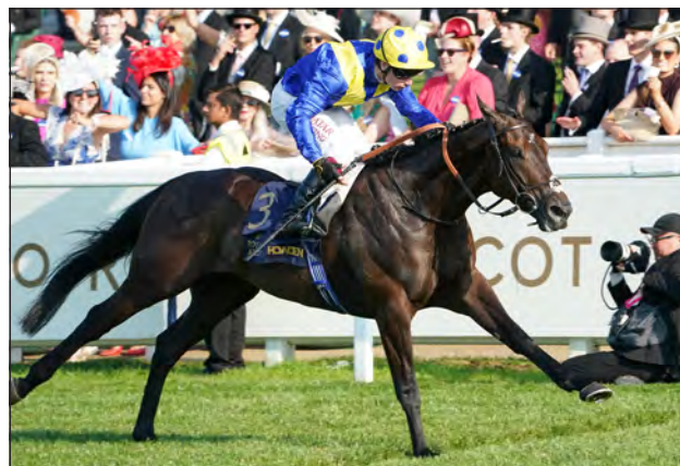
NEVER SO BRAVE won the Buckingham Palace Stakes at Royal Ascot and followed up with a Group 2 win in the Summer Mile

Another daughter of Blue Point flew the flag for the Kingsclere fillies at Royal Ascot, with Miss Information winning the Kensington Palace Fillies' Handicap on the second day under an inspired ride from Oisin Murphy. This was her second win of the season, having annexed the seven-furlong handicap at Newmarket's Guineas meeting in May, and her fifth career win. Slow out back at Newmarket on her next start, she also ended up with plenty to do in the Shergar Cup Mile but can do better and will likely seek some black type to augment her pedigree page before the season is out. She has been a wonderful