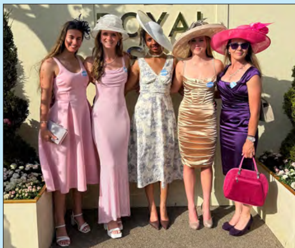
Don't they scrub up well! Staff members at Royal Ascot