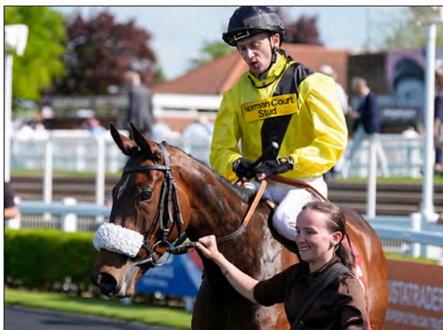
MISS INFORMATION was the first of four Royal Ascot winners for the yard this year

York has also been a happy hunting ground for Flora Of Bermuda , who won the Group 3 Summer Stakes there last year and finished a very close second to Inisherin in the Group 2 Clipper Stakes on her seasonal reappearance. Like See The Fire she put in a good performance at the Royal meeting to be third, in her case in the Group 1 Queen Elizabeth II Jubilee Stakes behind French raider Lazzat and Japanese raider Satono Reve, having had to switch right to make her run. She missed the break in the Group 1 July Cup having reared in the stalls and had no chance from then on, so a line can be put through that. She has had a break since Newmarket and is now being prepared for the Group 1 Haydock Sprint Cup in early September, a race in which she finished fifth last year after meeting trouble in running. Diminutive but plucky, she is a wonderful filly and will no doubt give her new owners Wathnan Racing more good days at marquee meetings.