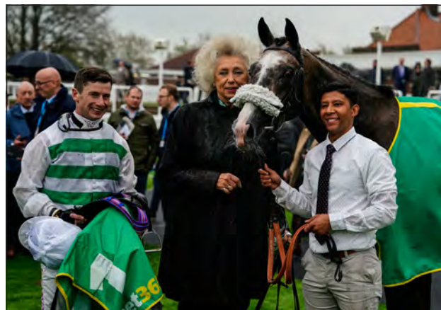
ALMERIC confirmed early promise when winning the Feilden Stakes at Newmarket in April