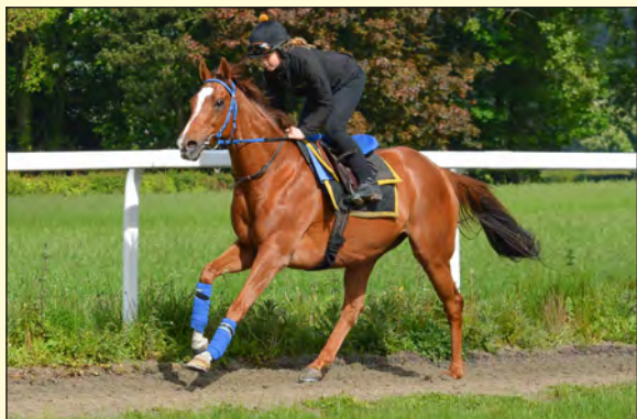
Above: Farewell to Kingsclere warrior and Group 2 winner TULLIUS, who died peacefully in his paddock at HEROS last month at the age of seventeen