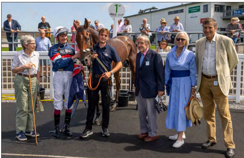
FANTASY WORLD with members of Kennet Valley Thoroughbreds after winning at Ffos Las