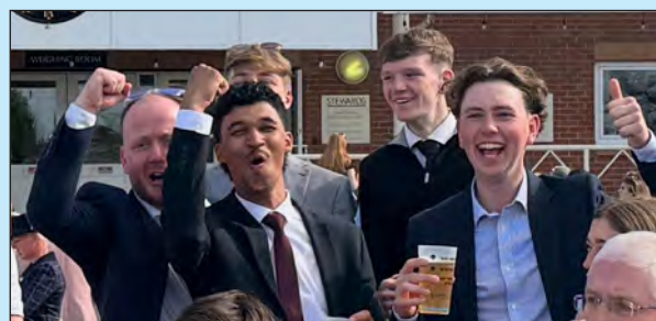
Some of the lads enjoying a night out at Newbury