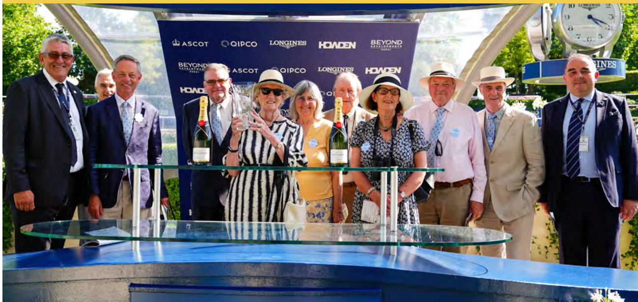
Happy members of the KRC collecting the trophy for the win of Mount Atlas at Ascot

M ount Atlas got the summer started for the Kingsclere Racing Club with a comfortable win at Ascot in July, one month on from a fine fifth in the Duke of Edinburgh Stakes at the Royal meeting. It was fantastic to have a runner at Royal Ascot and, unsurprisingly, it was a very well-attended day's racing by Club members! He is likely to head to York next and we are hoping he can go on to establish himself at Pattern level in due course.