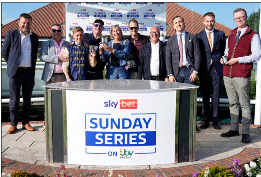
Happy connections of MARCHOGION after his win at Newmarket in May