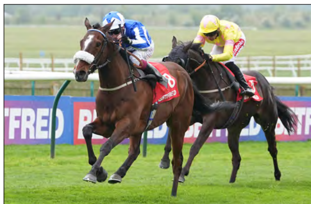
FOX LEGACY has won impressively at Newmarket, York and Goodwood this term

King Power's Fox Legacy was another to join the yard from Sir Michael Stoute, and won the Suffolk Stakes handicap at