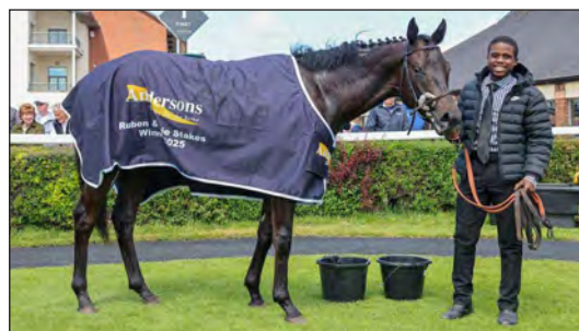
Dual winner and Super Sprint third SANDS OF SPAIN was bought at the Somerville Sale last year

A s the days shorten our thoughts turn to the yearling sales and the exciting process of trawling the sales grounds to find lovely young horses to join the yard. Members of the team will be at the Goffs UK Premier Yearling Sale at Doncaster (27-28 August), Tattersalls Somerville Yearling Sale (2 September), BBAG Premier Yearling Sale (5 September), Tattersalls Ireland September Yearling Sale (23-24 September), Goffs Orby Sale (29-30 September) and Tattersalls October Yearling Sale (7-17 October). Please get in touch if you would like to be involved. ■