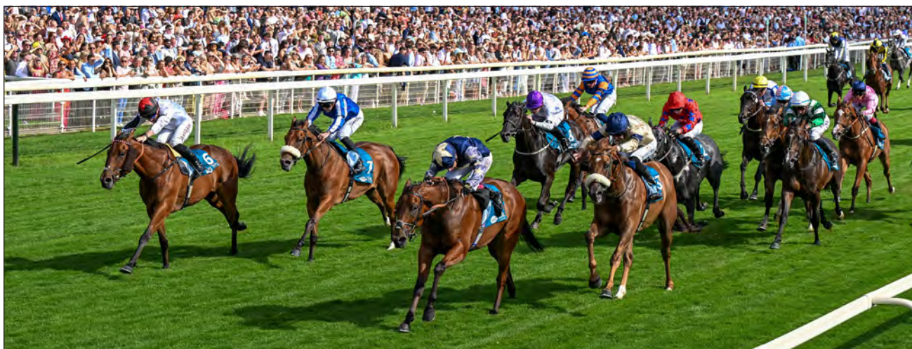
DREAM OUT LOUD (near side) winning in front of packed stands at York in June

scuppered by a poor draw in the Group 3 Chester Vase in May but seemed to relish the step up in trip to fourteen furlongs in the Group 2 Queen's Vase at Royal Ascot, staying on strongly to be second to Scandinavia despite having been keen early on. His run in the Bahrain Trophy at Newmarket's July meeting was disappointing but it was his second outing in a month on quick ground and he may not have appreciated that. He could tackle the Group 3 Geoffrey Freer Stakes back at Newbury or the Great Voltigeur at York next, and holds an entry in the St Leger. He should get his preferred conditions as we head towards the Autumn and give his owners The Merry Pranksters plenty more good days.