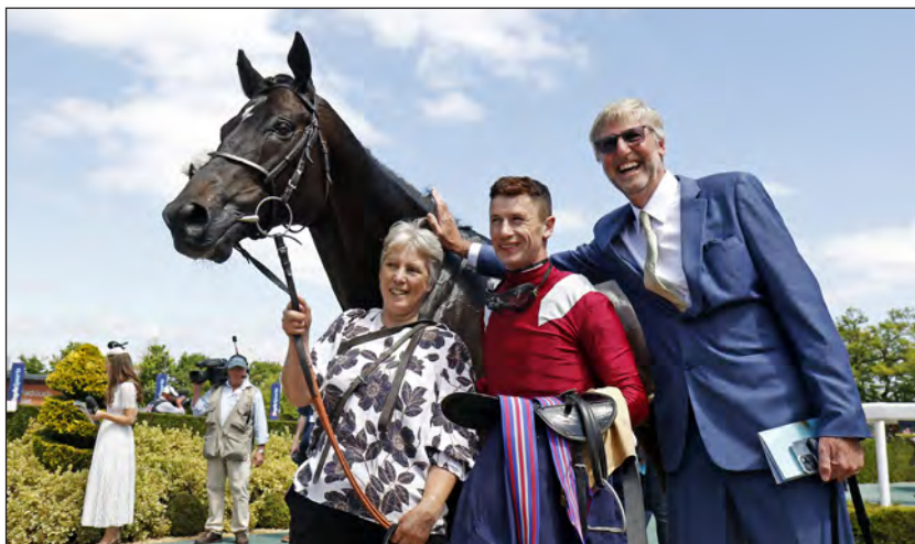
The gorgeous EYDON after winning the Group 3 Aston Park at Newbury

A round-up of older horses would not be complete without mention of the marvellous King's Lynn , who got his head in front in a Class 2 handicap over seven furlongs at Haydock