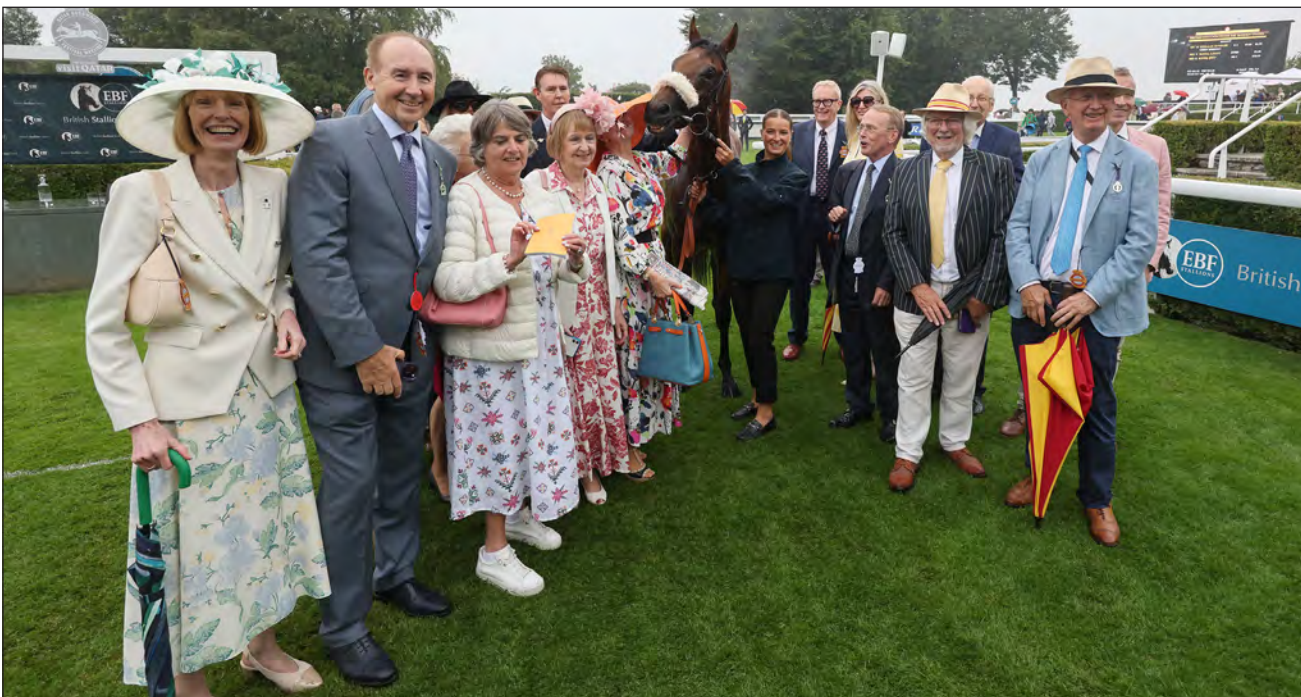
A big gang of Royal Ascot Racing Club members greet Stellar Sunrise after his win at Goodwood

As ever there are a host of lovely horses who have not made it into this already lengthy report, including many unexposed two- and three-year-olds who could well thrive in the latter part of the season. Much to look forward to – onwards and upwards! ■