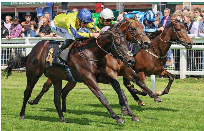
SANDS OF SPAIN has won twice and placed third in the Weatherbys Super Sprint