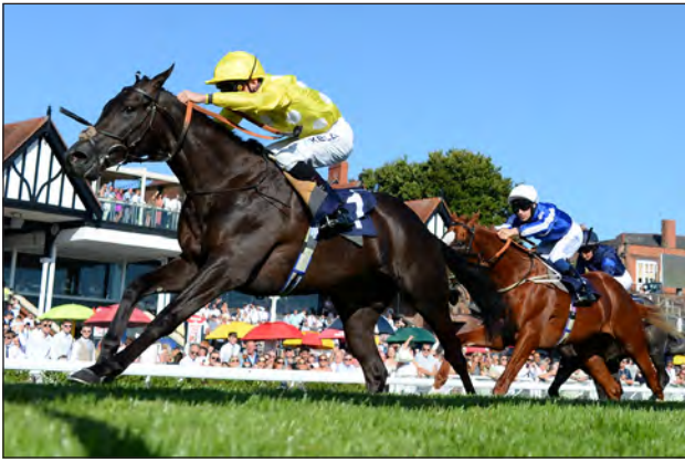
SIR ALBERT is a tough cookie and has already won three times this term