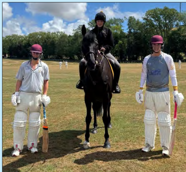
SIDE GLANCE with the Park House Pirates' opening batsmen