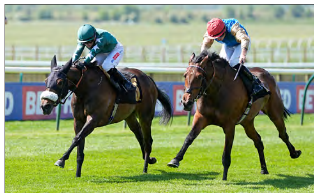
ZGHARTA, a daughter of Ghaiyyath, won well at Newmarket under Hollie Doyle

Chaldean's half-sister Kassaya looked full of promise as a juvenile, having won at Nottingham before getting no luck in the Queen Mary at last year's Royal Meeting. Then sidelined for a prolonged period with an injury, she made a winning return at Sandown in July, taking a Class 2 handicap over the minimum trip under Colin Keane. She was not disgraced in the Listed Queensferry Stakes at Chester on her latest start but got rather outpaced on the tight track. Different conditions should see her in a different light and Juddmonte's daughter of Kingman is well capable of adding to her already impressive pedigree page. Newsells Park Stud's Hatysa is also beautifully bred, being by Derby winner Sea The Stars and out of a half-sister to Derby winner Harzand. She is not quite at their level